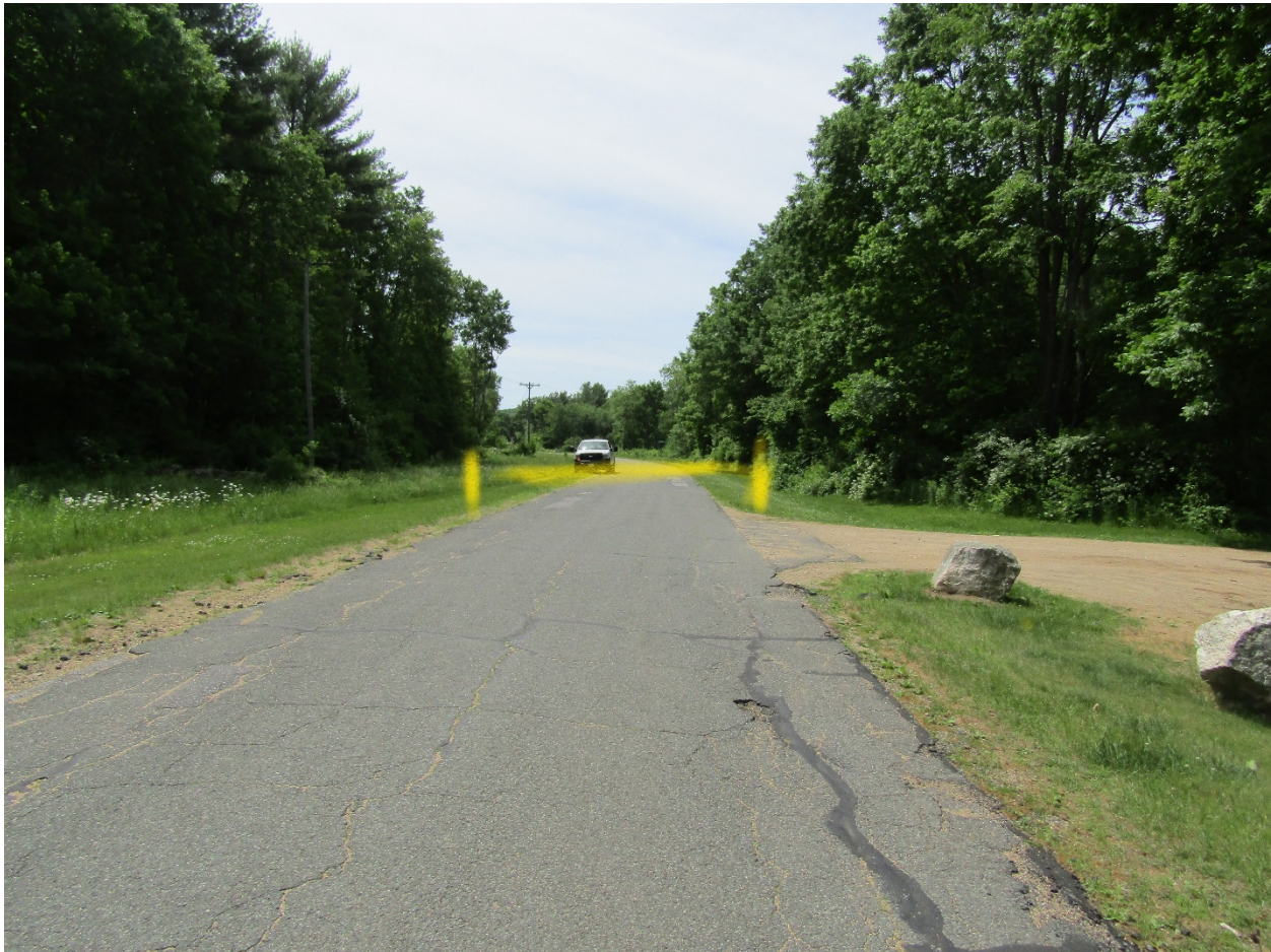
Informational Photo Number 5: Barre Falls Dam location for double leaf gate installation (sketch of general gate location). Coldbrook Road in Hubbardston, MA