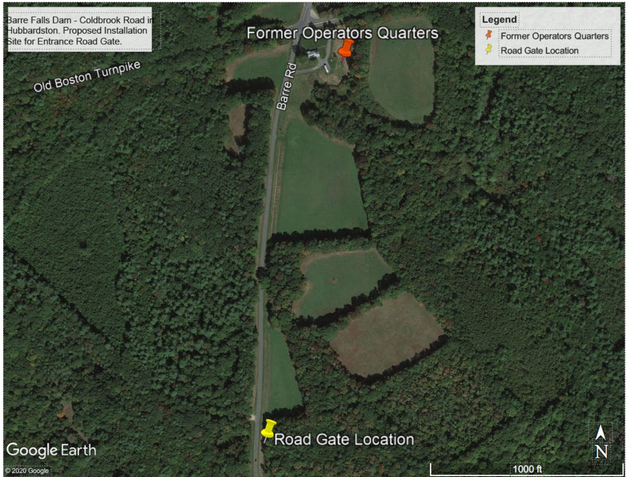
Informational Photo Number 4: Barre Falls Dam location for double leaf gate installation. Coldbrook Road in Hubbardston, MA