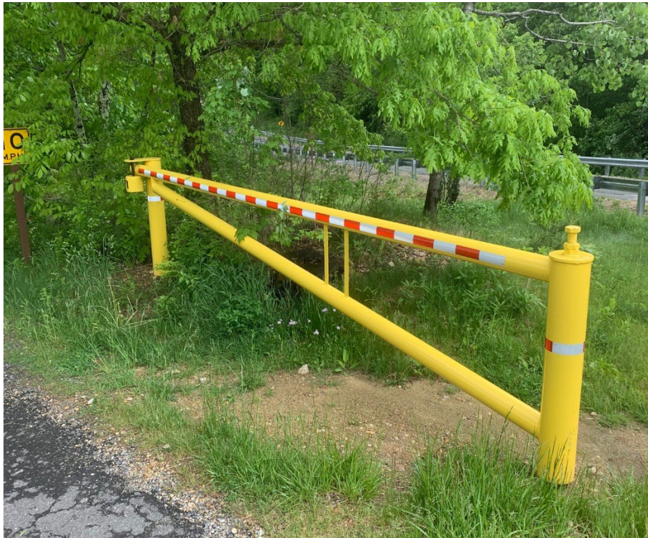
Informational Photo Number 6: Example of government-furnished single-arm gate to be installed at Barre Falls Dam and Birch Hill Dam (currently in the open position).