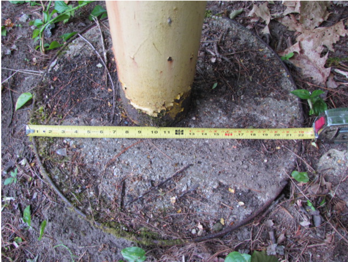
Informational Photo Number 9: Example of gate footings to be installed.

Informational Photos Location 2: Birch Hill Dam