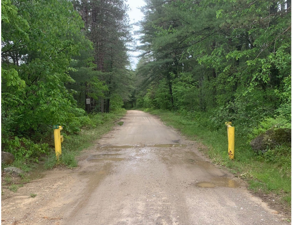
Informational Photo Number 3: Barre Falls Dam location for single leaf gate removal and installation. Coldbrook Road in Oakham, MA