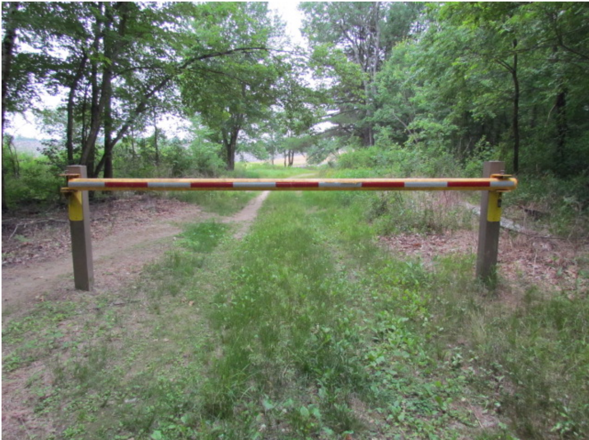
Informational Photo Number 7: Existing bar gate and posts on River Road to be removed and replaced. Exact location of new gate to be coordinated with technical point of contact.