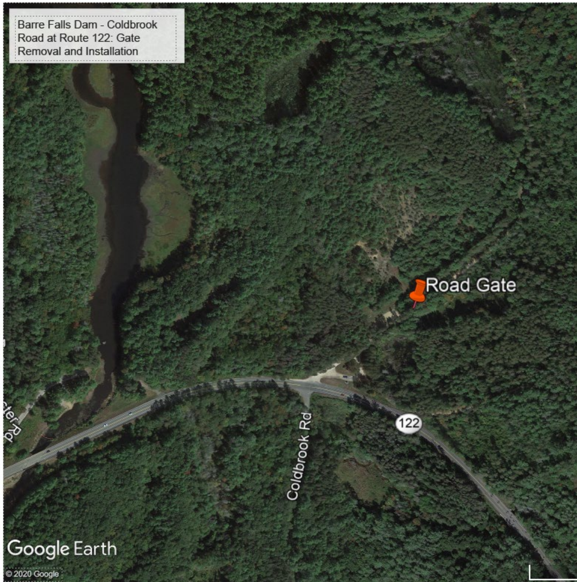
Informational Photo Number 2: Barre Falls Dam location for single leaf gate removal and installation. Coldbrook Road in Oakham, MA