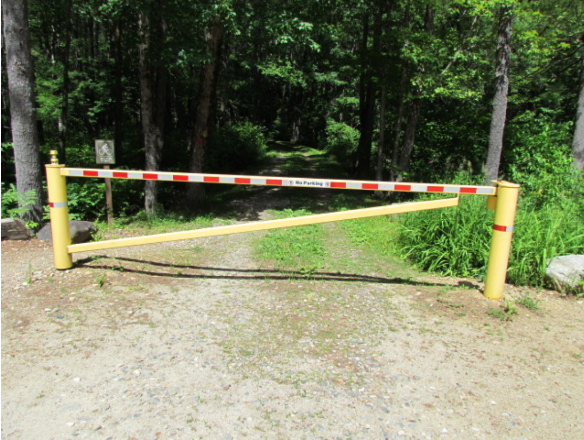
Informational Photo Number 8: Example of gate to be installed.