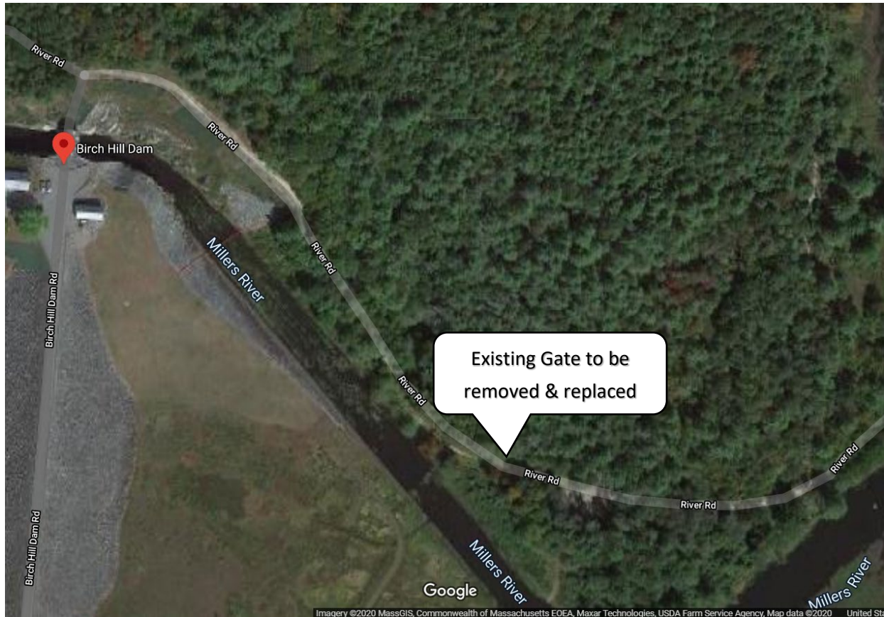
Informational Photo Number 10: Location of road gate on River Road near Millers River Canoe Launch. GPS coordinates (42.6309, -72.1197). Exact location of new gate to be coordinated with technical point of contact