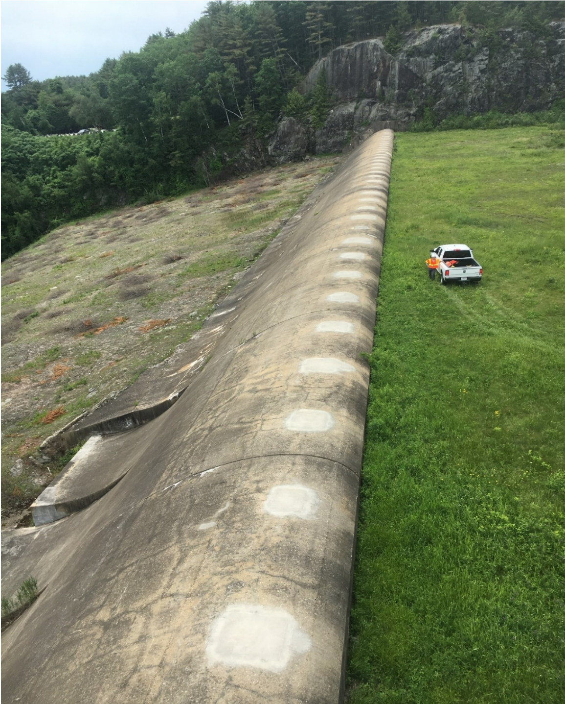
Informational Photo 1: Reference View of Spillway at Franklin Falls Dam.