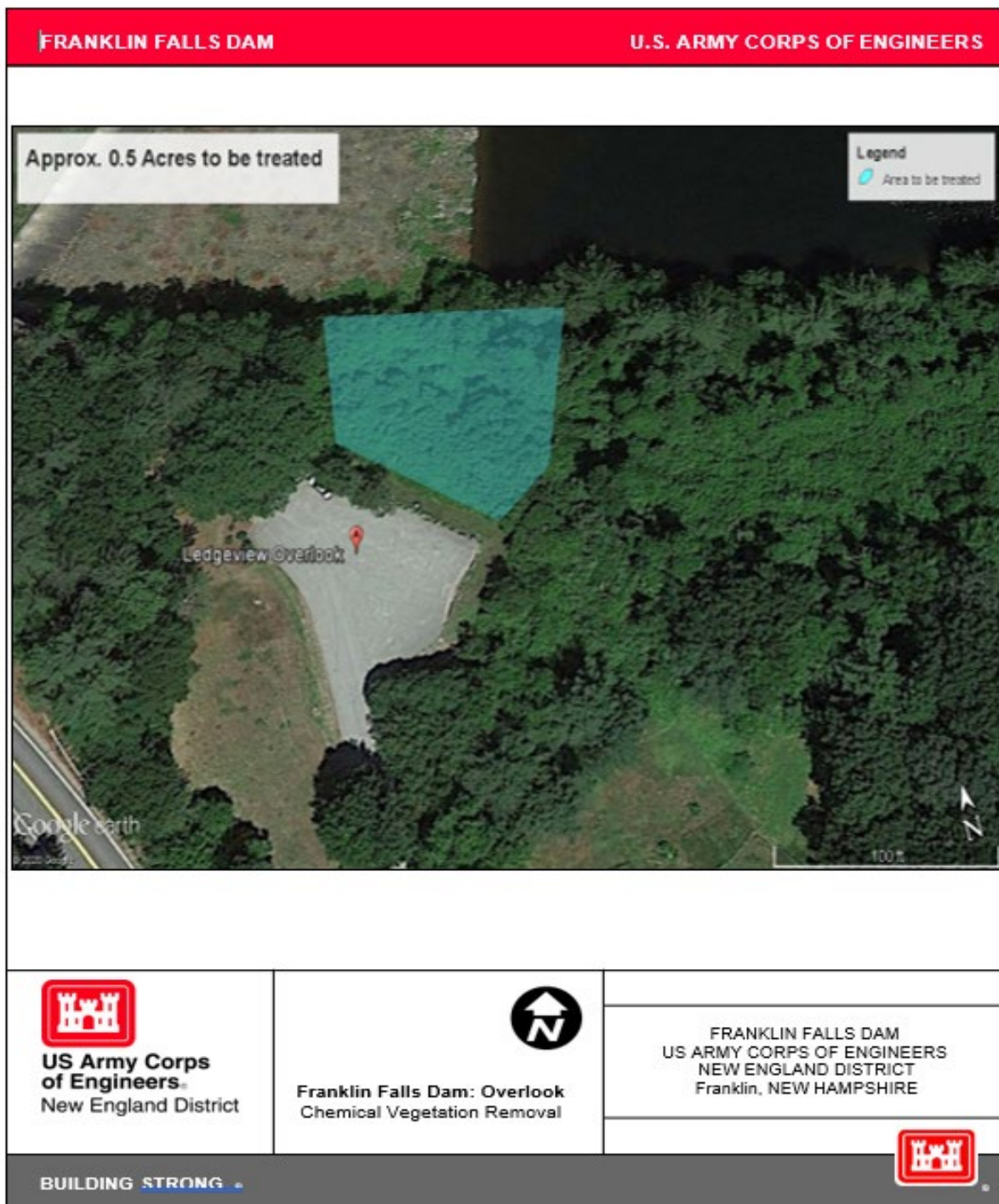
Informational Map 3: Overlook Recreation area, Access from Route 3 in Franklin NH Woody Vegetation to be sprayed (Sumac)