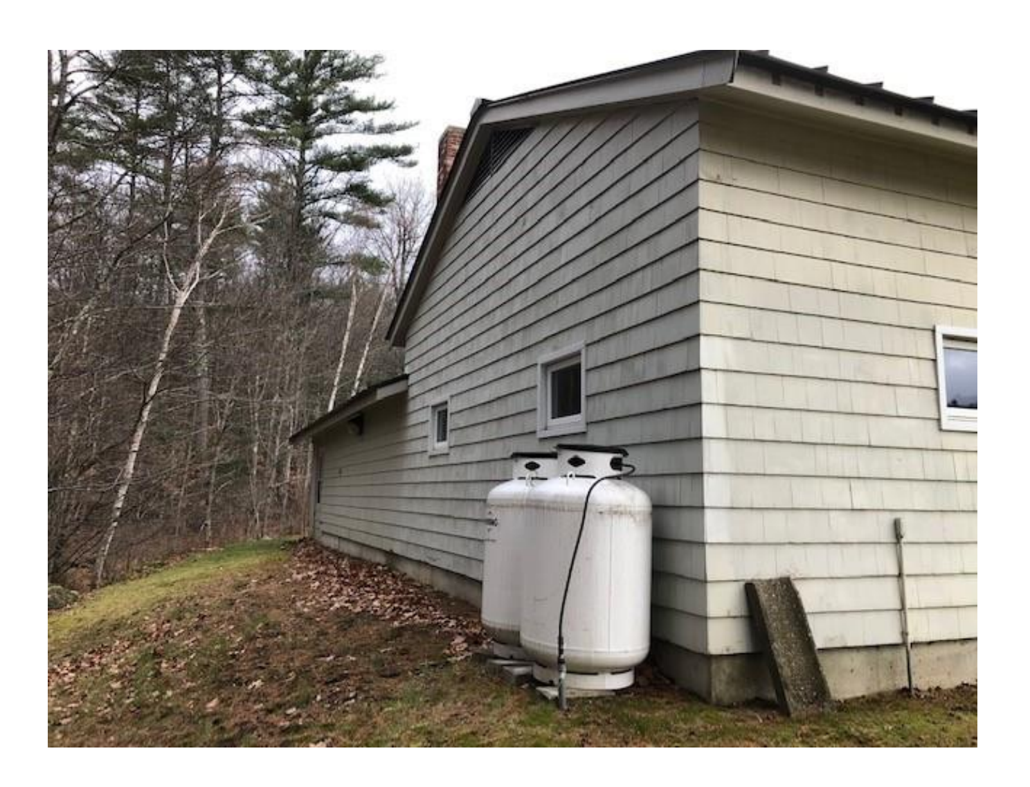
Exhibit E: Rear access to Blackwater Dam office building. Picture is taken from east side looking west.

Blackwater Dam Webster NH Statement of Work