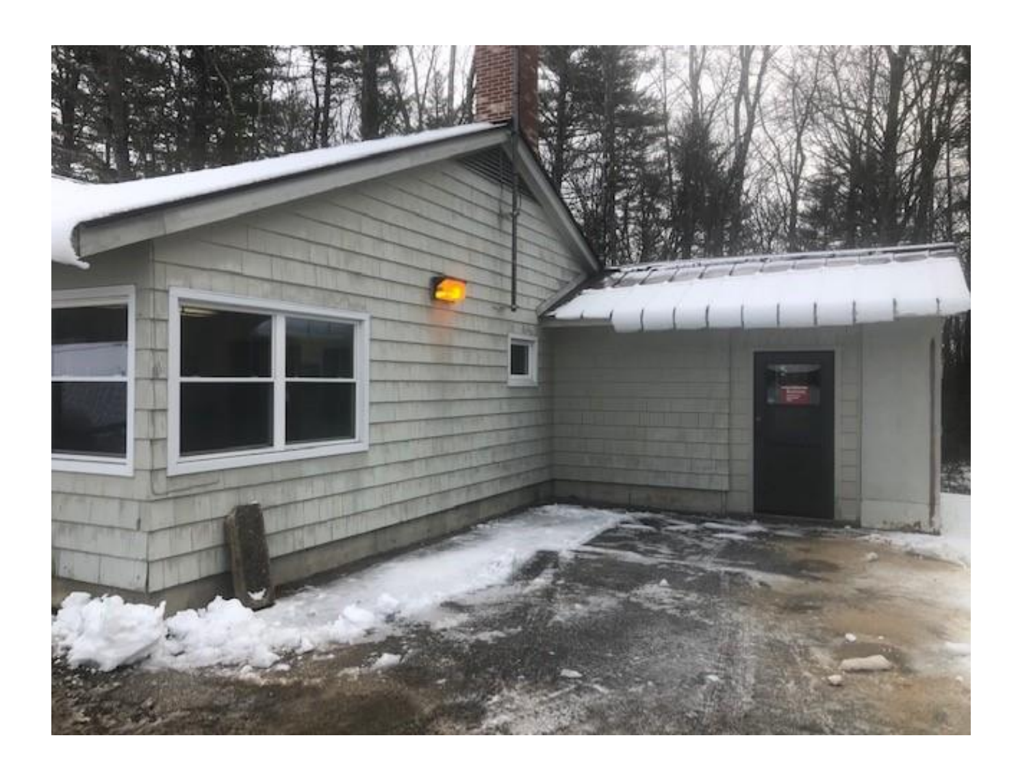
Exhibit D: Blackwater Dam office Building front and west side access.

Blackwater Dam Webster NH Statement of Work