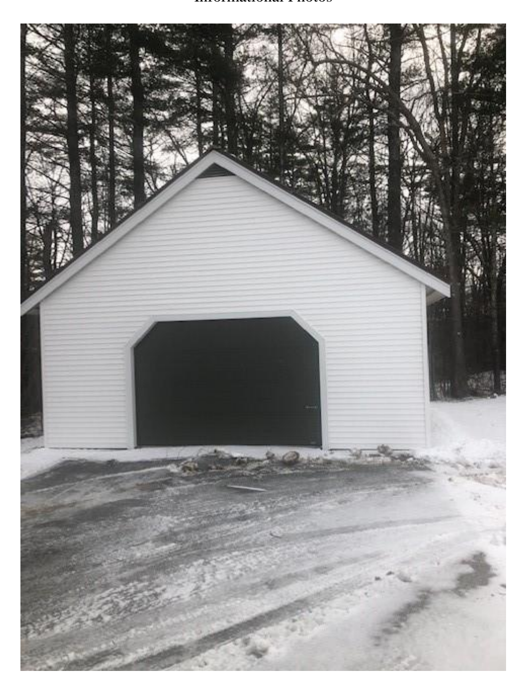
Exhibit F: Example of white vinyl siding to match. There is a small amount of this type of white siding available to the contractor.

Blackwater Dam Webster NH Statement of Work