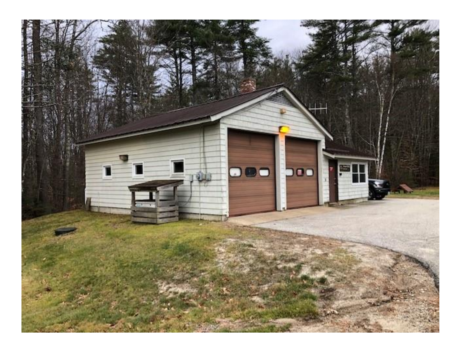
Exhibit C: Blackwater Dam office Building front and east side access.

Blackwater Dam Webster NH Statement of Work