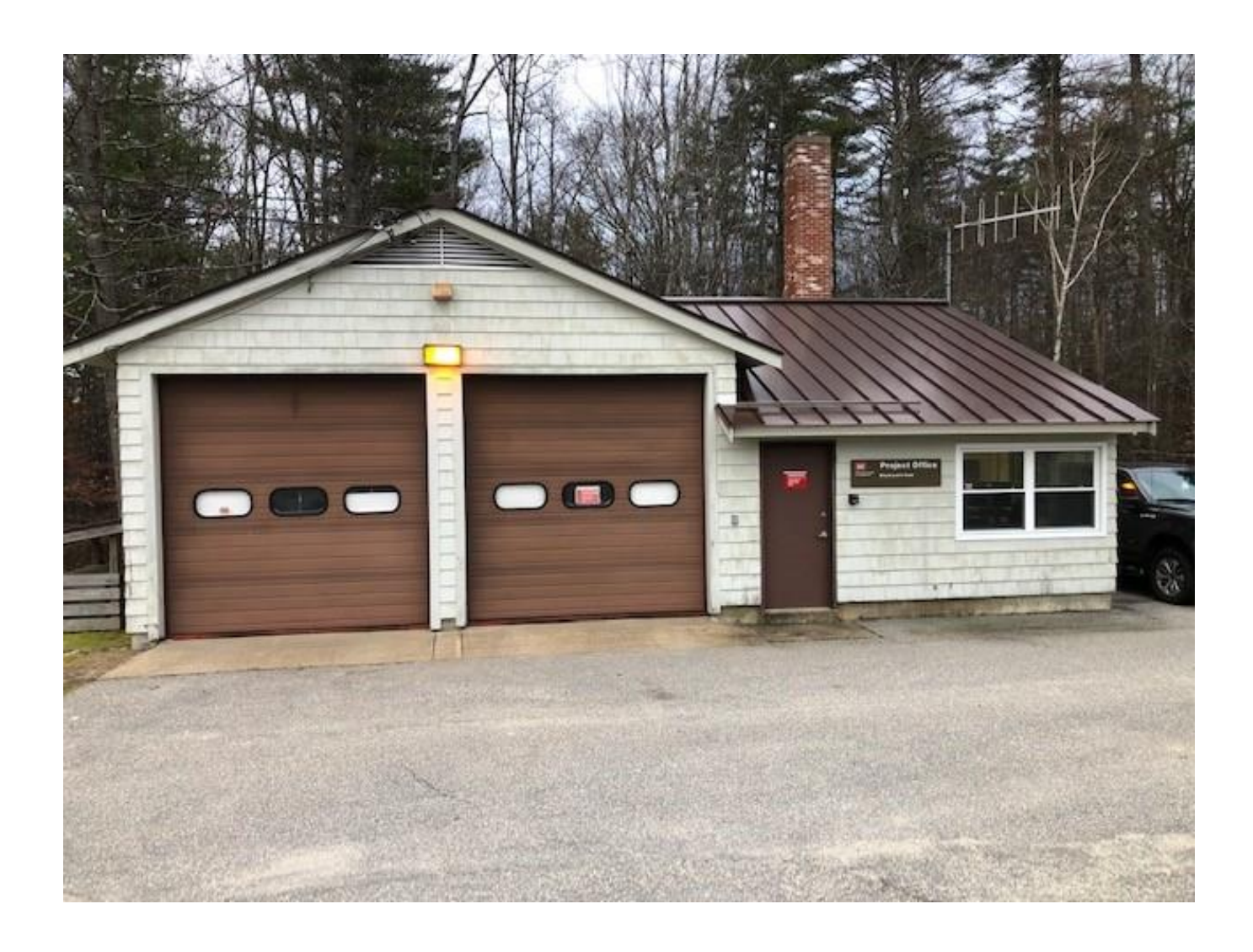
Exhibit B: Blackwater Dam Office Building; front access.

Blackwater Dam Webster NH Statement of Work