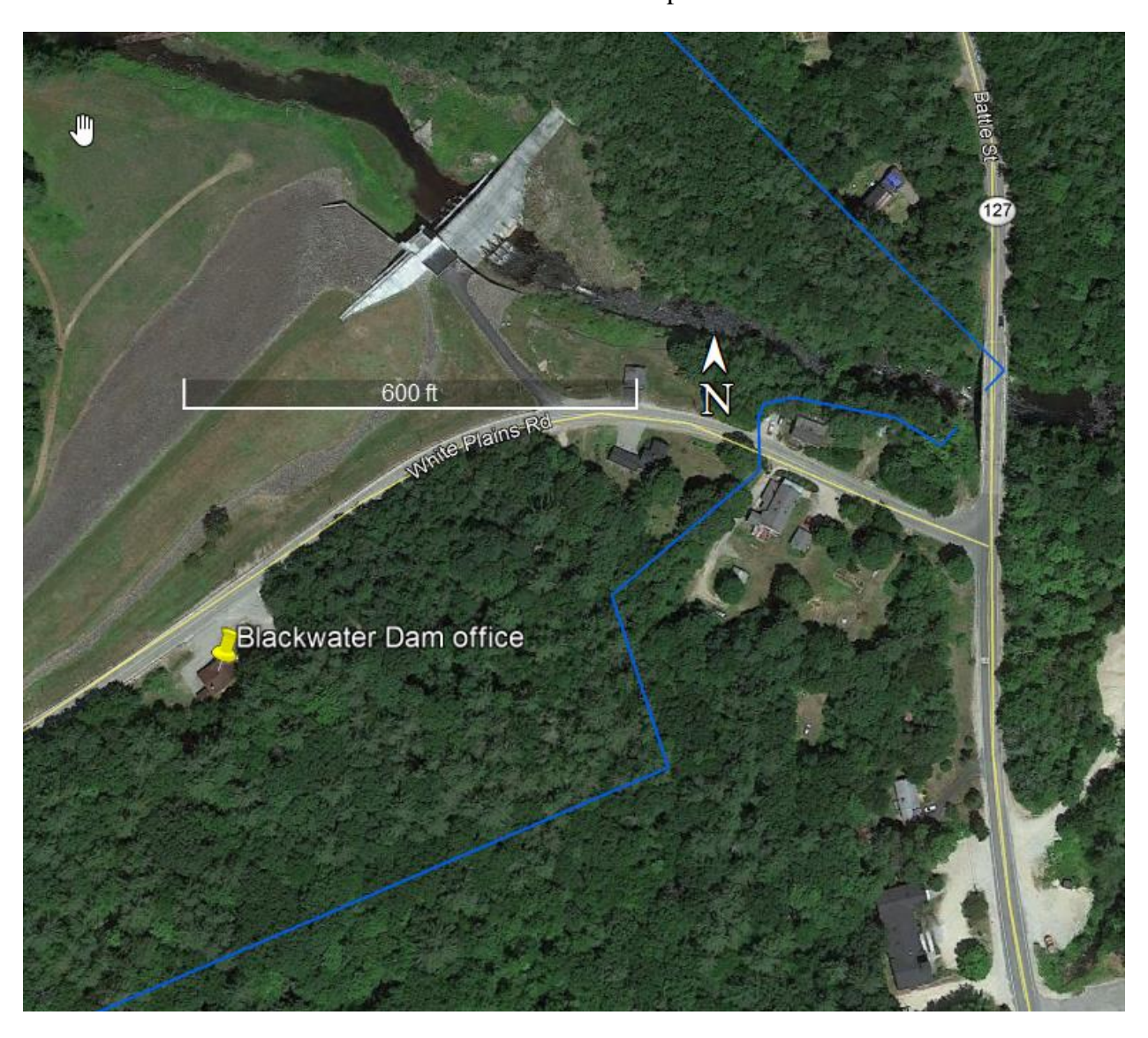
Exhibit A: Blackwater Dam Office Building