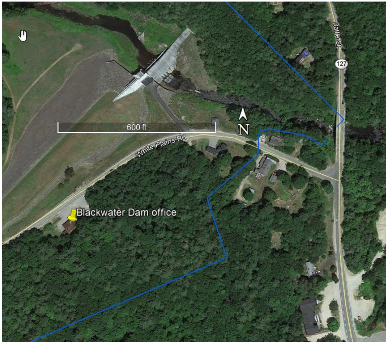
Exhibit A: Blackwater Dam Office Building