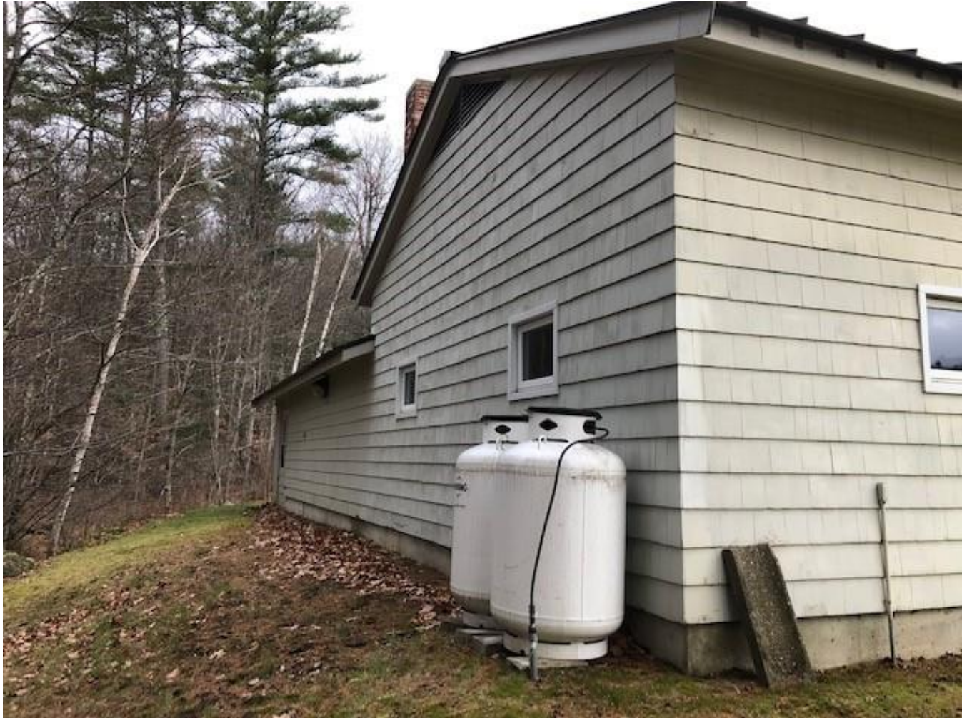
Exhibit E: Rear access to Blackwater Dam office building. Picture is taken from east side looking west.