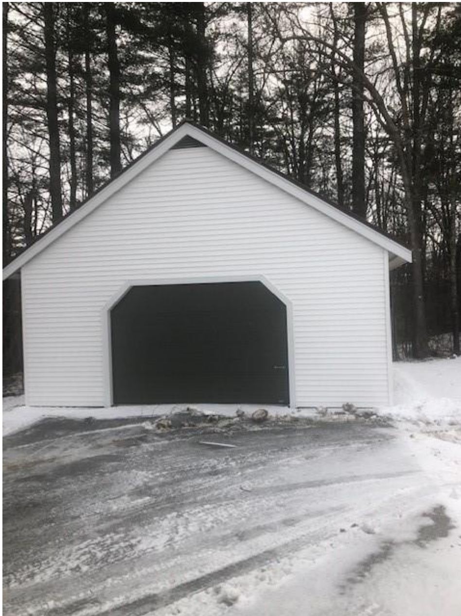
Exhibit F: Example of white vinyl siding to match. There is a small amount of this type of white siding available to the contractor.