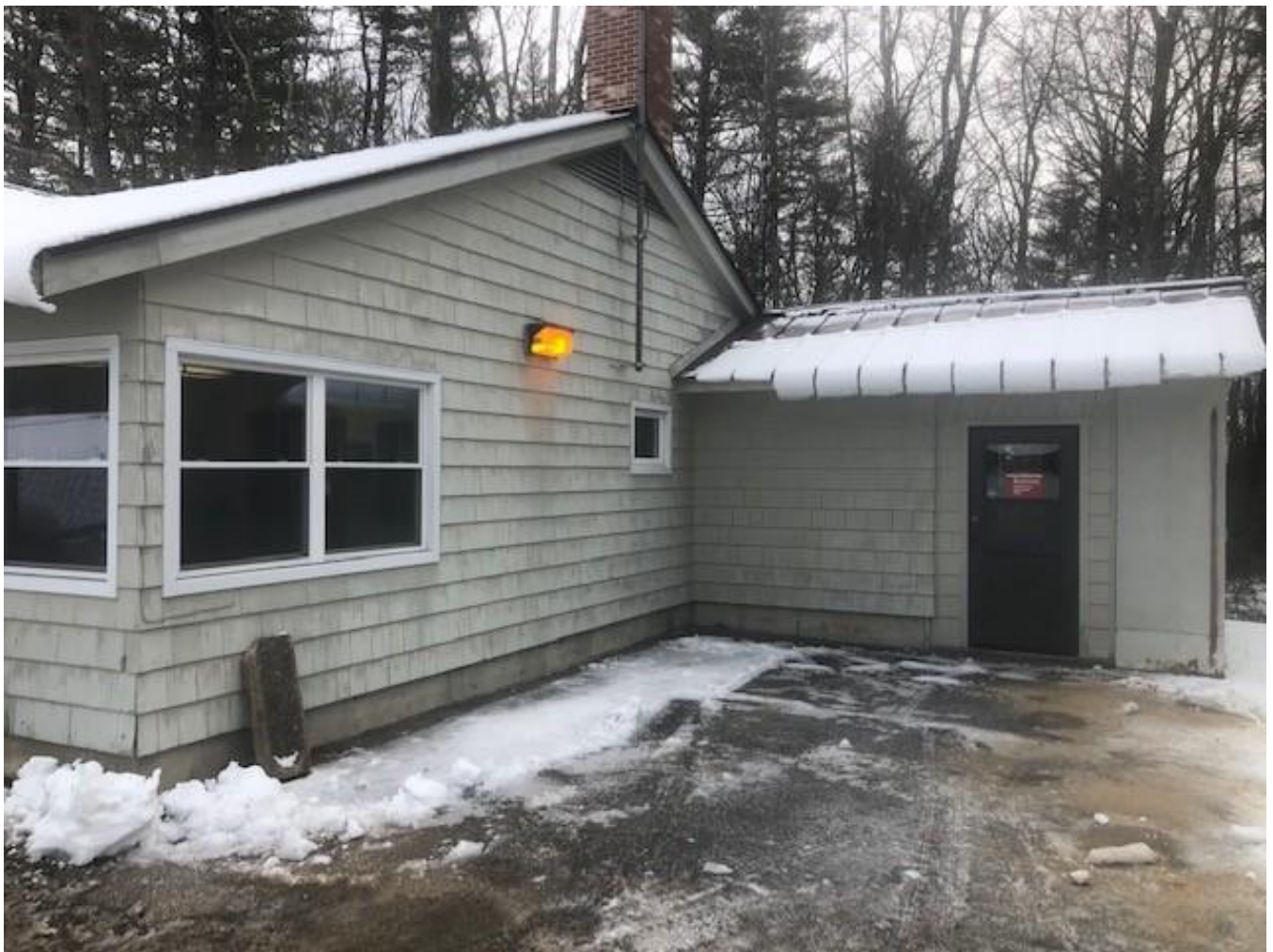
Exhibit D: Blackwater Dam office Building front and west side access.