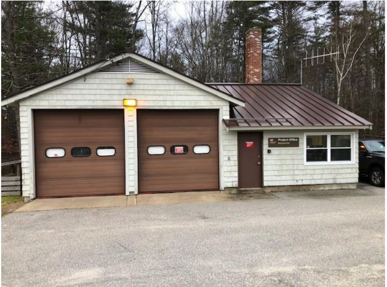
Exhibit B: Blackwater Dam Office Building; front access.