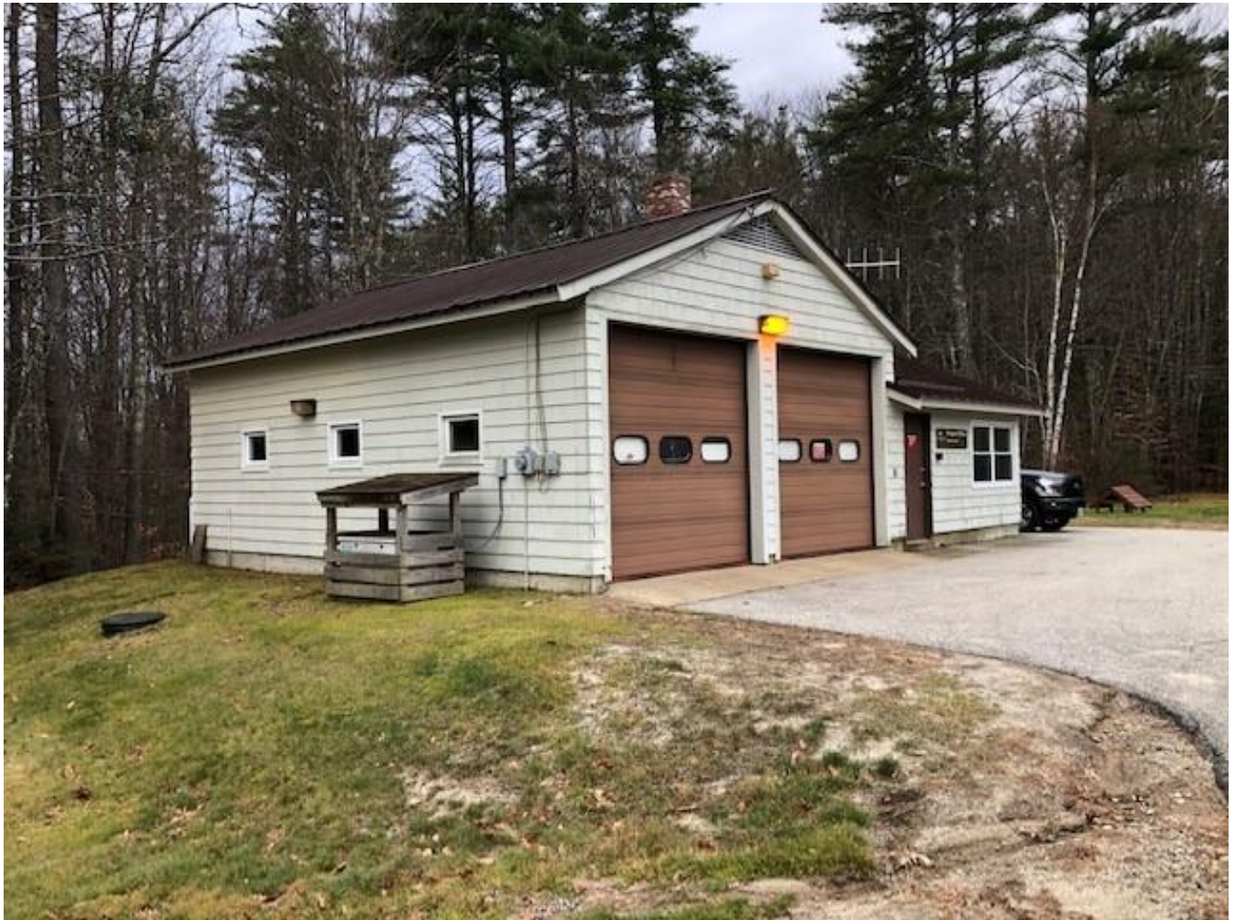
Exhibit C: Blackwater Dam office Building front and east side access.