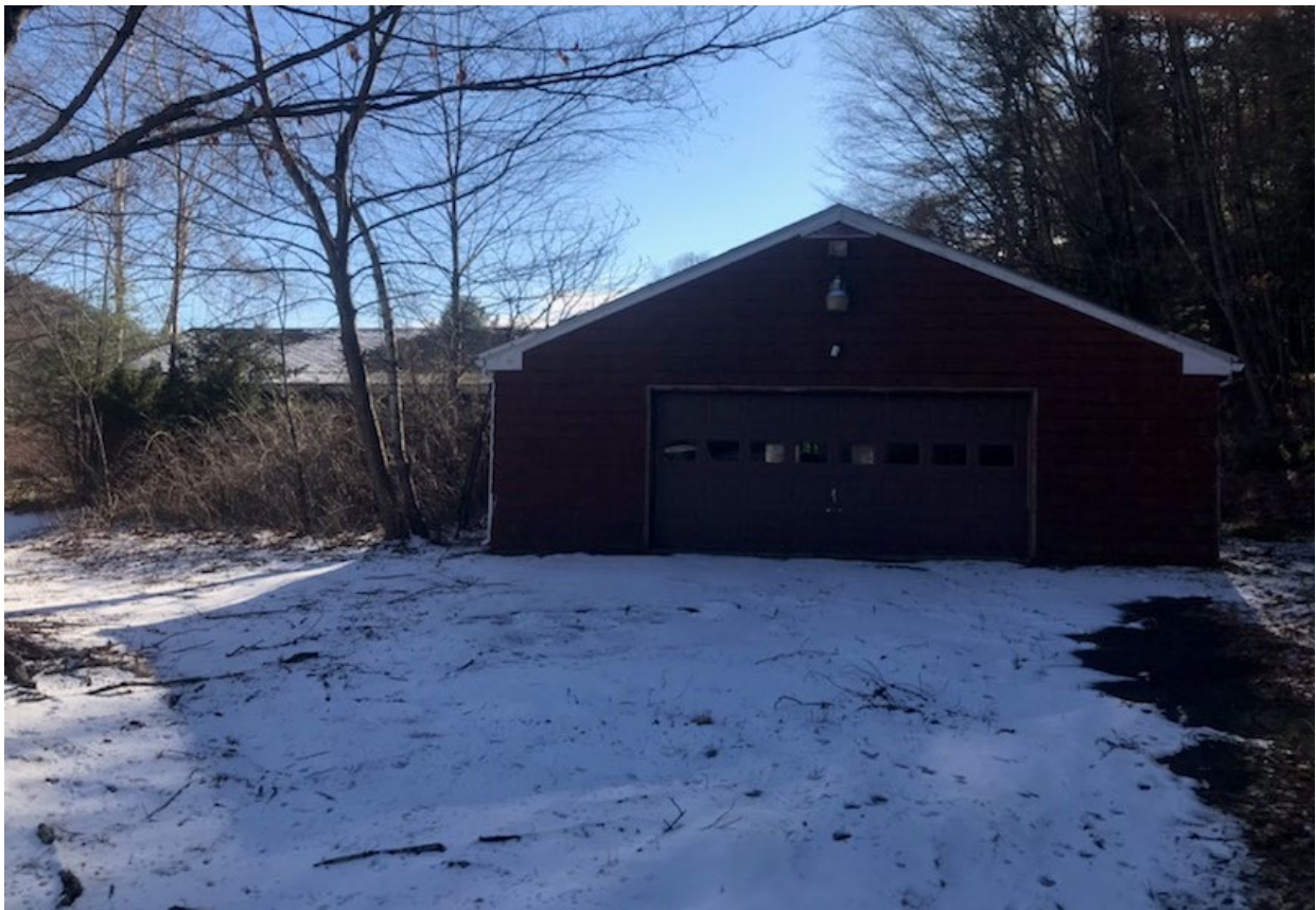
Photo #2: Littleville Lake Ops Quarters existing conditions. The photo is intended to provide context to the nature of the work. Any estimate of quantity or type of material should be determined during a site visit prior to the submission of a quote.