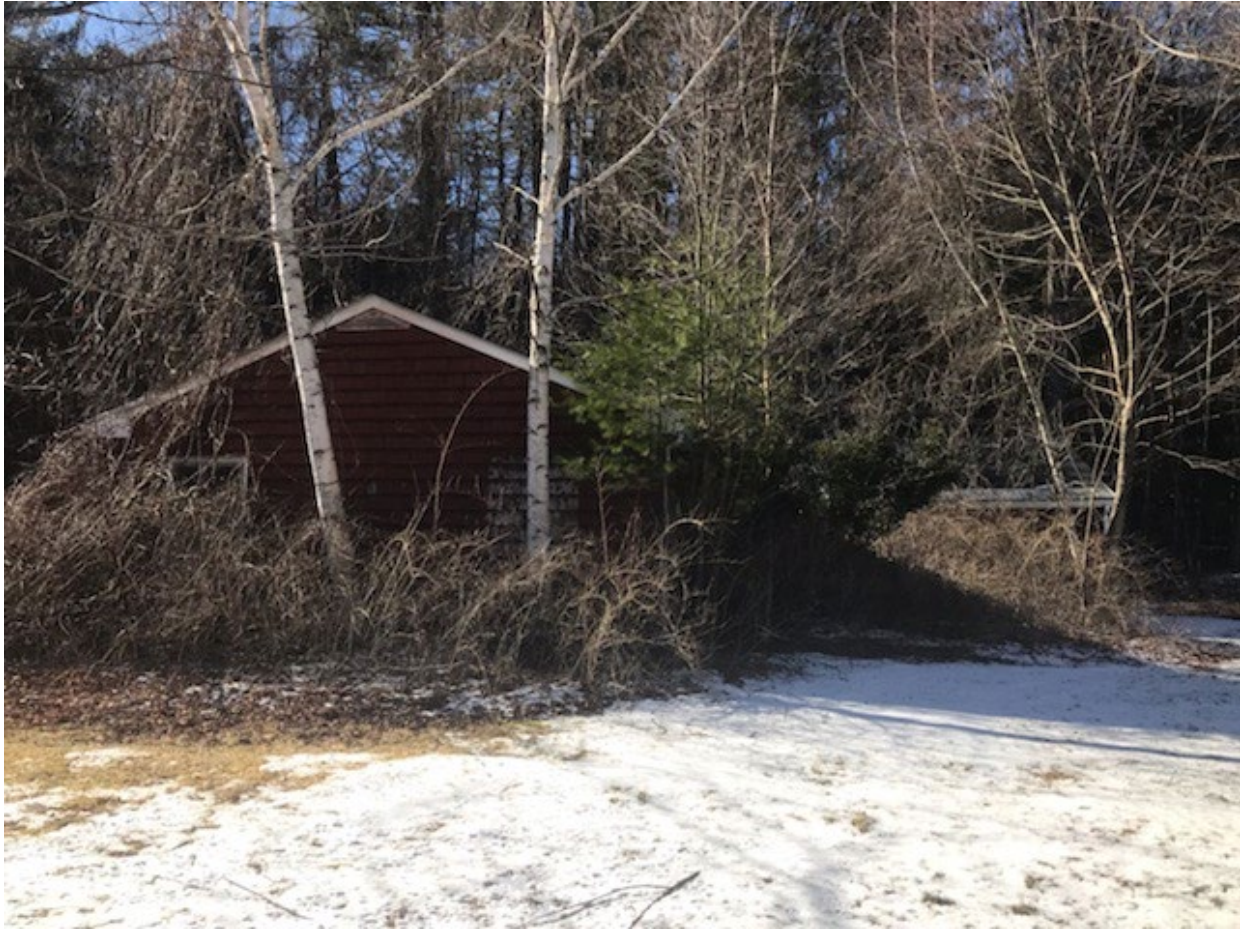
Photo #1: Littleville Lake Ops Quarters existing conditions. The photo is intended to provide context to the nature of the work. Any estimate of quantity or type of material should be determined during a site visit prior to the submission of a quote.