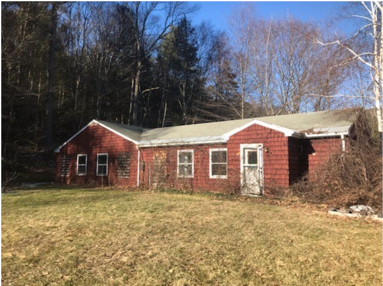
Photo #3: Littleville Lake Ops Quarters existing conditions. The photo is intended to provide context to the nature of the work. Any estimate of quantity or type of material should be determined during a site visit prior to the submission of a quote.