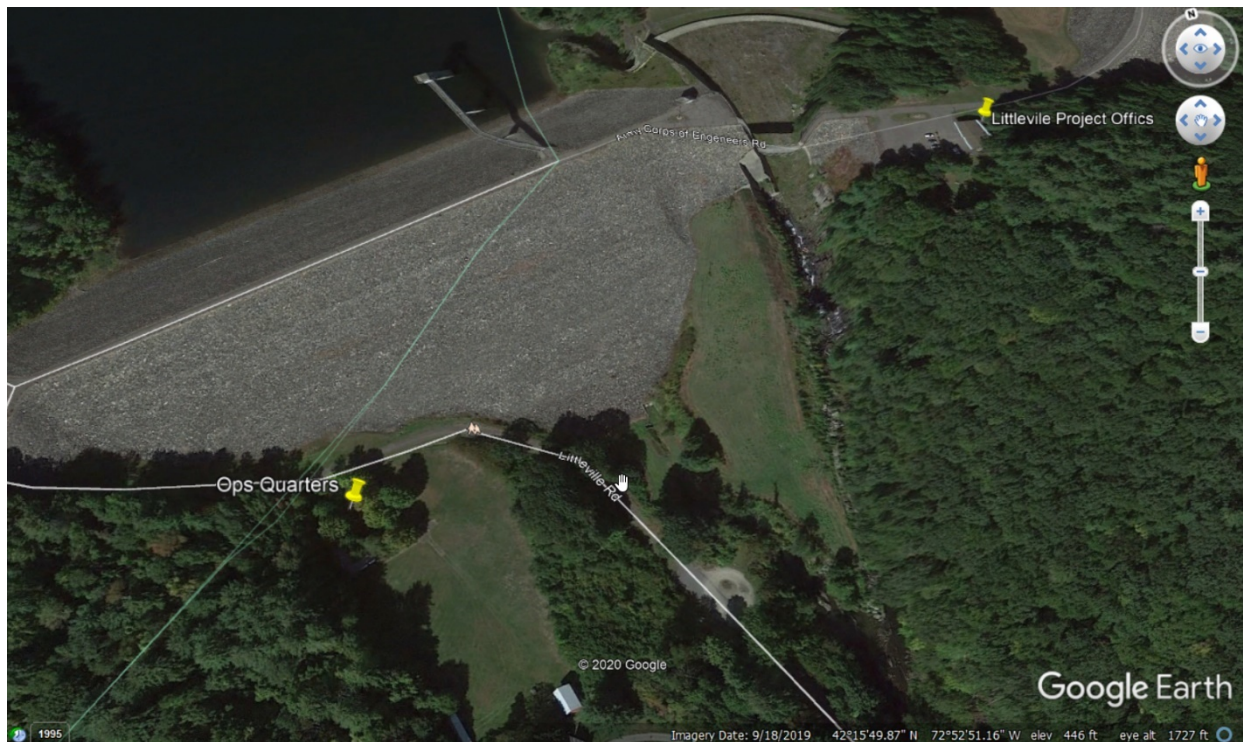
Informational Photo 4