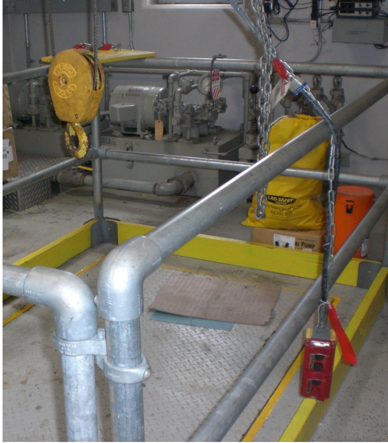
Stamford Hurricane Barrier Hoist (West Side Building) (Photo's 7-10)