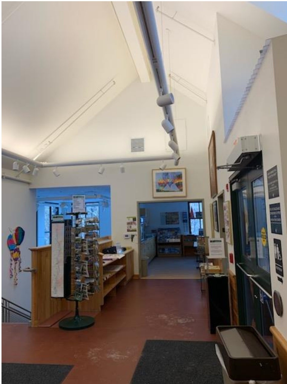
Informational Photo 1: Main Entry View 1