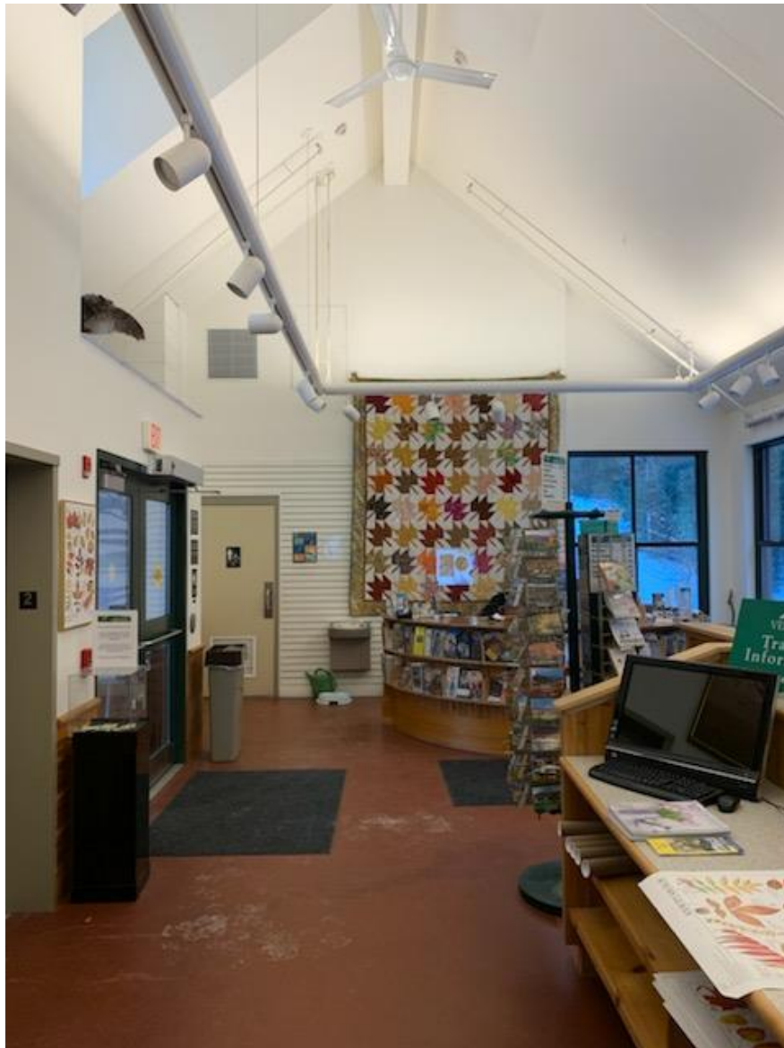
Informational Photo 2: Main Entry View 2