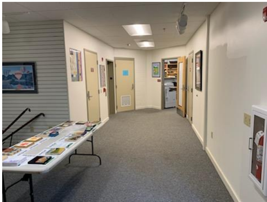
Informational Photos 6&7: Lower Hallway