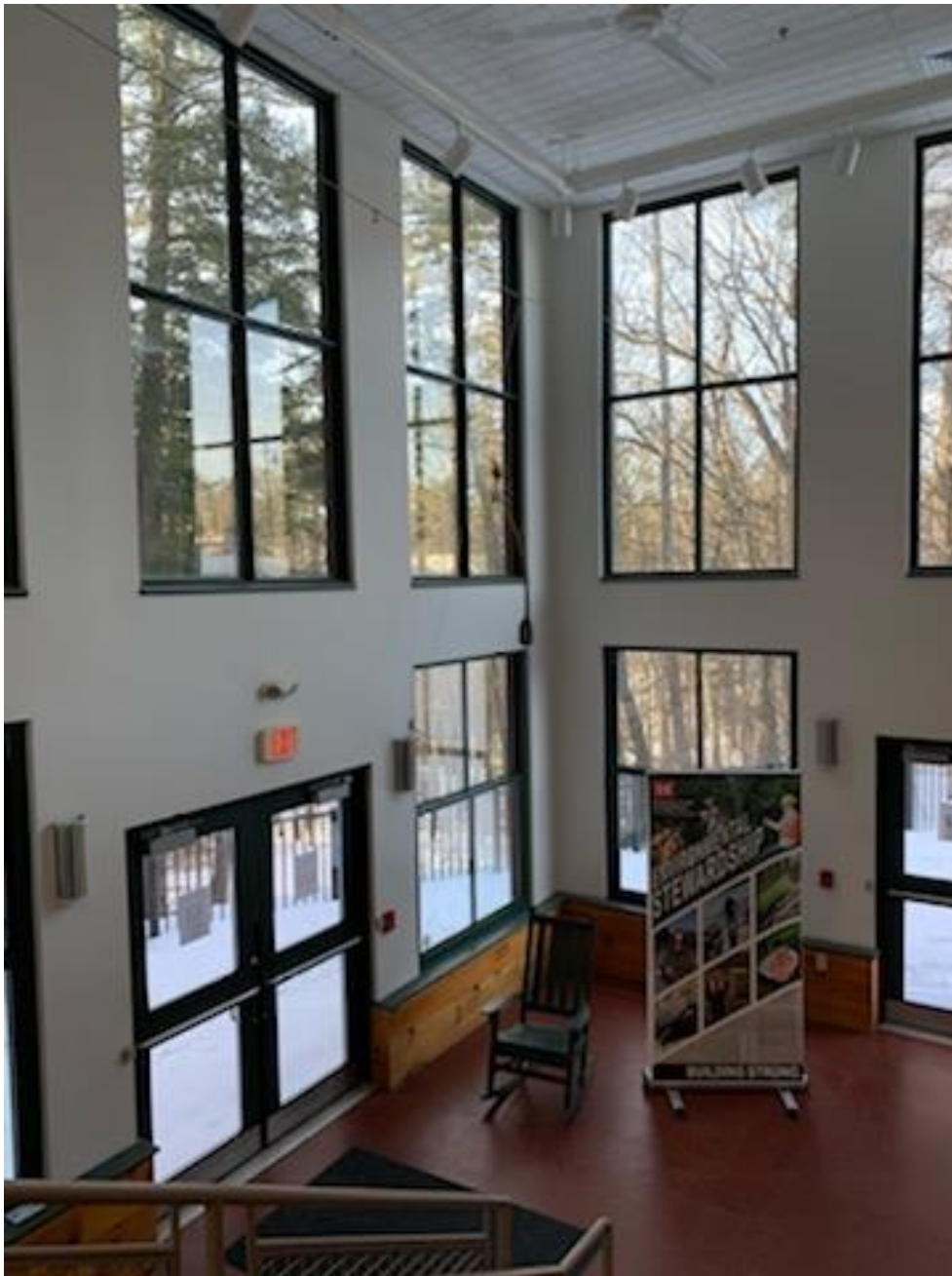
Informational Photo 5: Lower Foyer