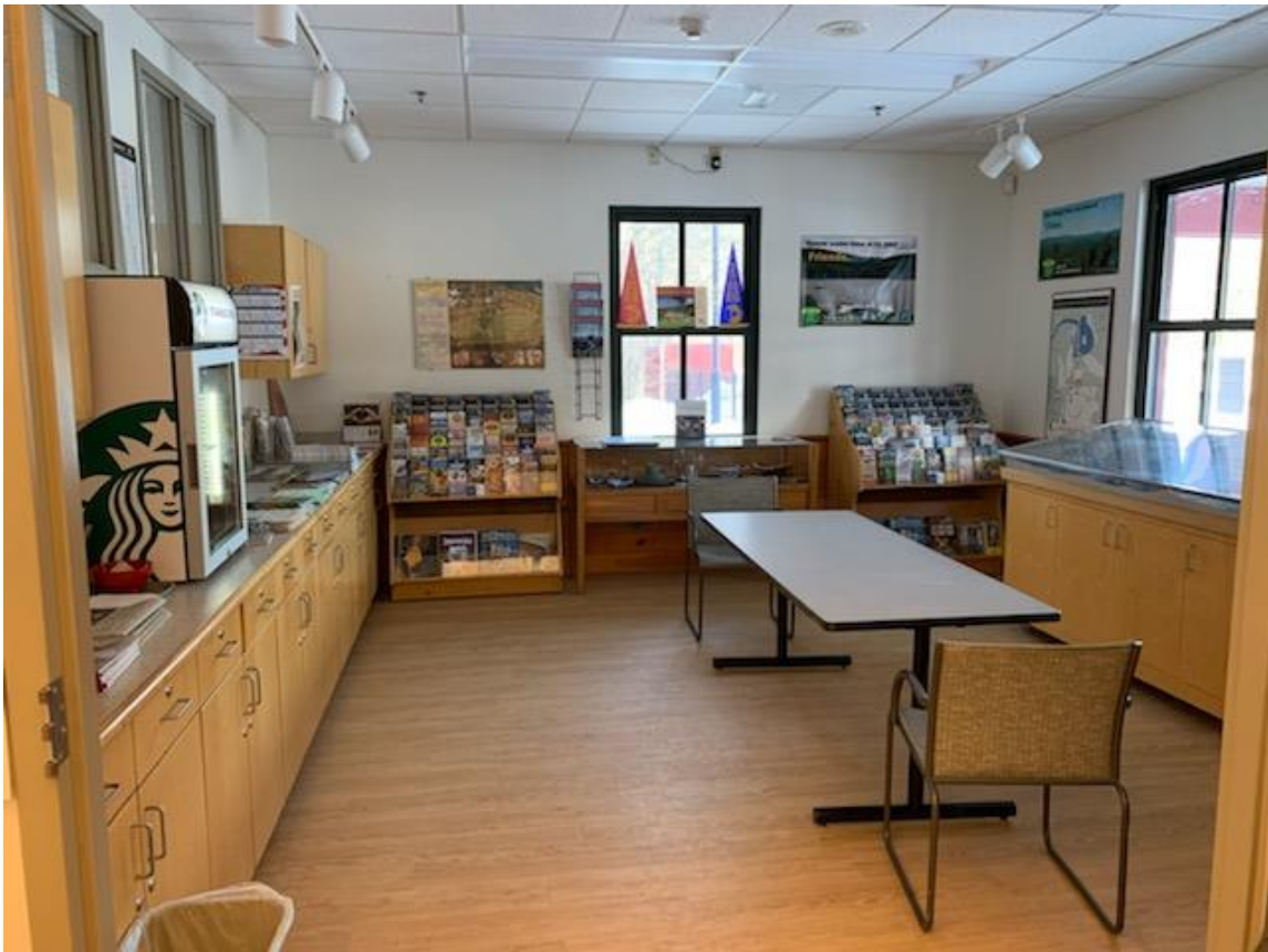
Informational Photo Number 3: Brochure Room