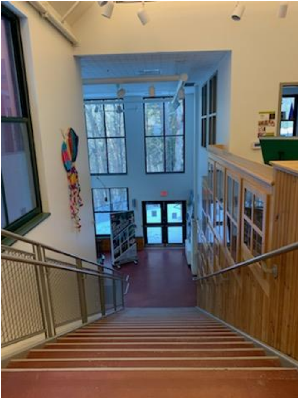
Informational Photo 4: Stairs and Lower Foye