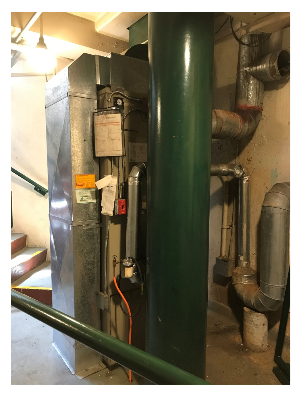
Informational Photo 1: Furnace location showing duct work