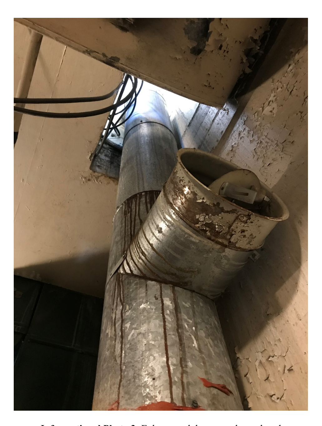
Informational Photo 3: Exhaust and damper to be replaced