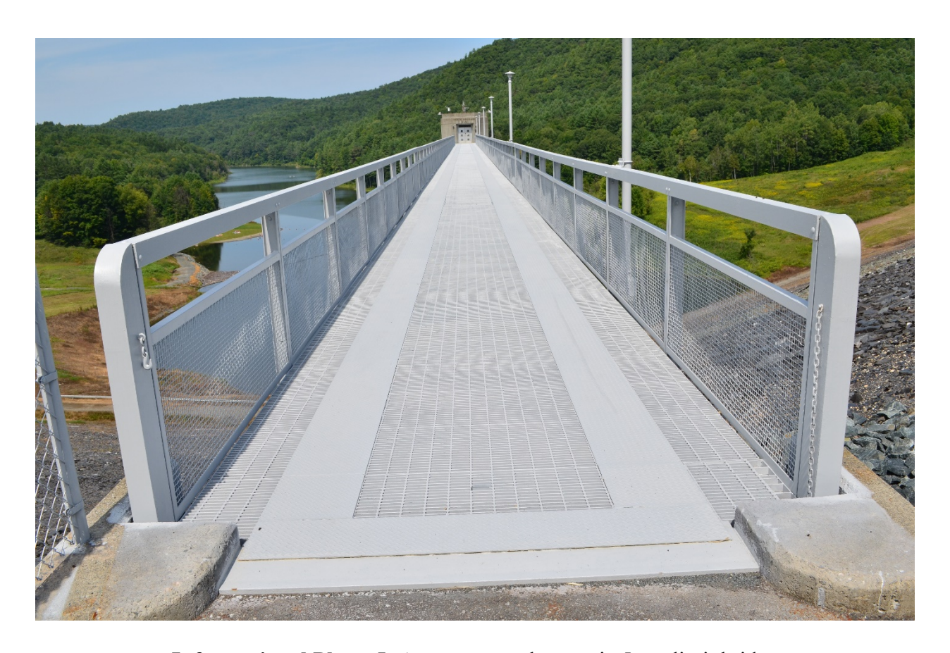
Informational Photo 5: Access to gatehouse via 5 ton limit bridge