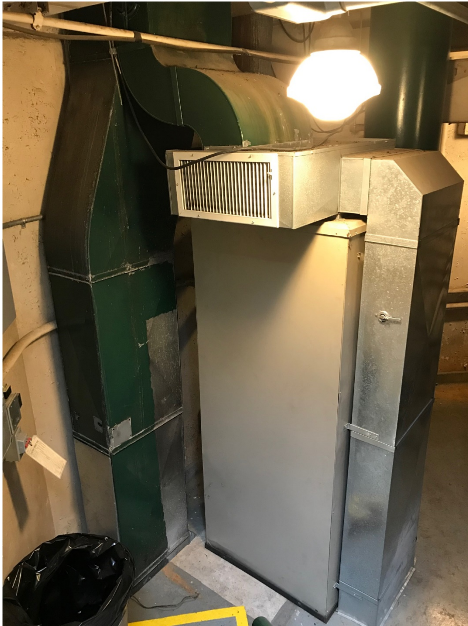
Informational Photo 2: Furnace location showing duct work