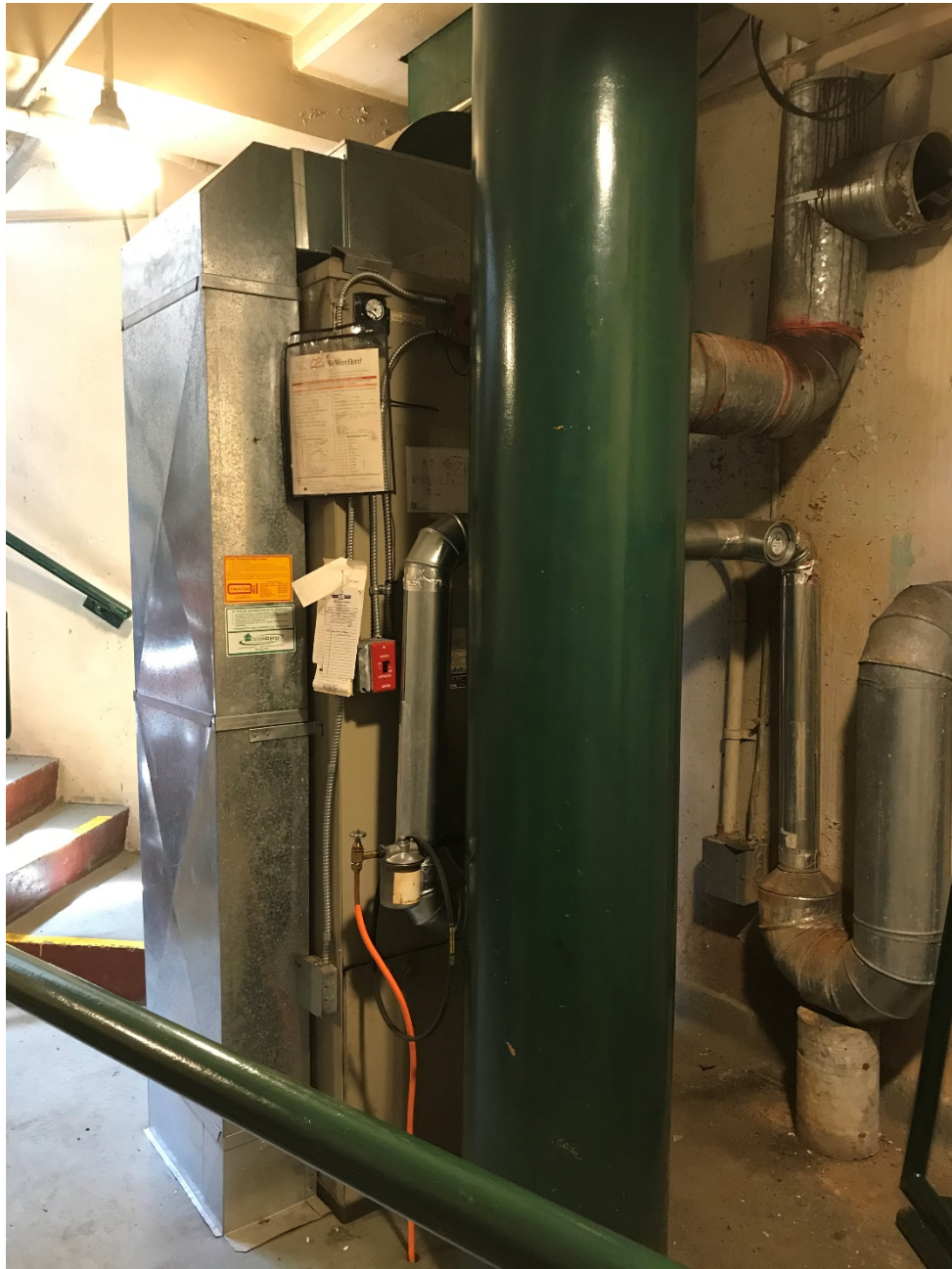
Informational Photo 1: Furnace location showing duct work