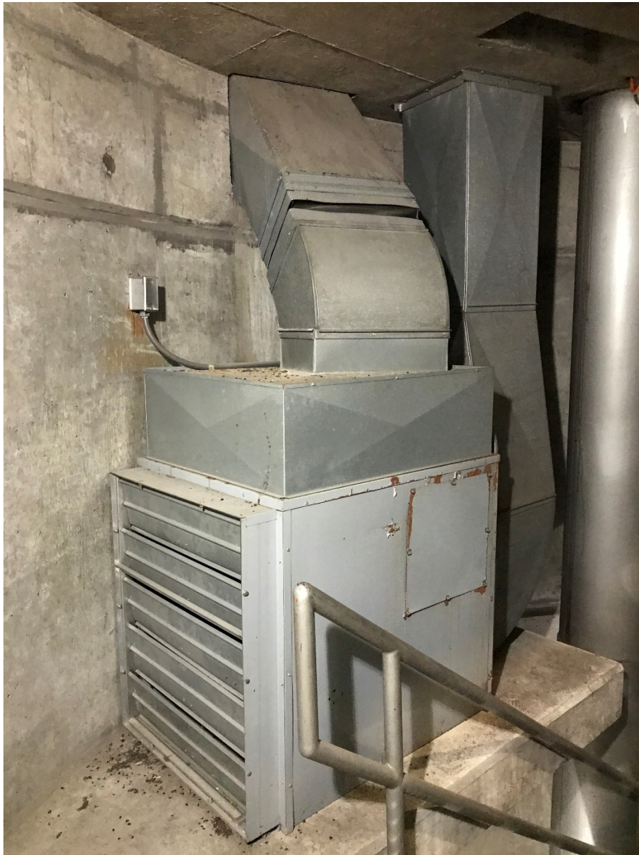
Informational Photo 4: Air exchange unit on third floor. Not replacing.