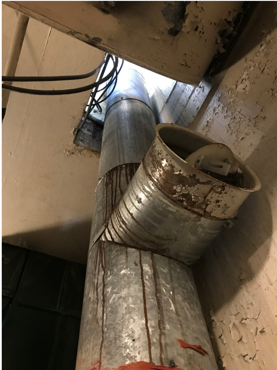
Informational Photo 3: Exhaust and damper to be replaced