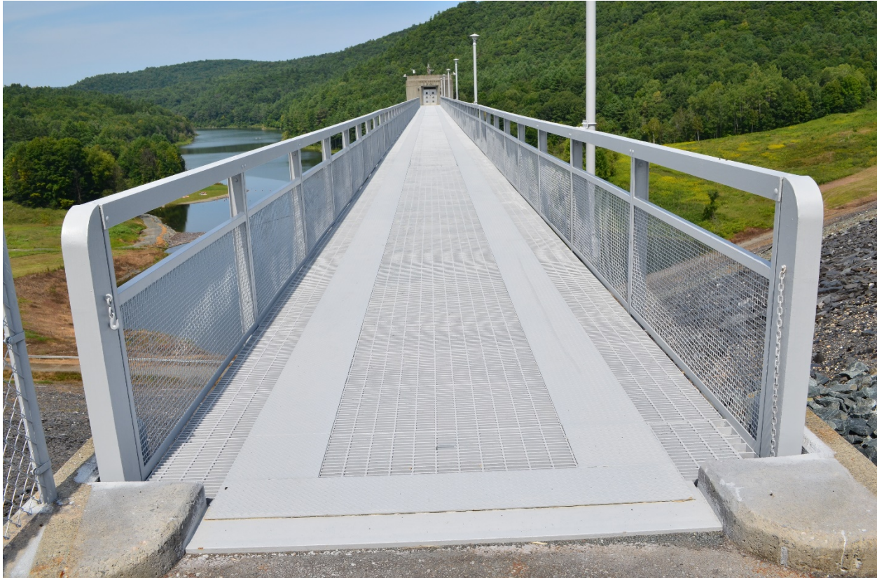
Informational Photo 5: Access to gatehouse via 5 ton limit bridge