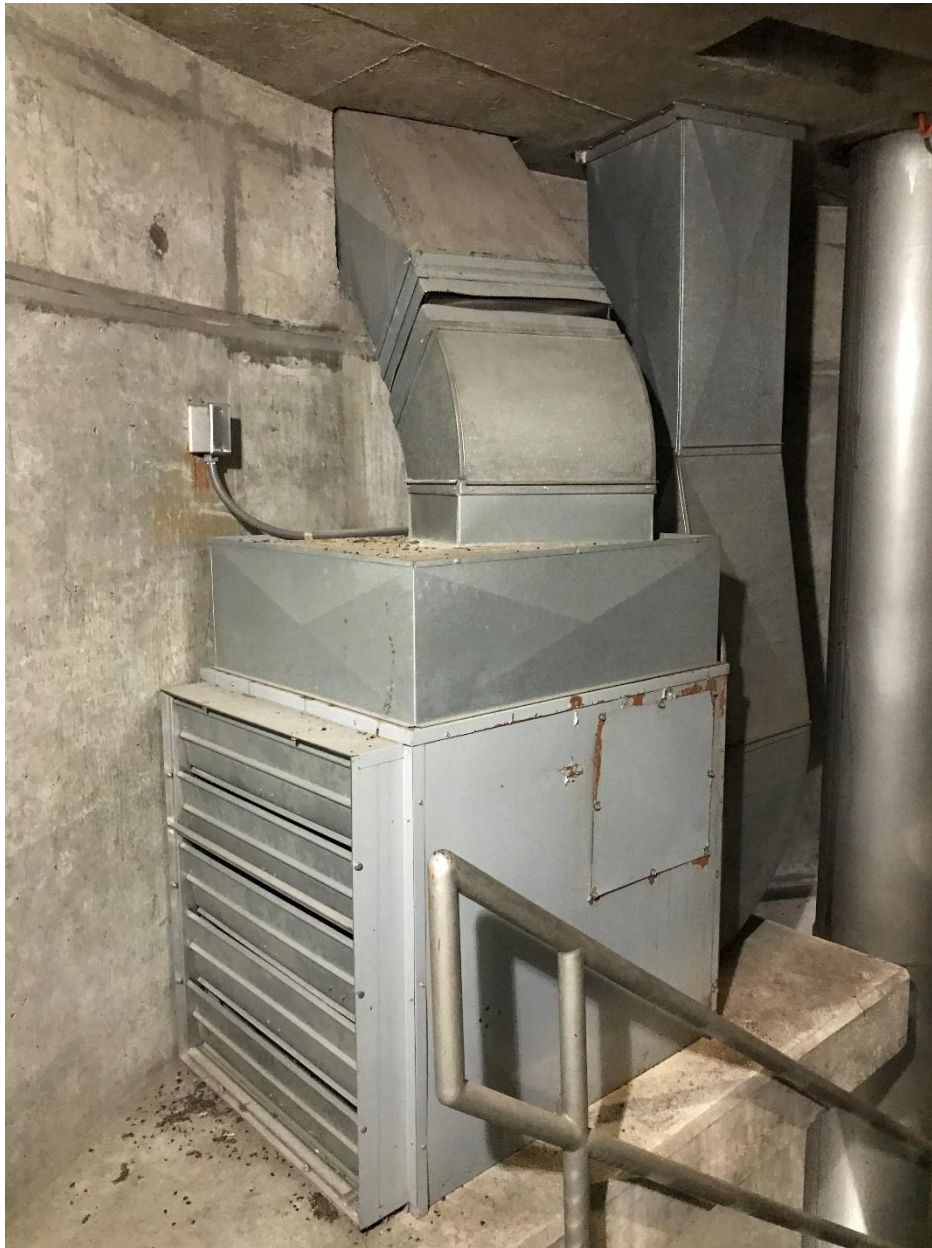
Informational Photo 4: Air exchange unit on third floor. Not replacing.