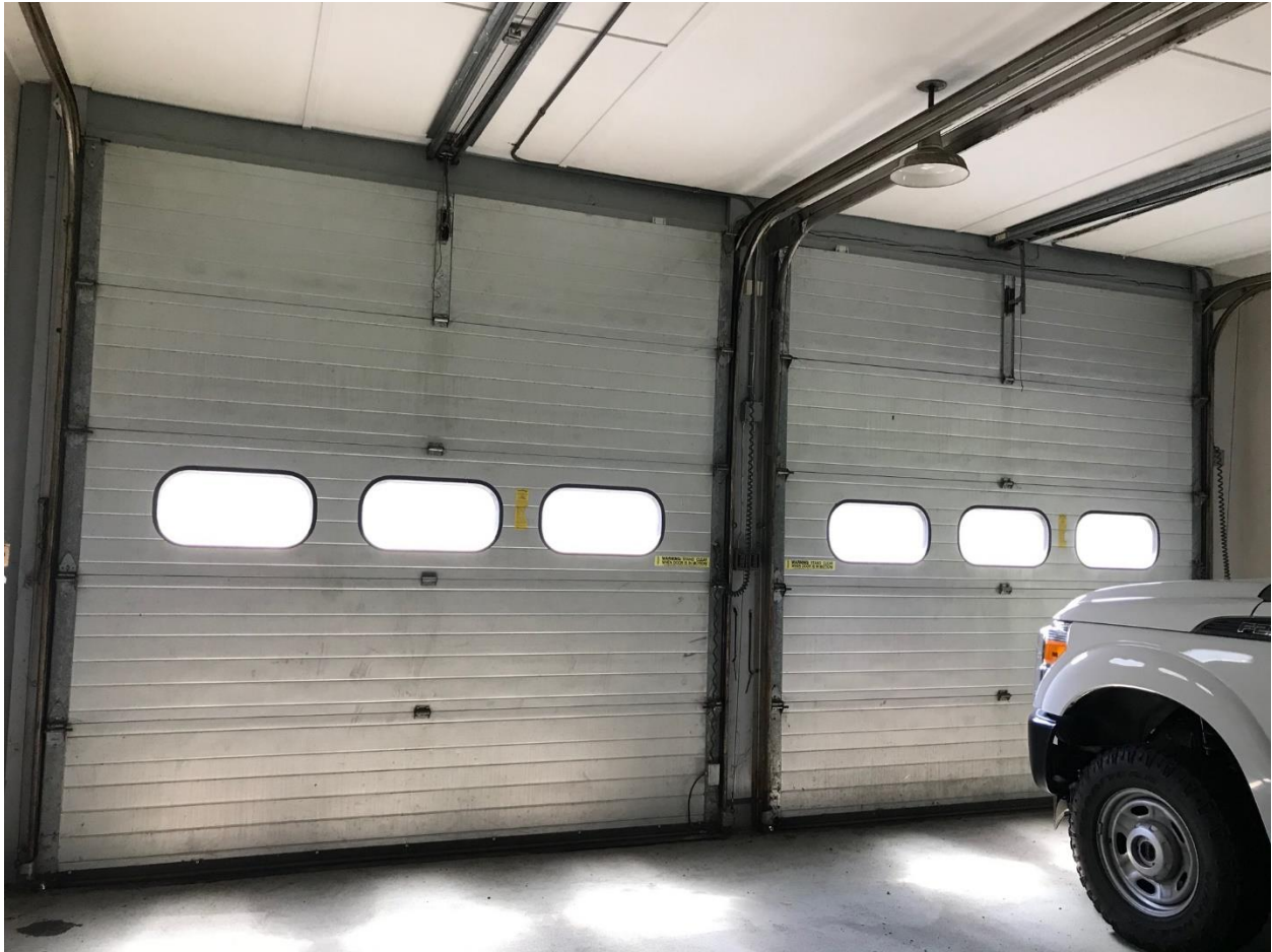
Informational Photo 5: Inside of attached 3 bay garage