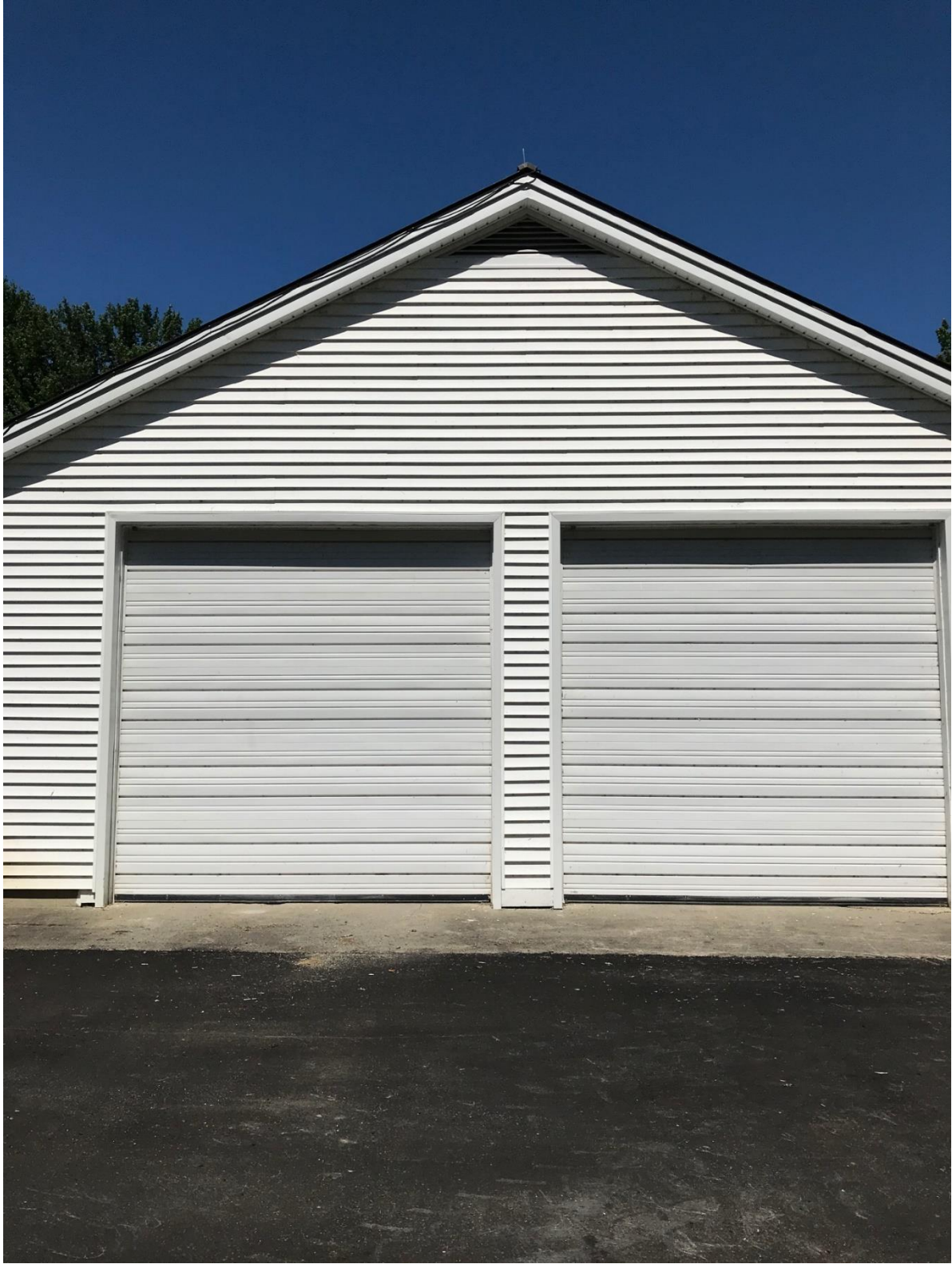
Informational Photo Number 2: Standalone 2 bay garage