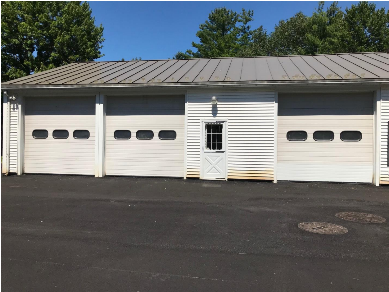
Informational Photo Number 1: Office and attached 3 bay garage