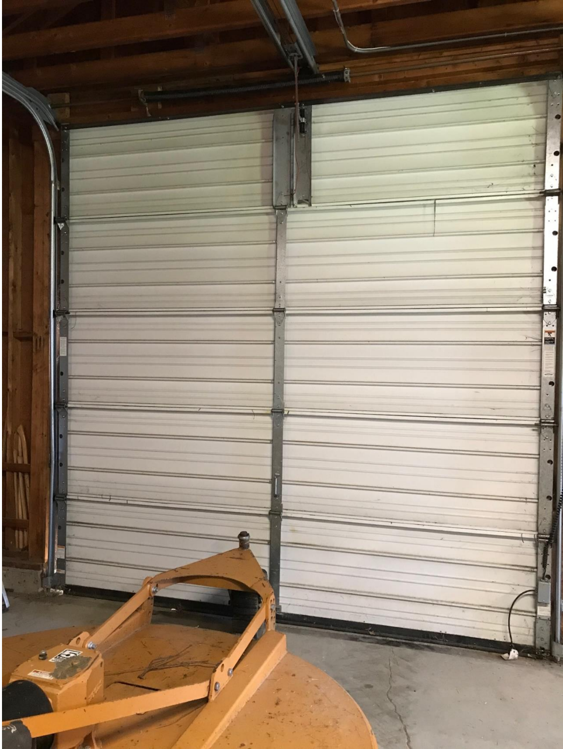
Informational Photo Number 3: Inside of standalone 2 bay garage