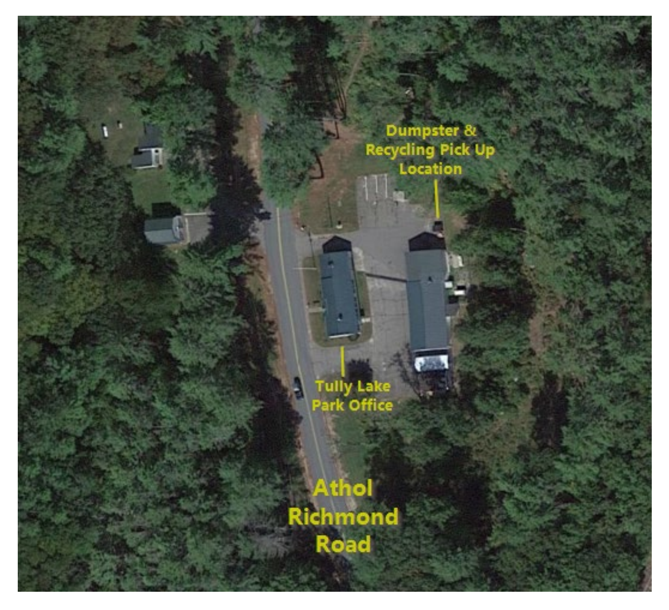
Figure Number 1 – Tully Lake Project Office Dumpster & Recycling Location