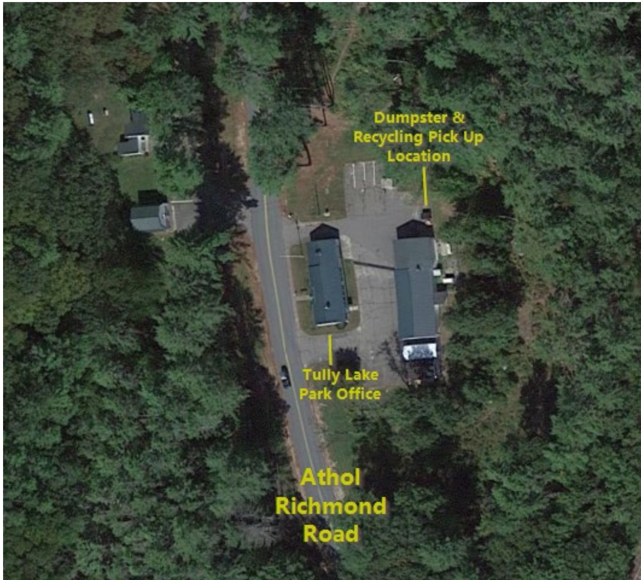
Figure Number 1 – Tully Lake Project Office Dumpster & Recycling Location