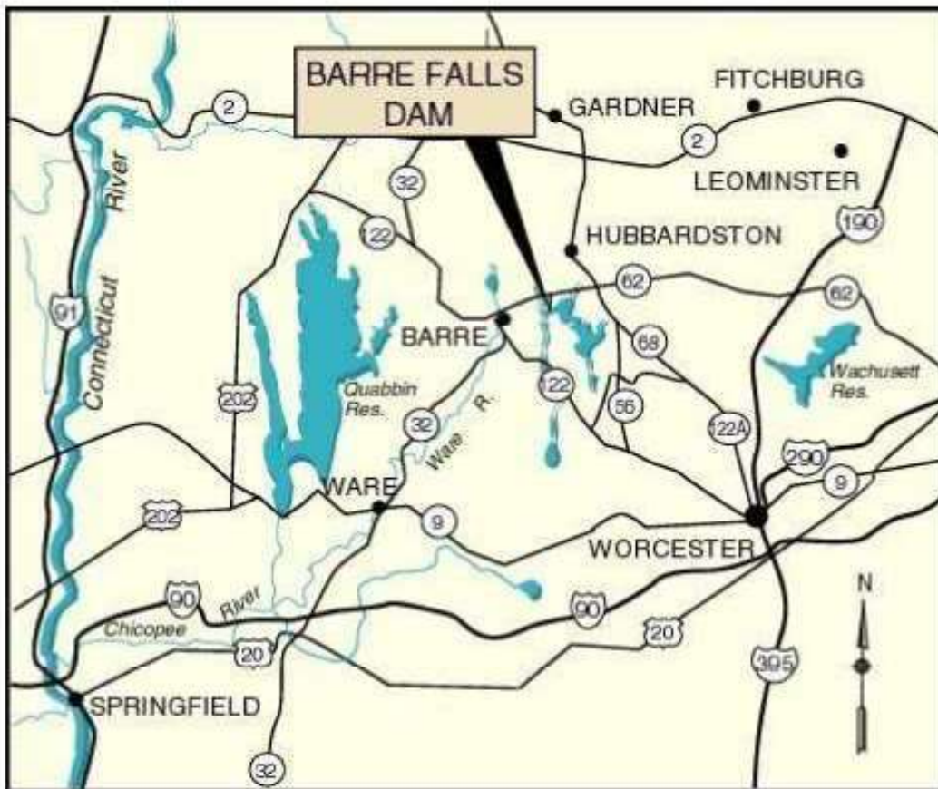
Exhibit A-1: Location Map