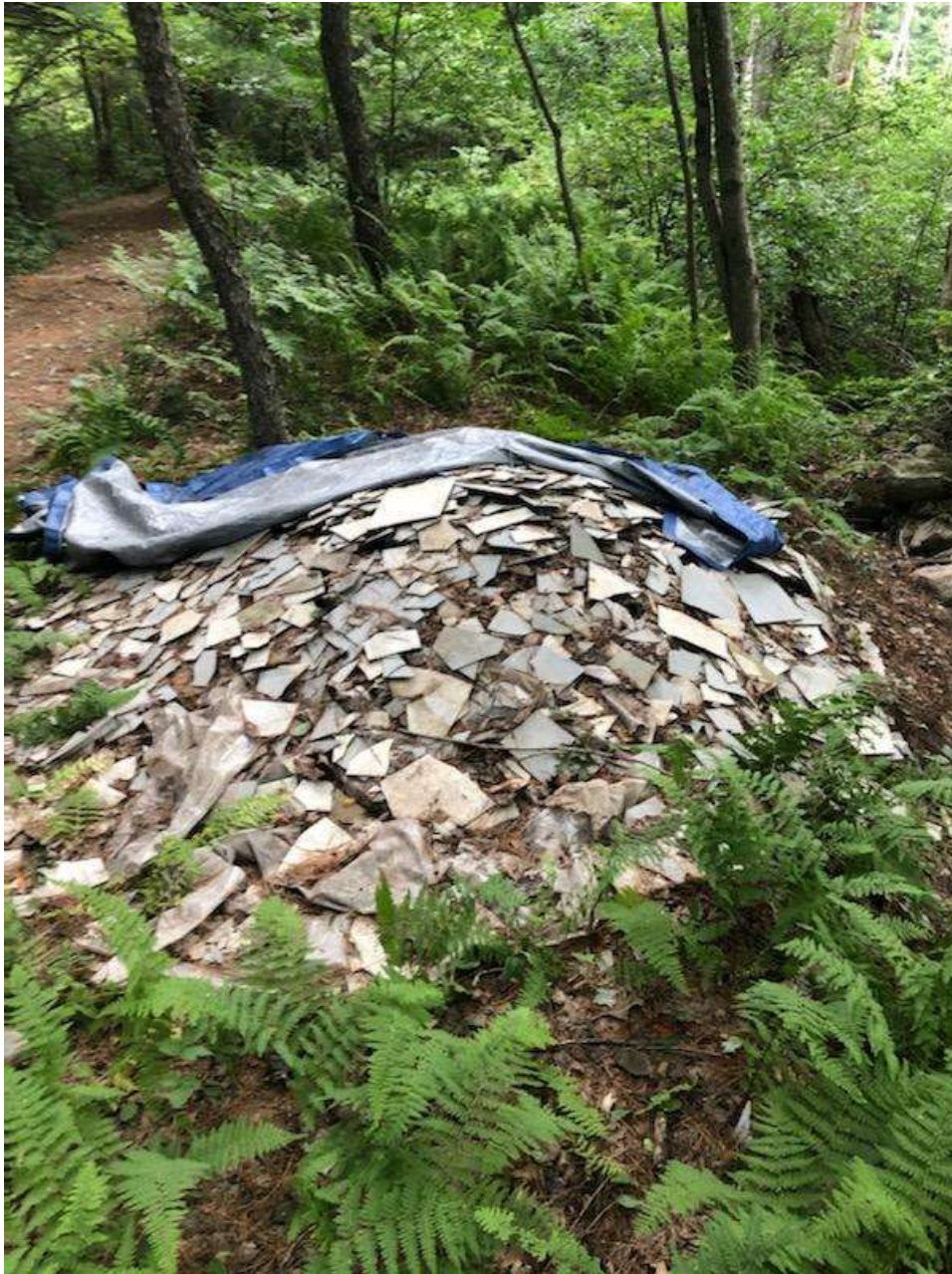
Informational Photo 1 – Photograph of ACM exterior shingle pile adjacent to Chaffee Pond Trail