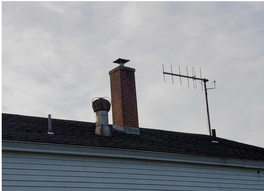
Photo 6: UB roof penetrations – chimney, plumbing vents, turbine vent