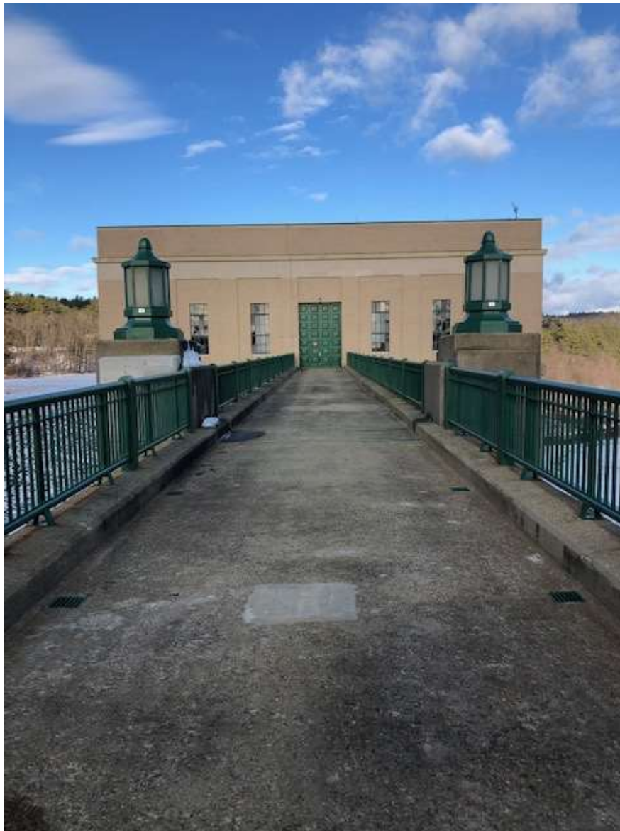
Exhibit A: Franklin Falls Dam Gatehouse Service Bridge.