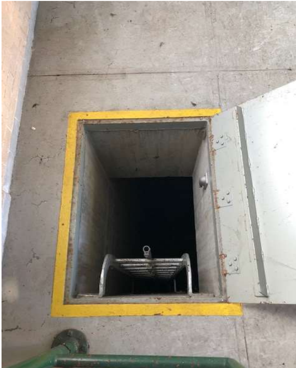
Exhibit B: Operating Floor Access Hatch to Gate Well and Inspection Gallery where lower sheaves and gate is located.