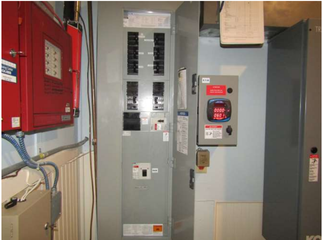
Exhibit H: Interior view of the Main Electrical Panel located in the Furnace Room.