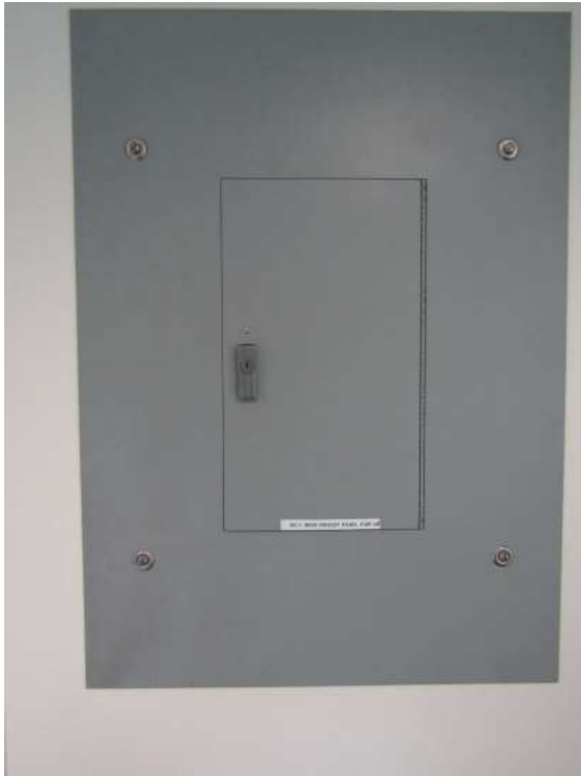
K. View of No.1 Main Panel located in the Park Ranger Office.