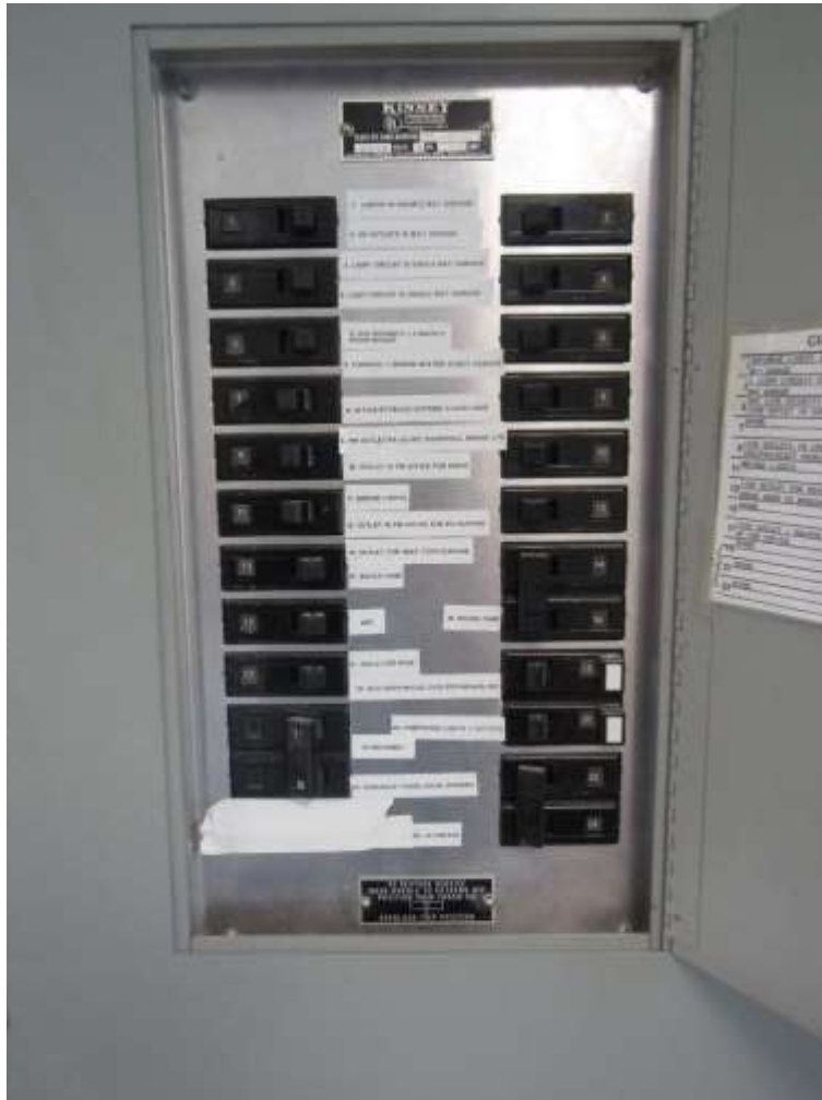
M. View of the interior of the No. 1 Main Panel located in the Park Ranger Office.