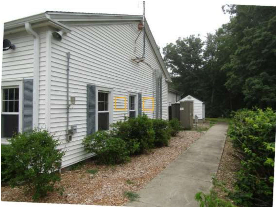
Exhibit C: Exterior view of the west wall. Orange Squares represent potential mounting locations for the exterior condensing unit.