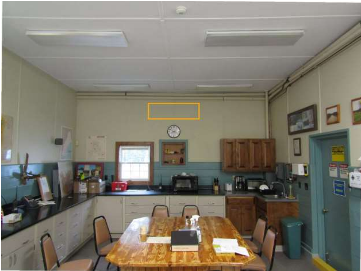
Exhibit E: Interior view of the lunch room. Orange rectangle represents potential mounting location for the interior head.