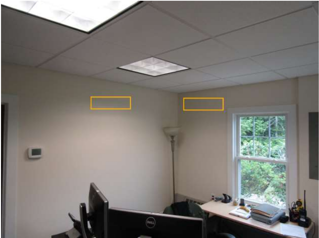
Exhibit D: Interior of the Ranger's office space. Orange rectangles represent potential mounting locations for the interior heads.