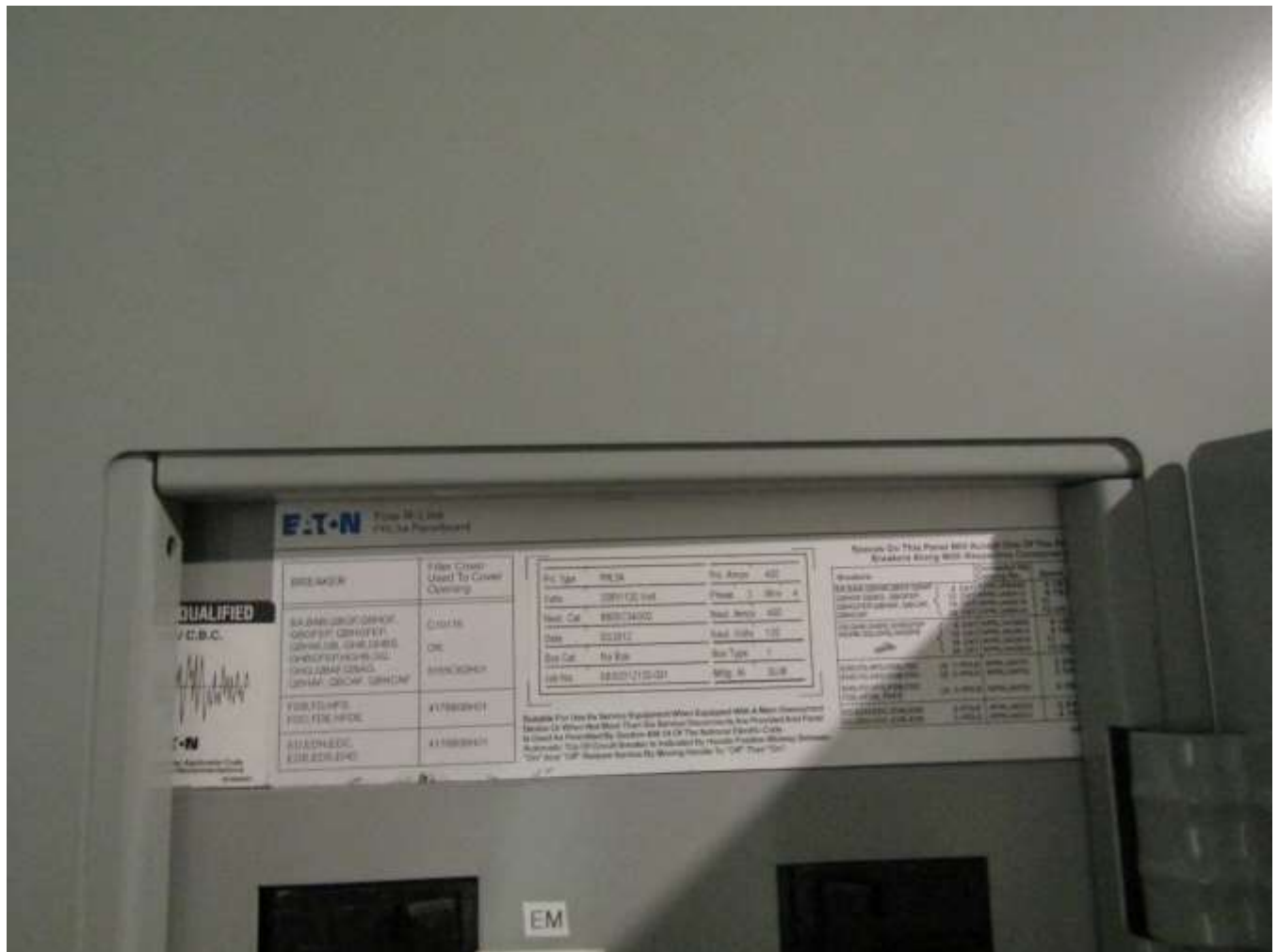
Exhibit G: View of the electrical details relative to the Main Panel located in the Furnace Room.