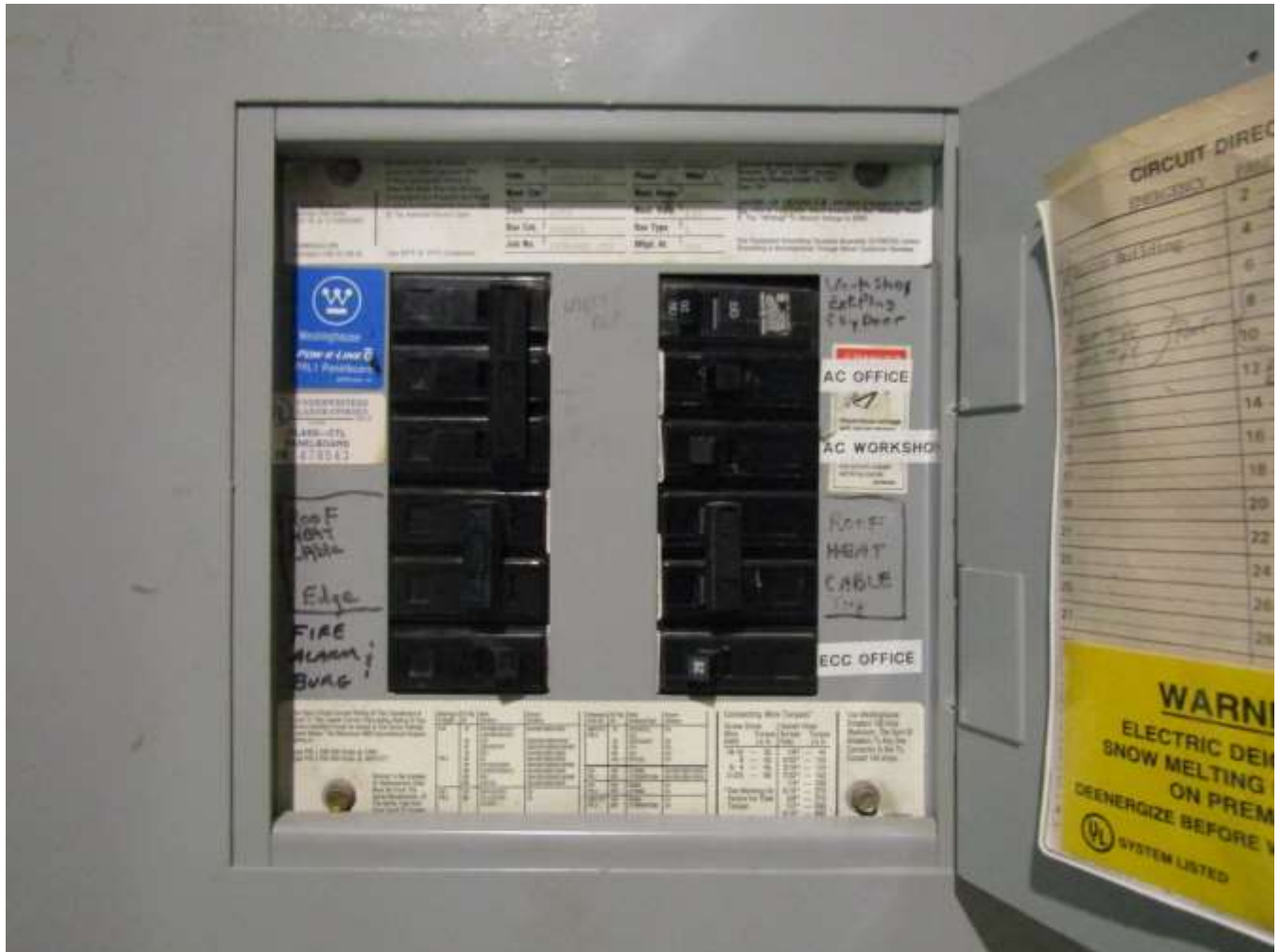
Exhibit J: Interior view of Sub Panel No.1 located in the Furnace Room.