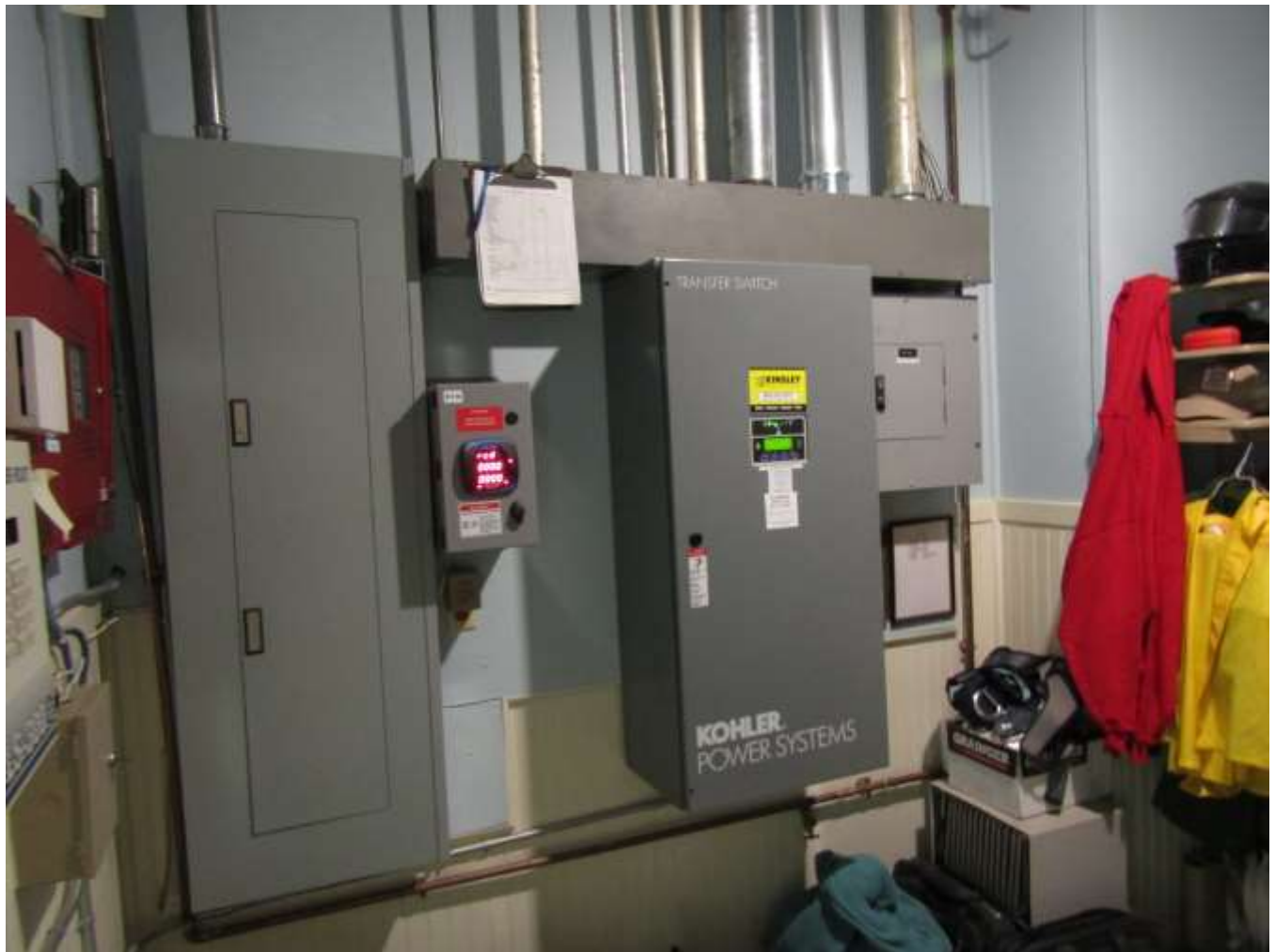
Exhibit F: View of the Main Electrical Panel and Subpanel No. 4. Both are located in the Furnace Room.