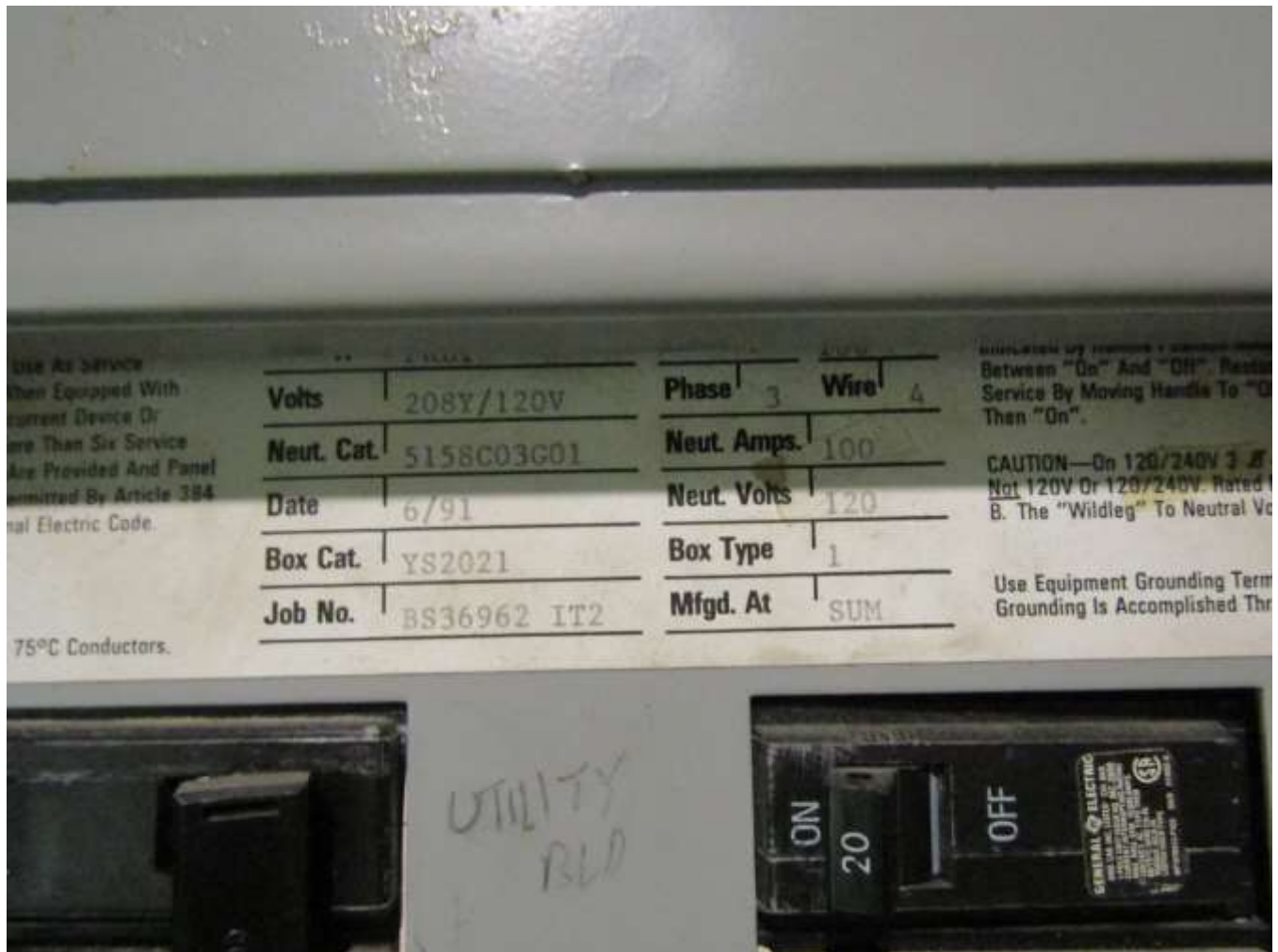
Exhibit I: View of the electrical detail for Sub Panel No.1 located in the Furnace Room.