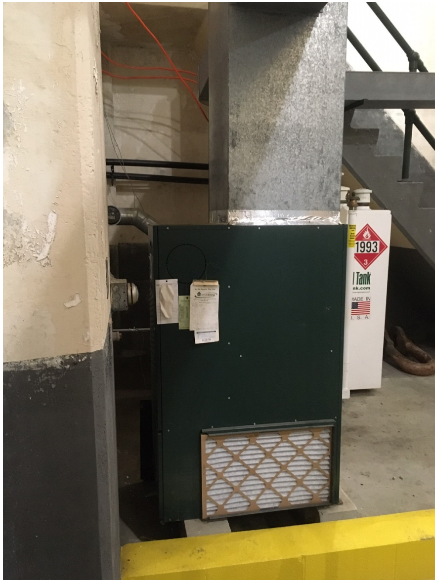
Informational Photo 4: “Lower Furnace”