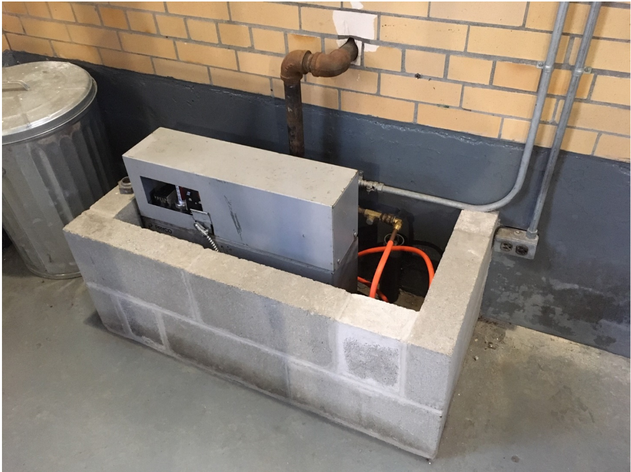
Informational Photo 5: Existing Pryco PY5 Generator Day Tank