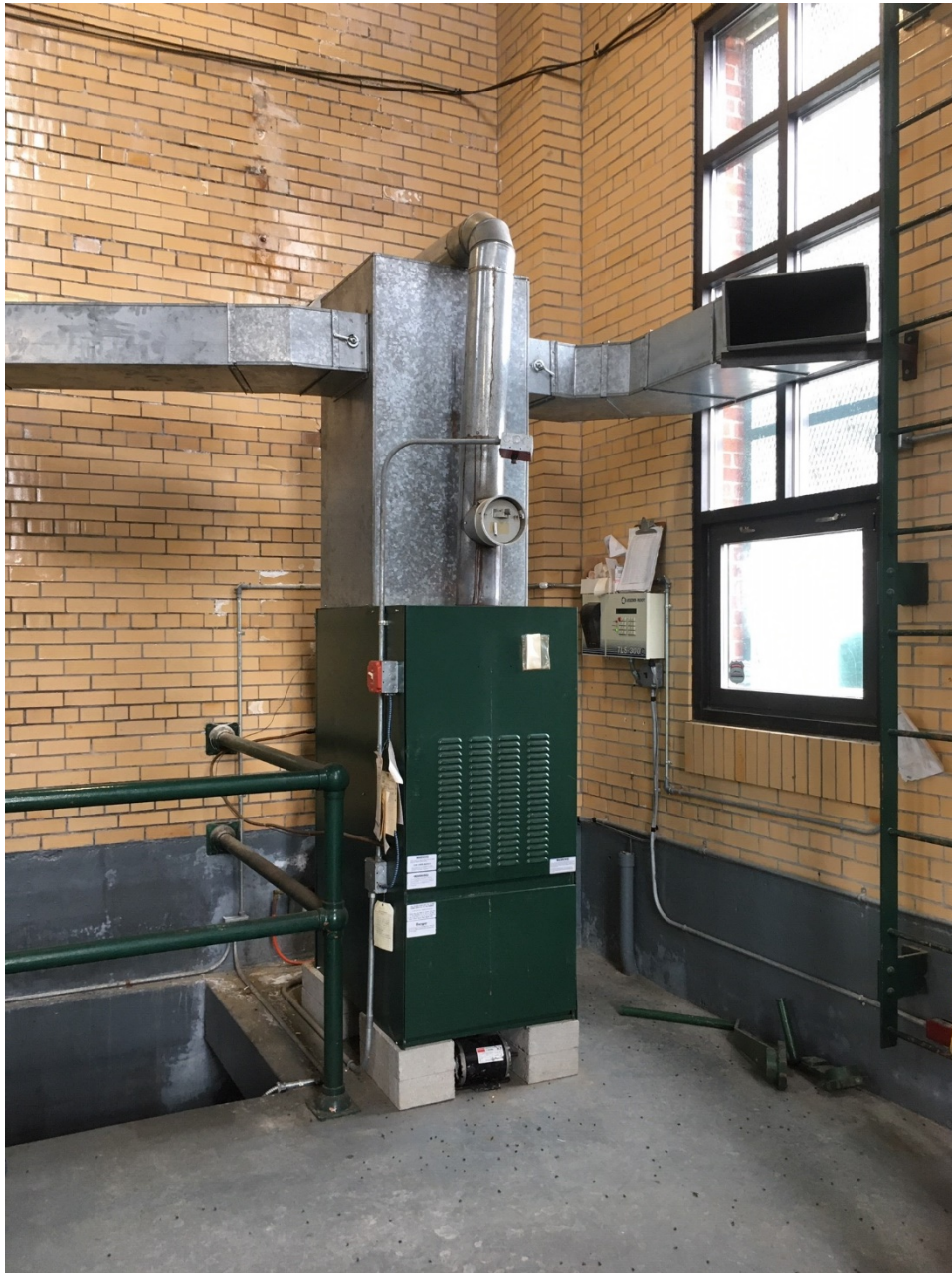
Informational Photo 1: "Upper Furnace"