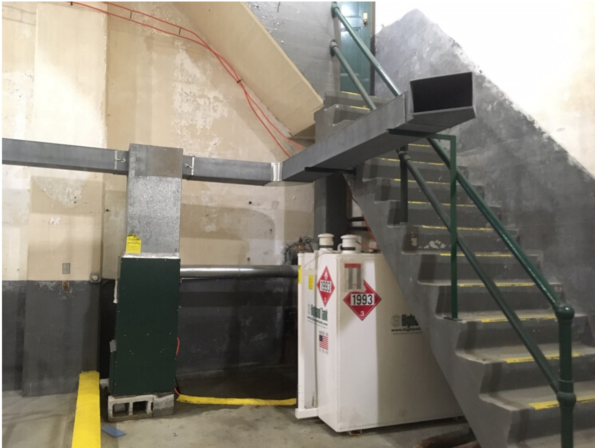
Informational Photo 3: “Lower Furnace”