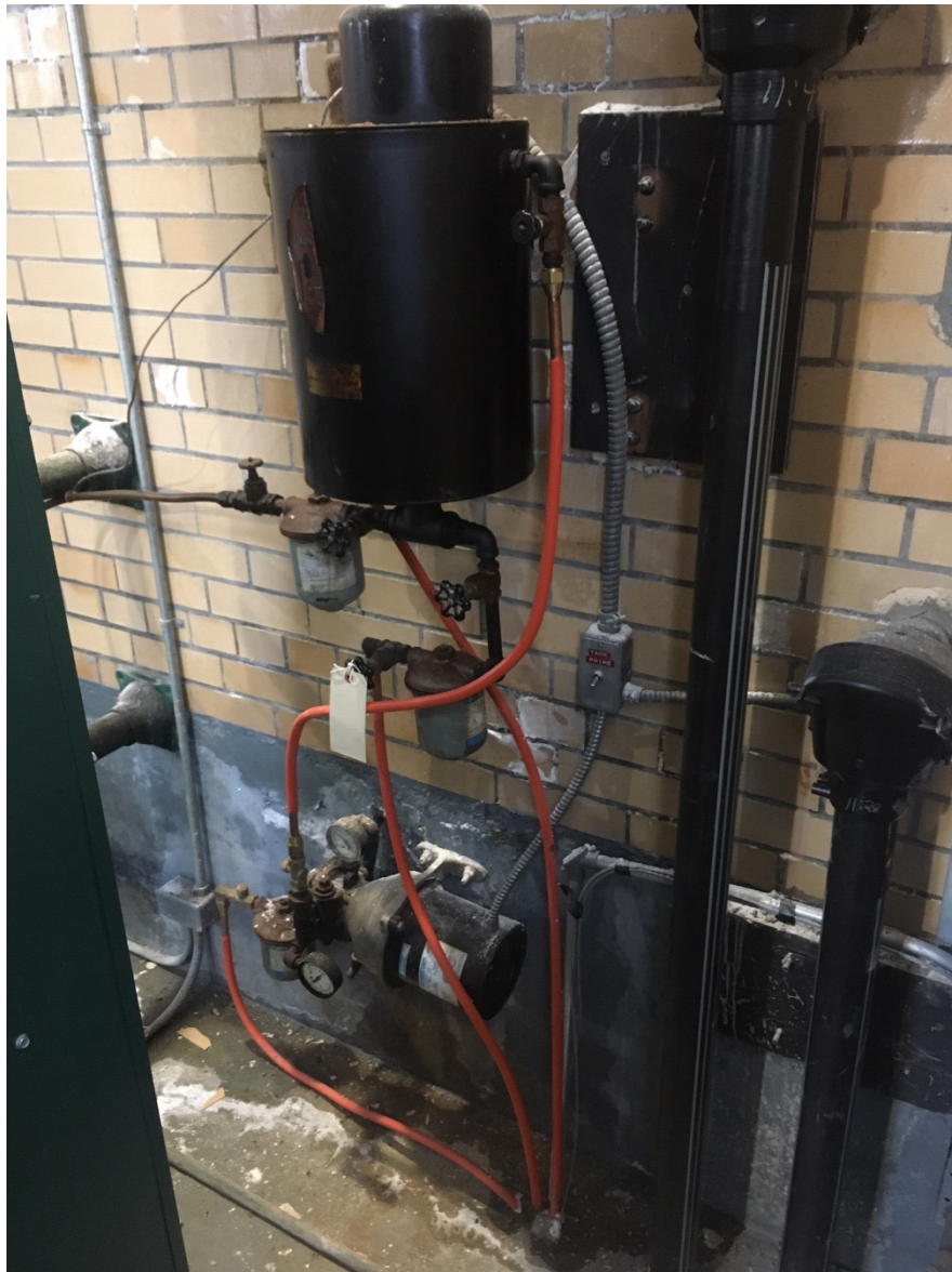
Informational Photo 2: Upper furnace day tank and lifter pump