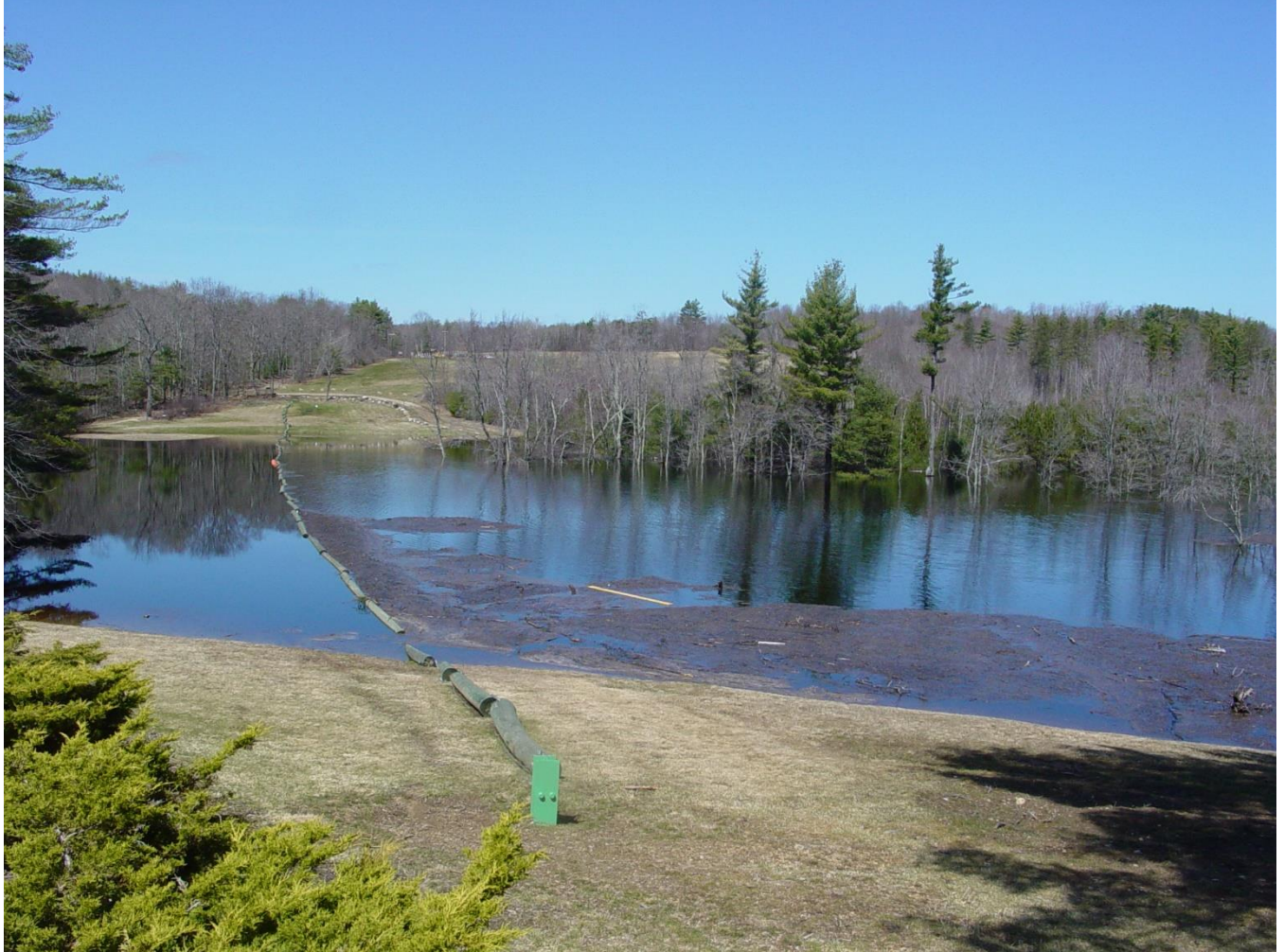
Exhibit 5: View of the Work Area and Debris Looking West Across the River Channel