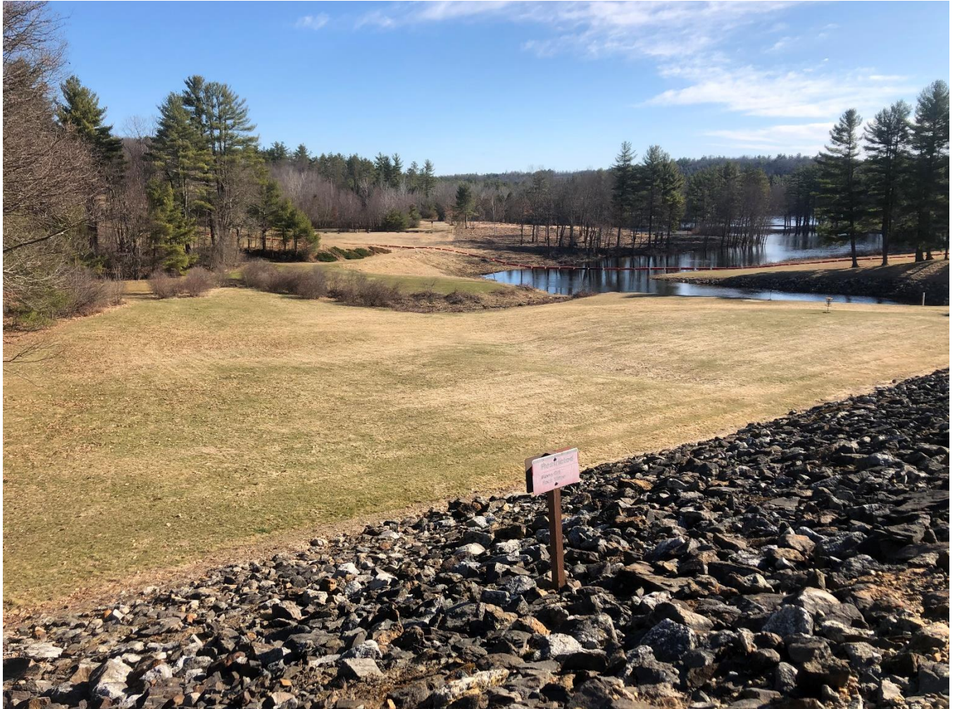
Exhibit 6: View of the Work Area, West Side of the Gatehouse.