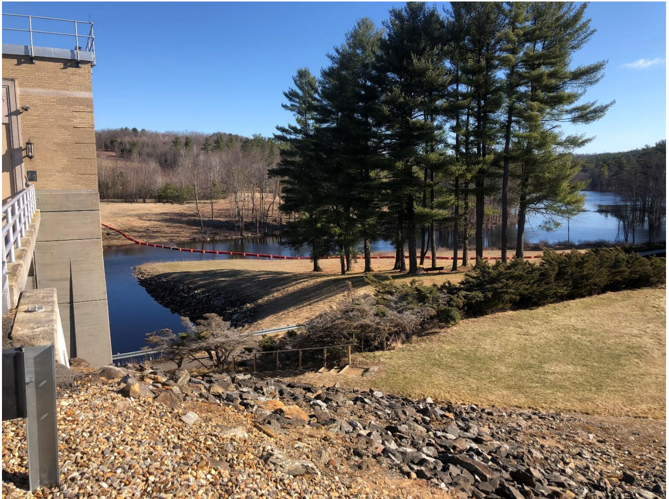
Exhibit 6: View of the Work Area, East Side of the Gatehouse.