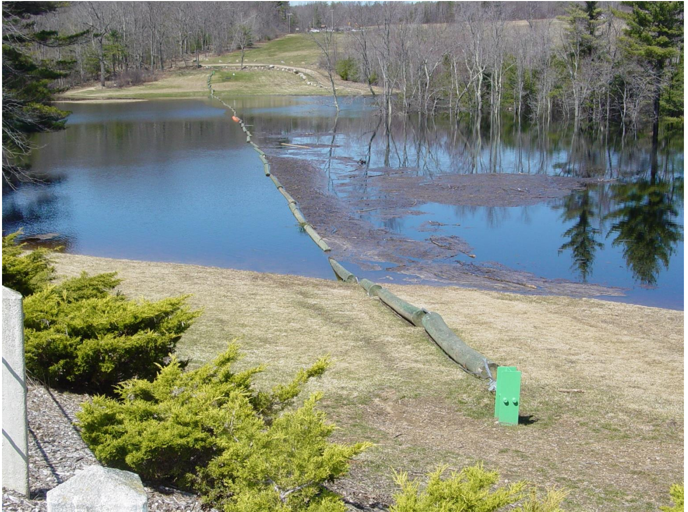
Exhibit 2: View of the Work Area and Debris Looking Northwest Across the River Channel.