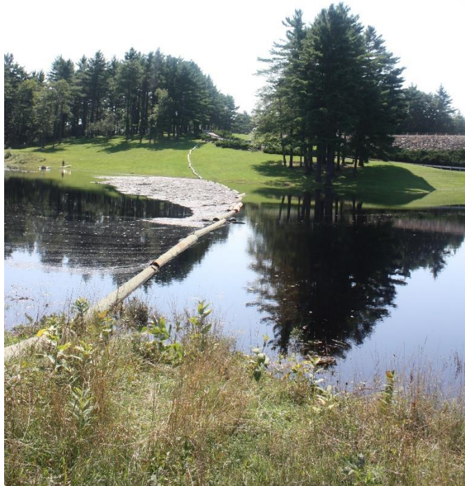
Exhibit 4: View of the Work Area and Debris Looking East Across the River Channel.

FLOOD DEBRIS CLEARING AND REMOVAL U.S. ARMY CORPS OF ENGINEERS BARRE FALLS DAM