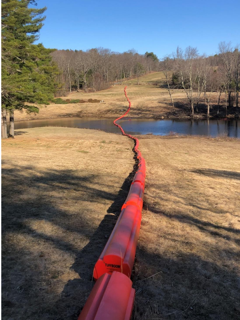
Exhibit 6: View of the Work Area Looking West Side Across the Log Boom and River Channel.