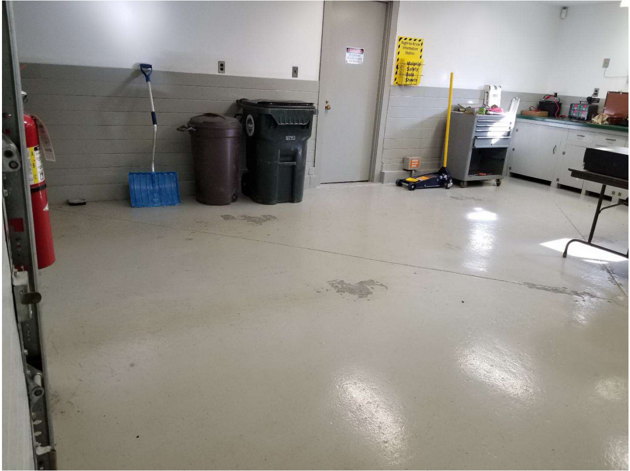
Exhibit G: Everett Dam Project Office “warm bay” garage bay 1.