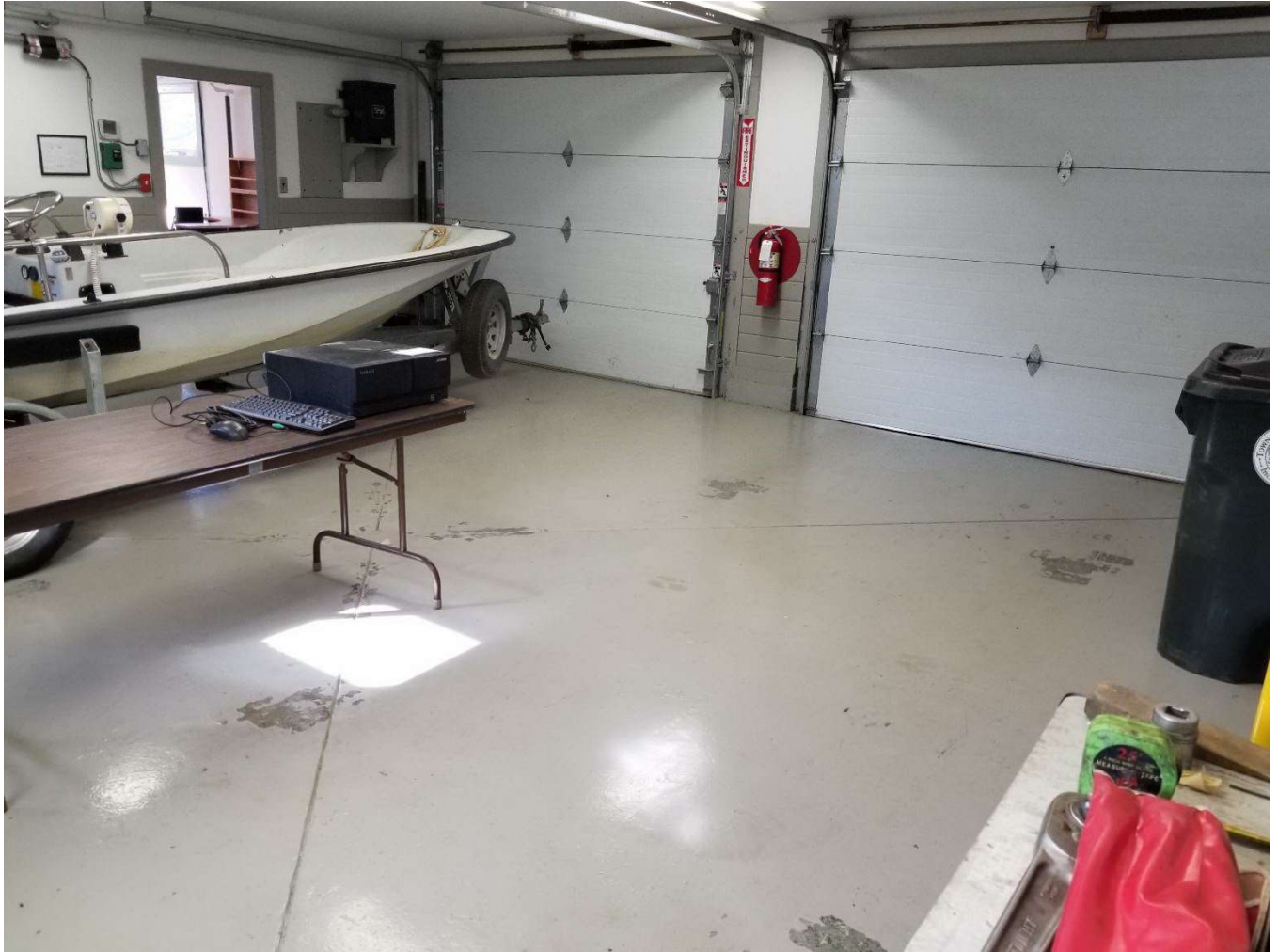
Exhibit F: Everett Dam Project Office “warm bay” garages.