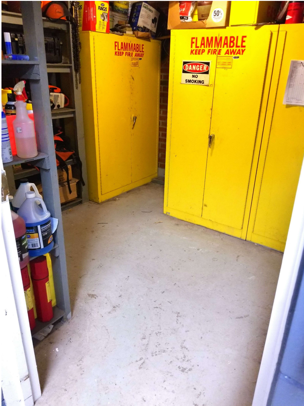
Exhibit C: Hopkinton Project Office Flammable Locker room.