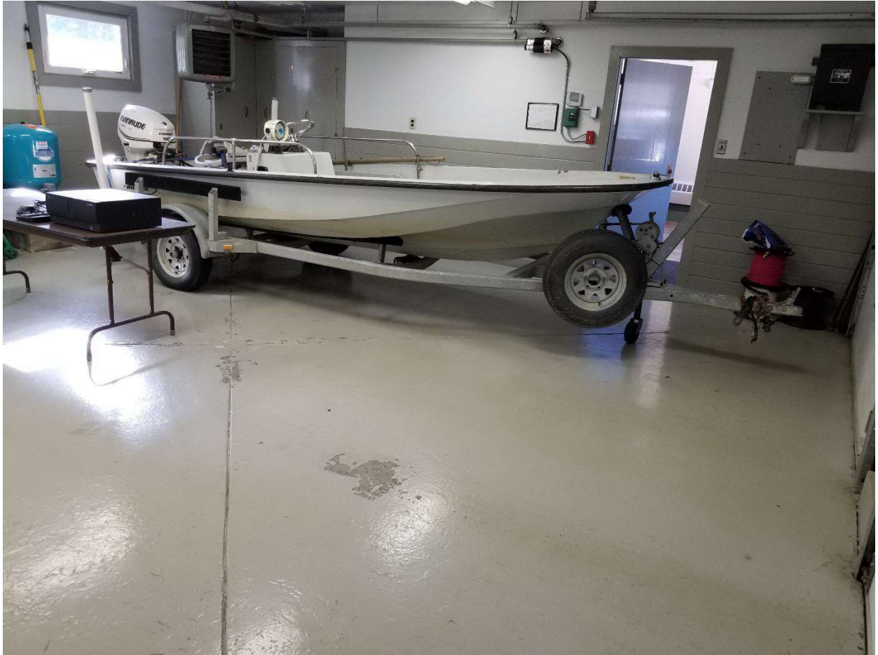
Exhibit H: Everett Dam Project Office “warm bay” garage bay 2.