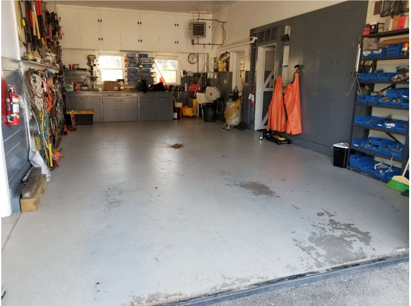
Exhibit B: Hopkinton Dam Project Office “warm bay” garage.