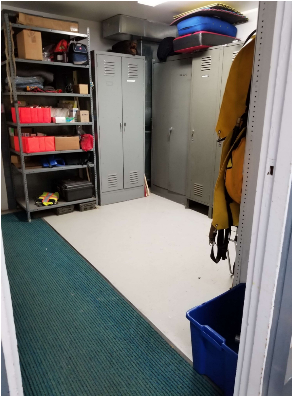
Exhibit D: Hopkinton Project Office storage room.