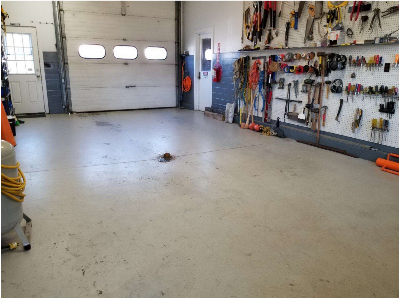
Exhibit A: Hopkinton Dam Project Office “warm bay” garage. The middle seam channels water to the floor drain.