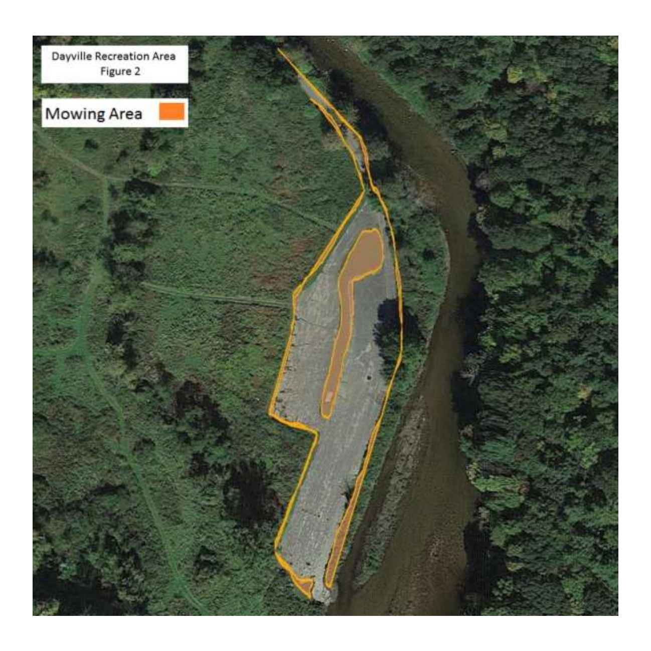
Figure 2: Dayville Canoe Launch mowing area