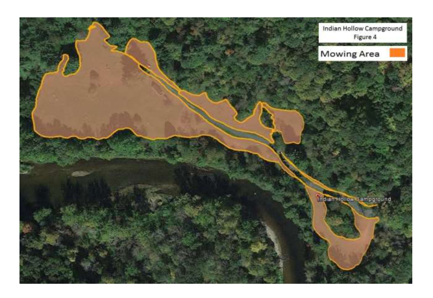
Figure 4: Indian Hollow Campground mowing area