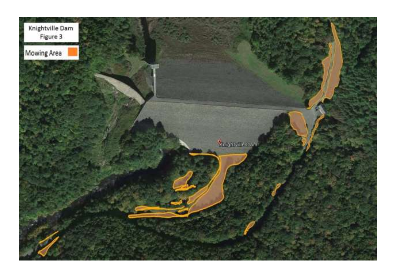
Figure 3: Knightville Dam mowing areas