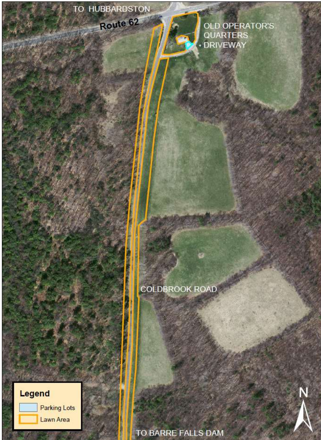
Figures FIGURE 1