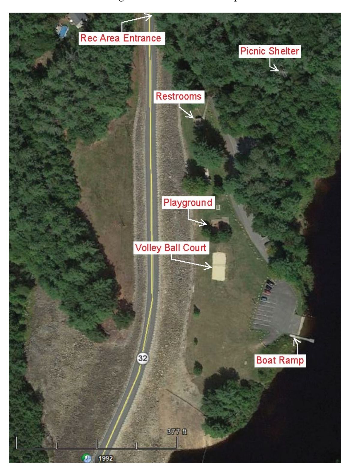
Figure 1: Recreation Area Map