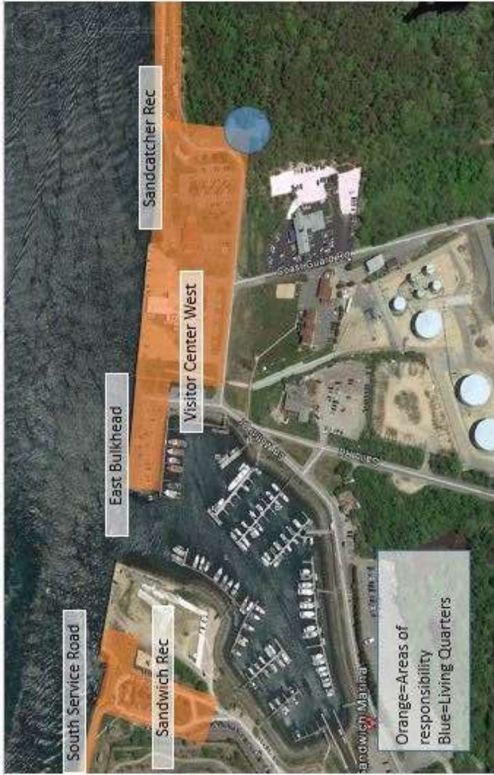
Figure 2. Sandwich Park Attendant Area of Responsibility and Campsites