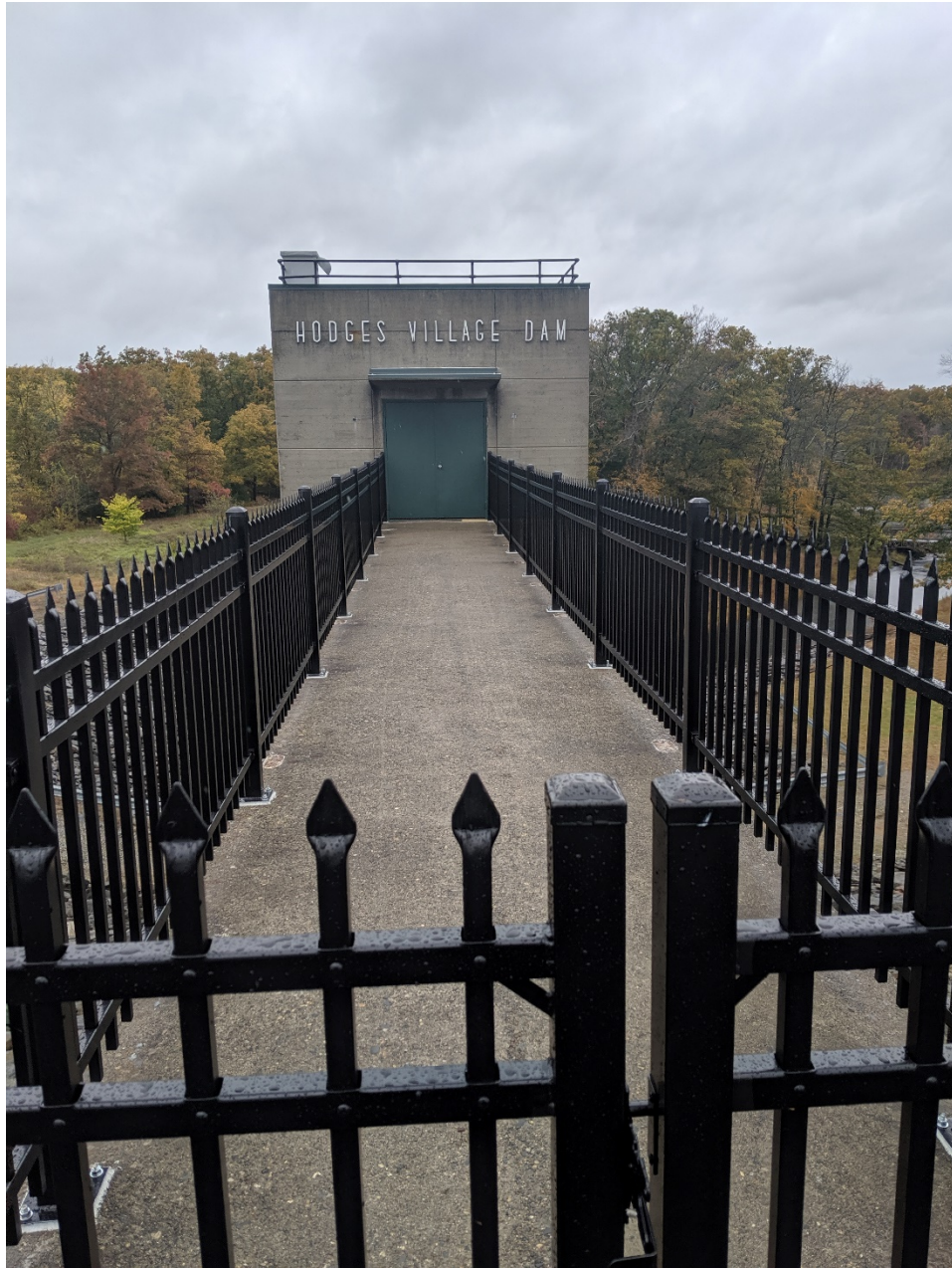
Informational Photos 2 – Hodges Village Dam Gate House from Service Bridge