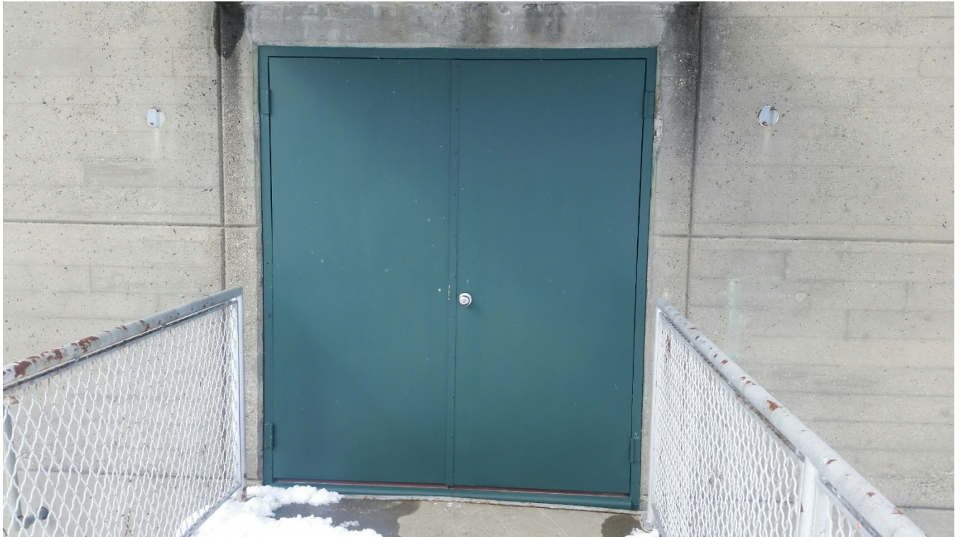
Informational Photo 3 – Gate house main door outside view