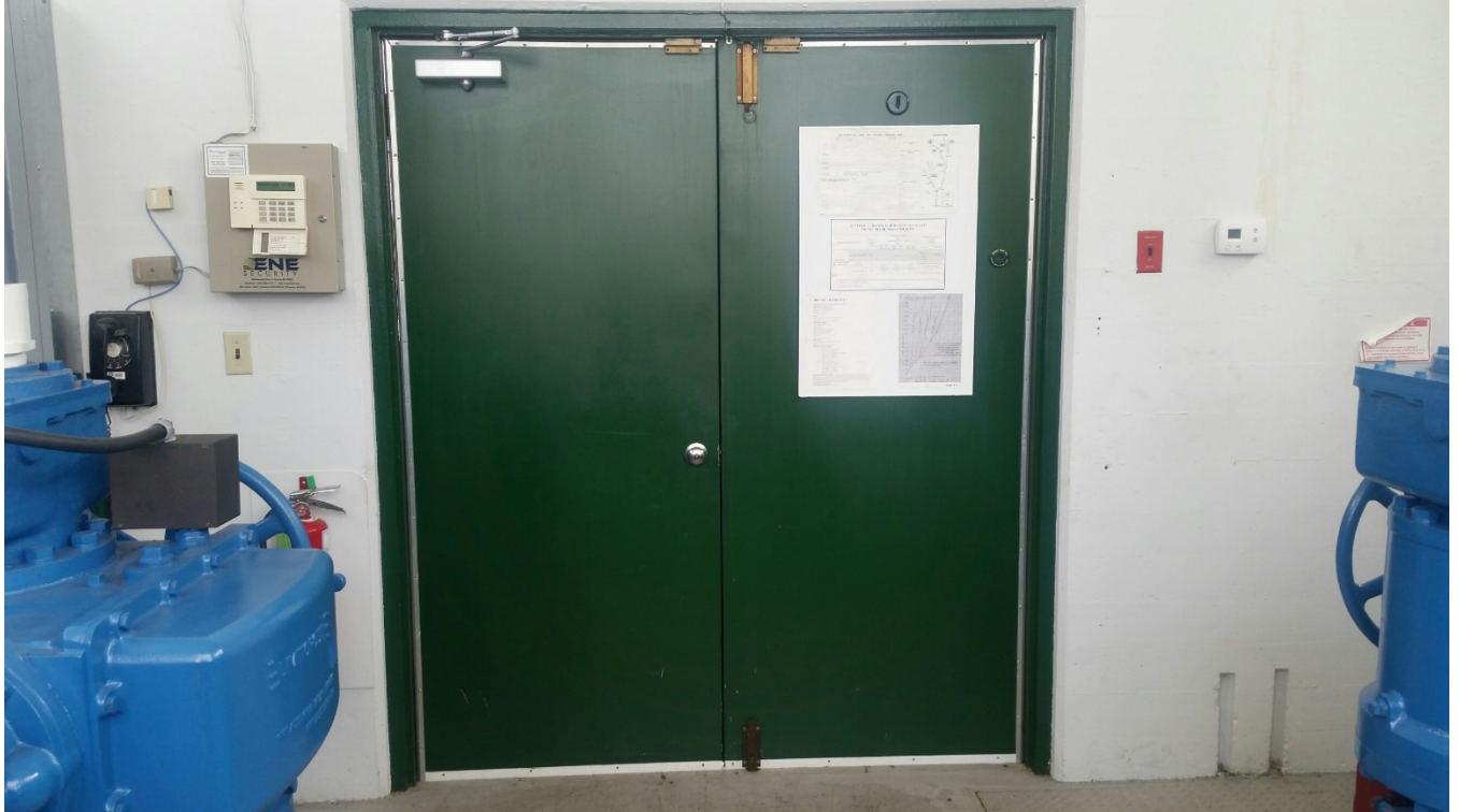
Informational Photo 4 – Gate house main door inside view