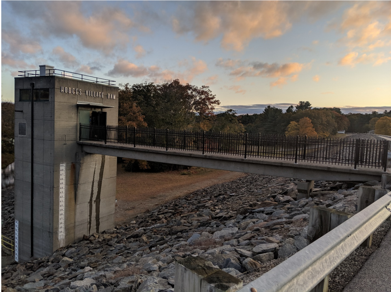
Informational Photos 1 – Hodges Village Dam Gate House