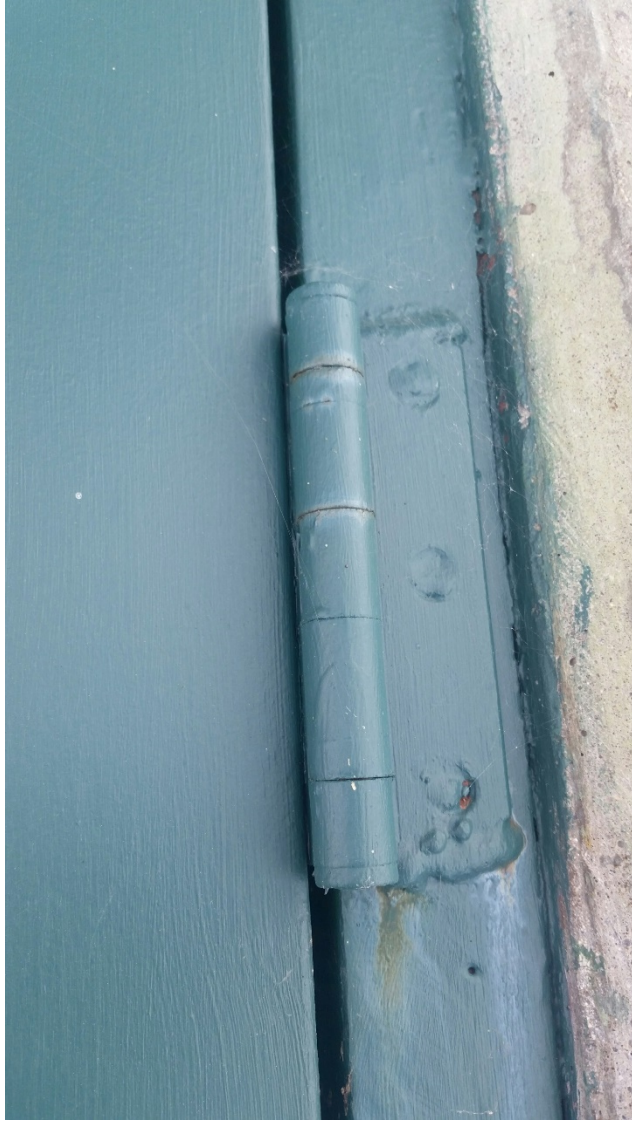
Informational Photos 5 & 6 – Gate house main door hinges outside welded, and inside Philips screw attachment.