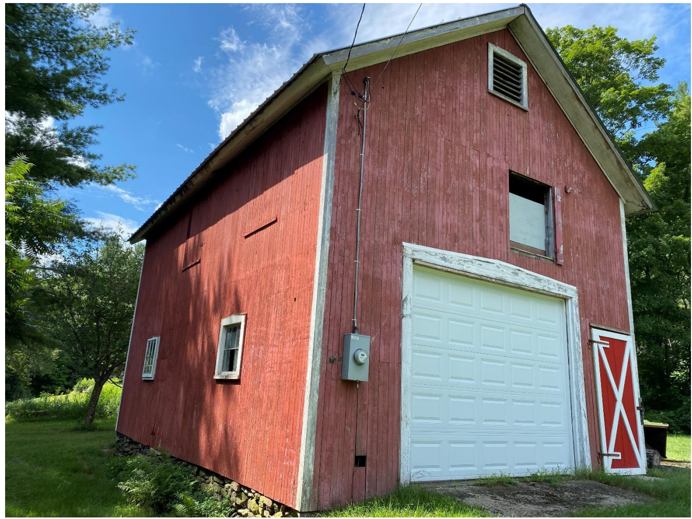
Figure 9: Front northeast facing corner of building

Repair and Repainting of Littleville Storage Barn U.S. ARMY CORPS OF ENGINEERS Littleville Dam