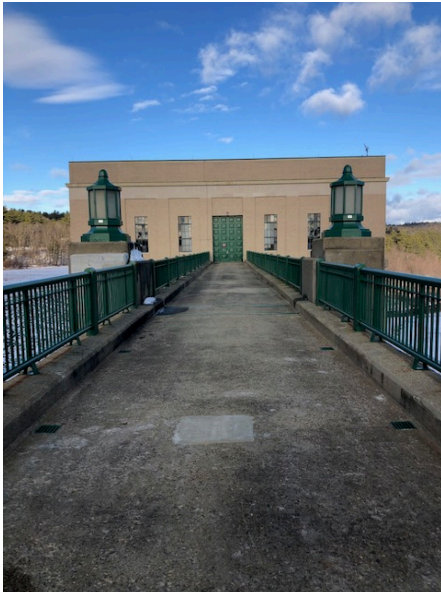
Exhibit A: Franklin Falls Dam Gatehouse Service Bridge.