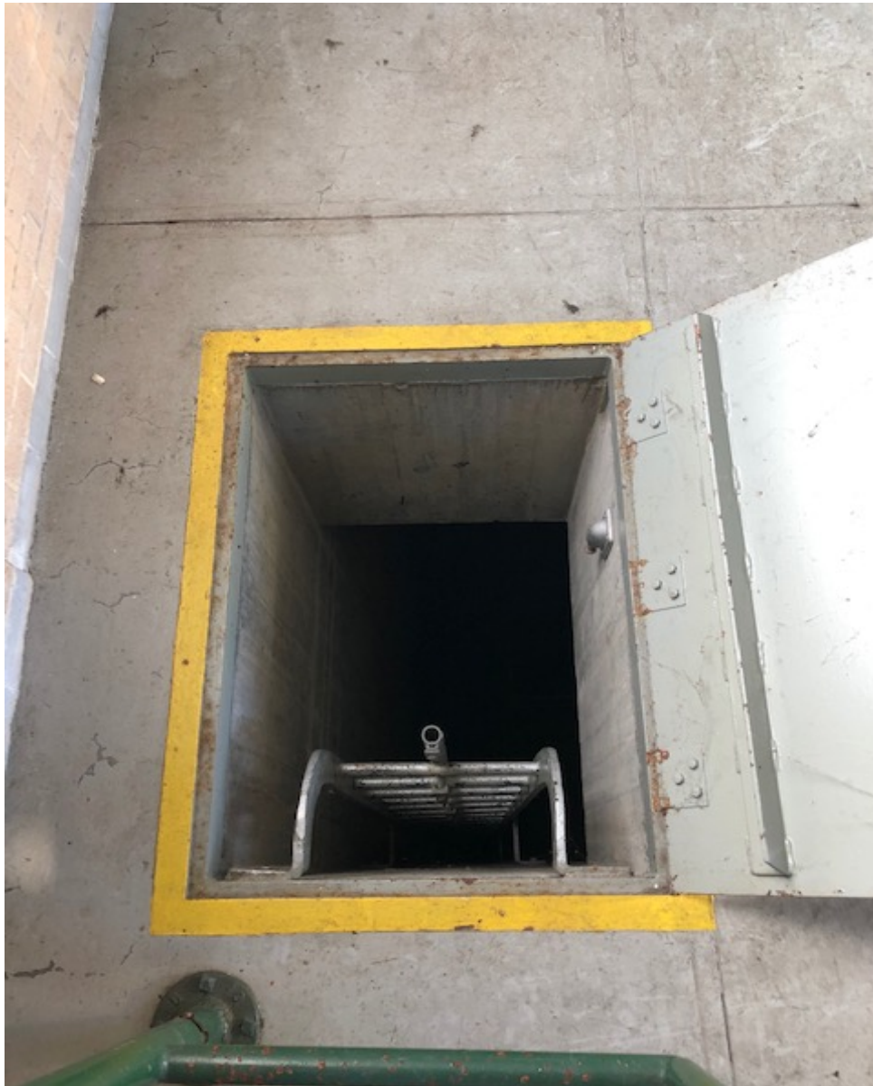
Exhibit B: Operating Floor Access Hatch to Gate Well and Inspection Gallery where lower sheaves and gate is located.