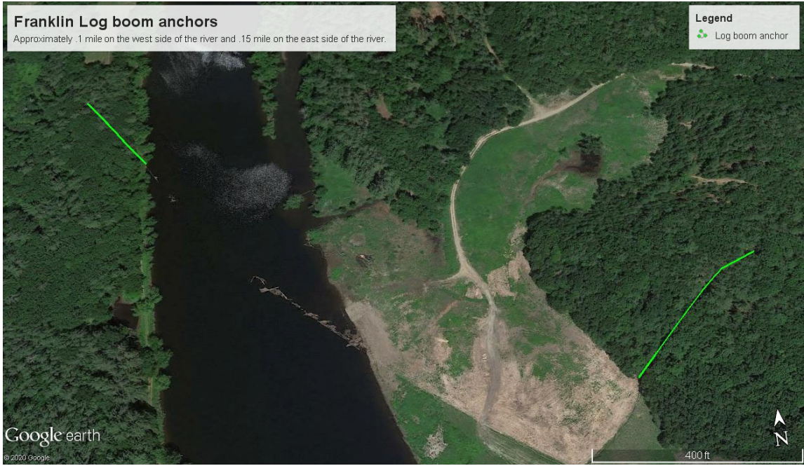
Exhibit F: Vegetation removal along log boom anchors.