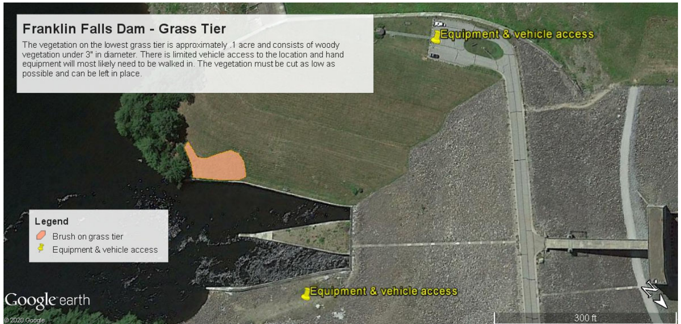
Exhibit D: Vegetation removal on third tier of Franklin Falls Dam.