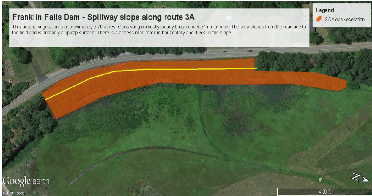
Exhibit C: Vegetation removal on rip-rap slope along Route 3A.