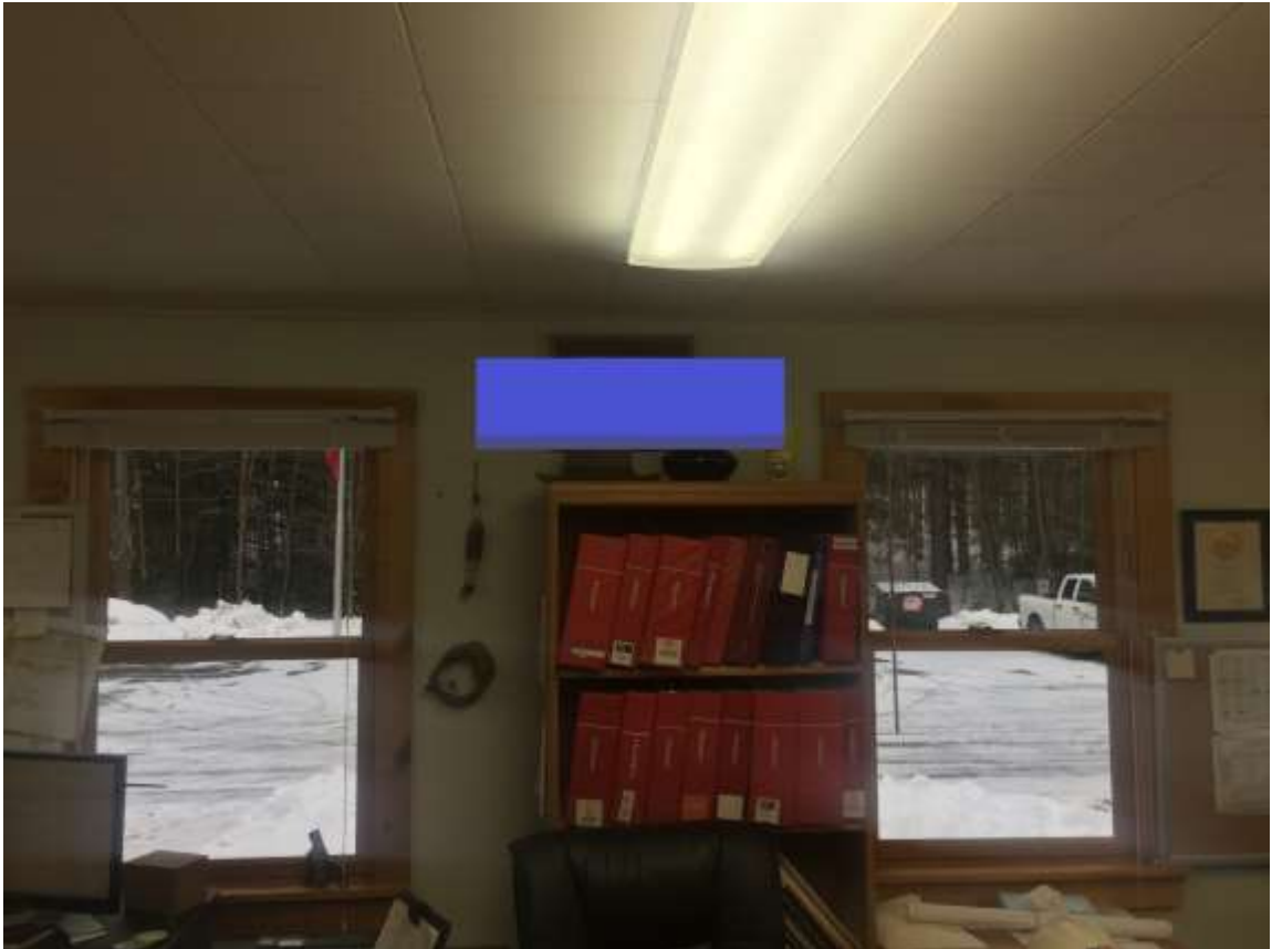
Informational Photo Ball Mountain Lake Office: Blue box represent possible installation location for interior unit 2.