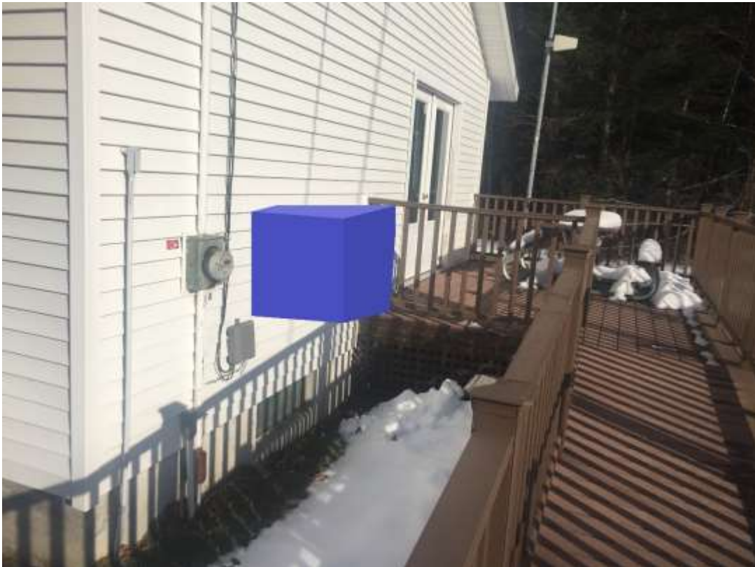
Informational Photo Ball Mountain Lake Office: Blue box represent possible installation location for exterior unit.