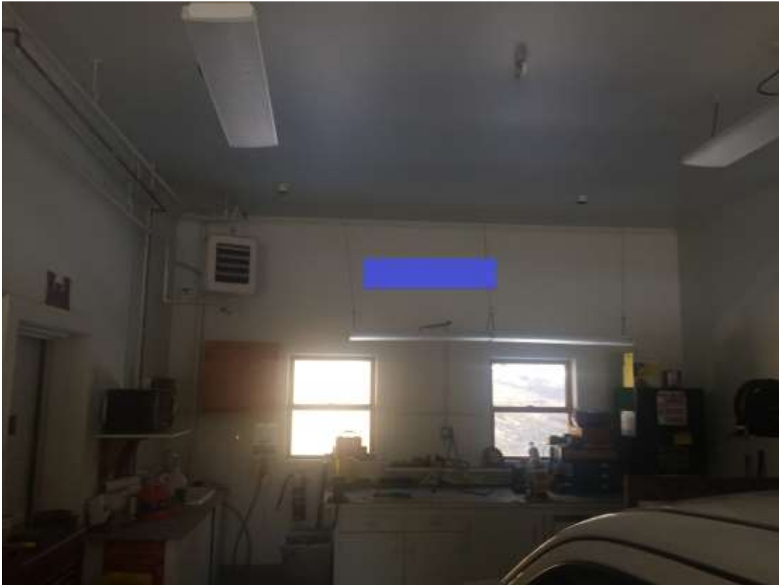
Informational Photo Townshend Lake Office: Blue box represent possible installation location for interior garage unit.