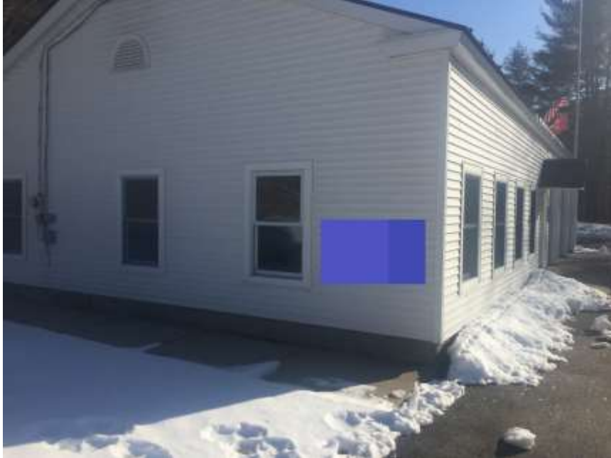
Informational Photo Townshend Lake Office: Blue box represent possible installation location for exterior unit.