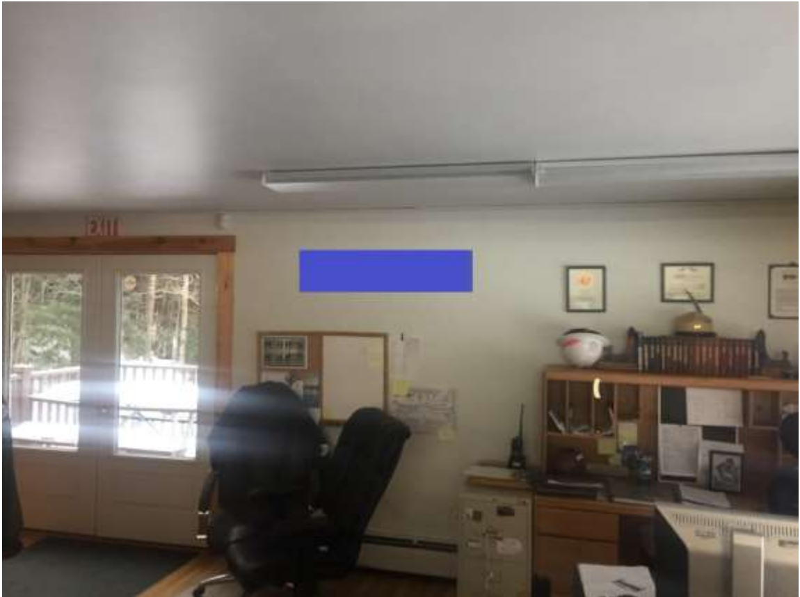
Informational Photo Ball Mountain Lake Office: Blue box represent possible installation location for interior unit 1.