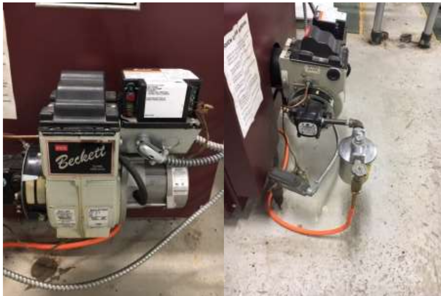
Informational Photos 2&3. Burner, double-walled lines and filter assembly.