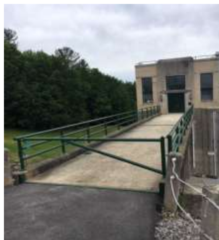
Informational Photo 12. View of the Gate House and Service Bridge. Standard size commercial trucks are able to back up on bridge.