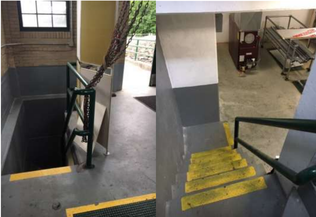
Informational Photos 10&11. View of staircase leading from the main floor of the Gate House down to the Furnace Room. Stairs are 32" wide.