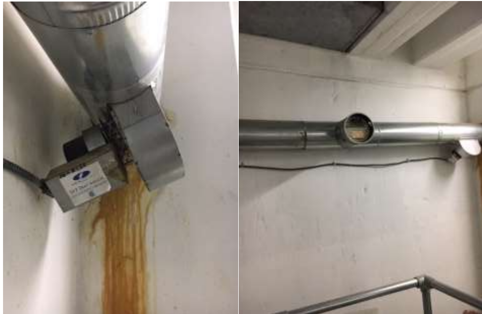
Informational Photo 5&6. View of the existing Draft reducer attached to ductwork located on the furnace room floor of the Gate House.