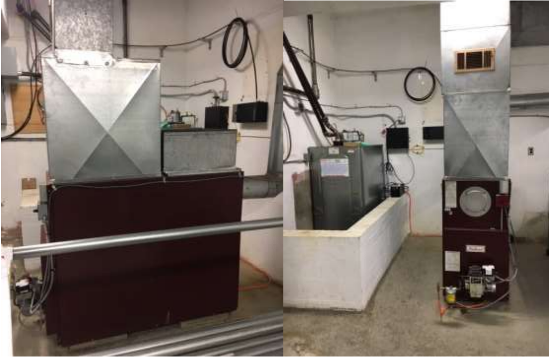
Informational Photos 8&9. Furnace placement with fuel tank.