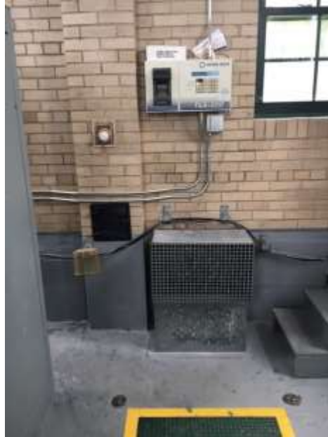
Informational Photo 4. View of the existing ductwork located on the Operations Floor and Thermostat control.