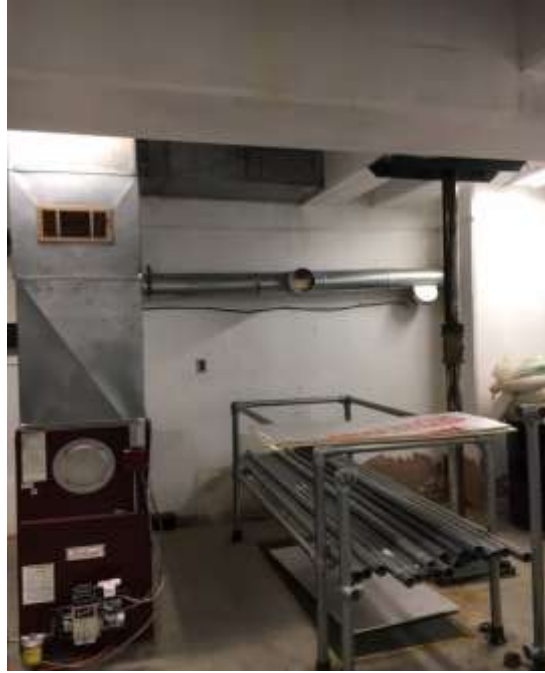
Informational Photo 1. Existing Warm Air Furnace, vent, and duct work.