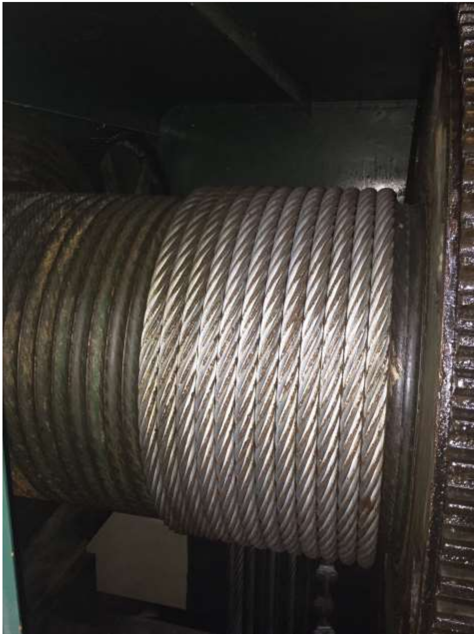
Informational Photo Number 2 – Wire rope on drum