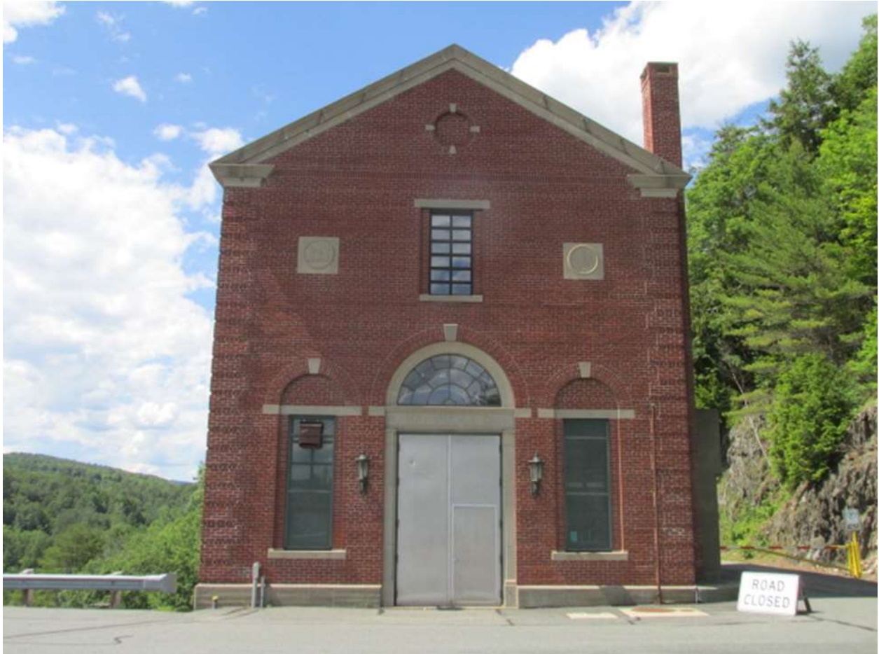
Informational Photo Number 1 – Union Village Dam Gatehouse