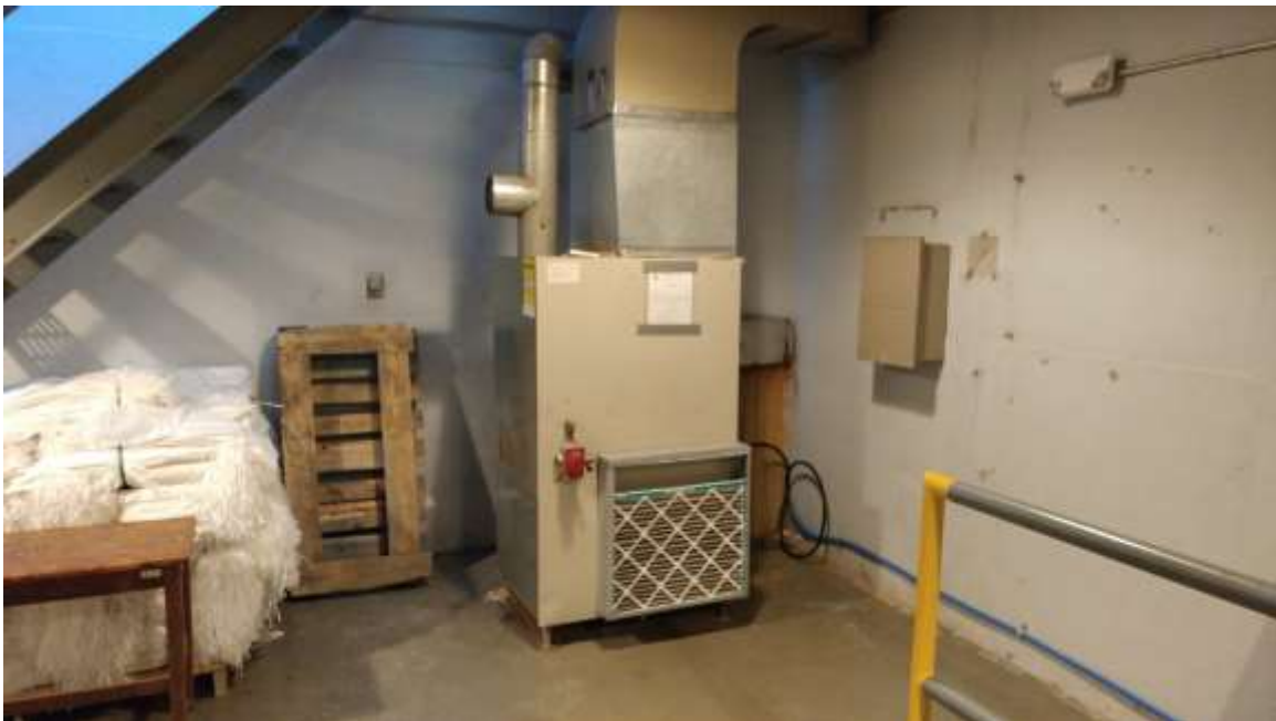
Informational Photo 2: Highboy Furnace to be removed for disposal