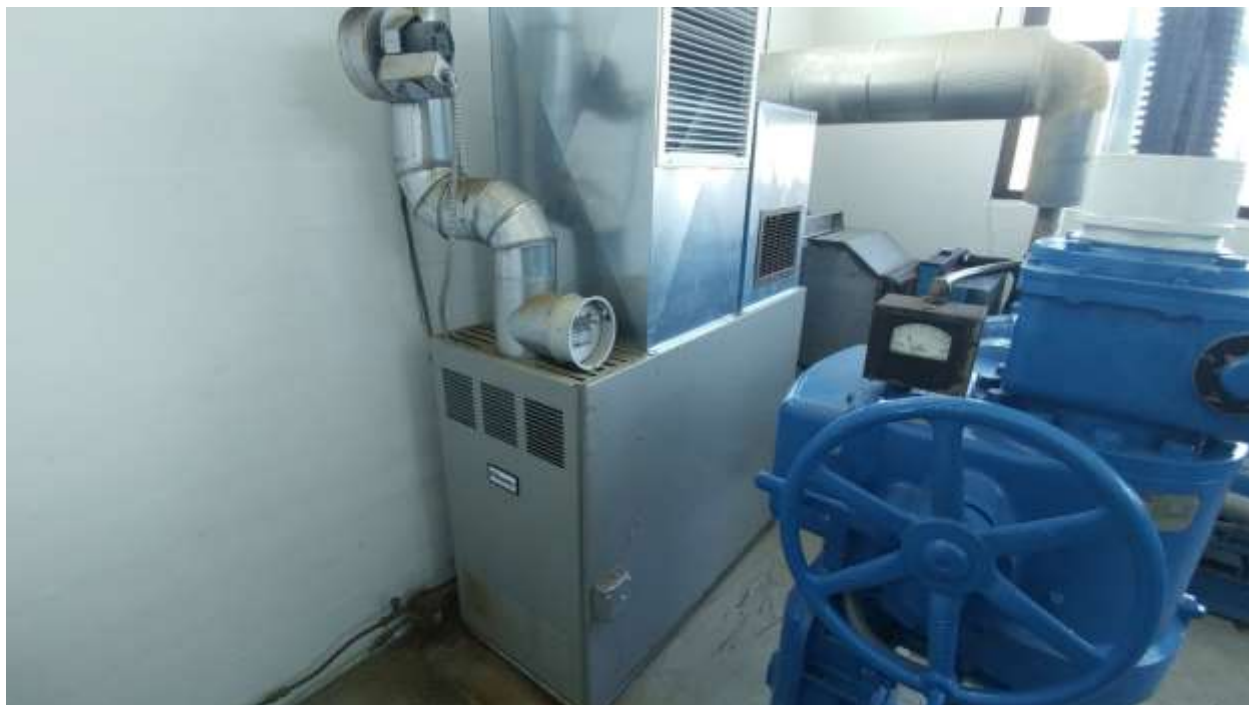
Informational Photo 3: Olson Furnace which has been removed from Hodges Village Dam Gate House to be reinstalled in the Buffumville Lake Gate House.