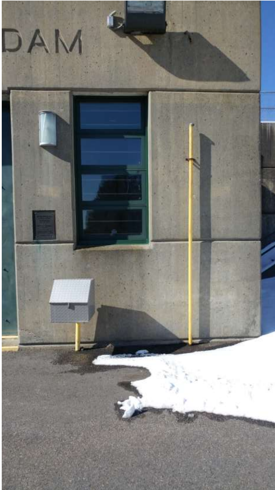
Informational Photo 5: Fill and vent pipes at Buffumville Lake