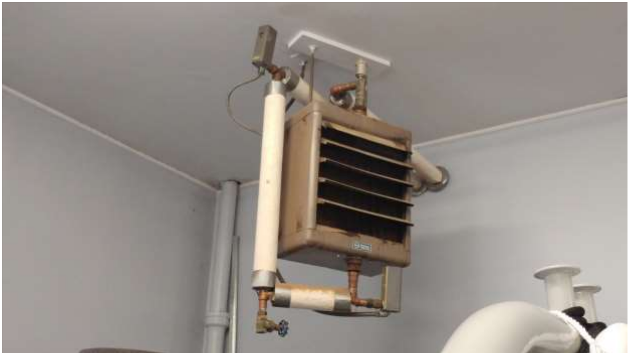
Informational Photo 7: Hydro Unit Heater, Garage Bays at Buffumville Lake Park Office