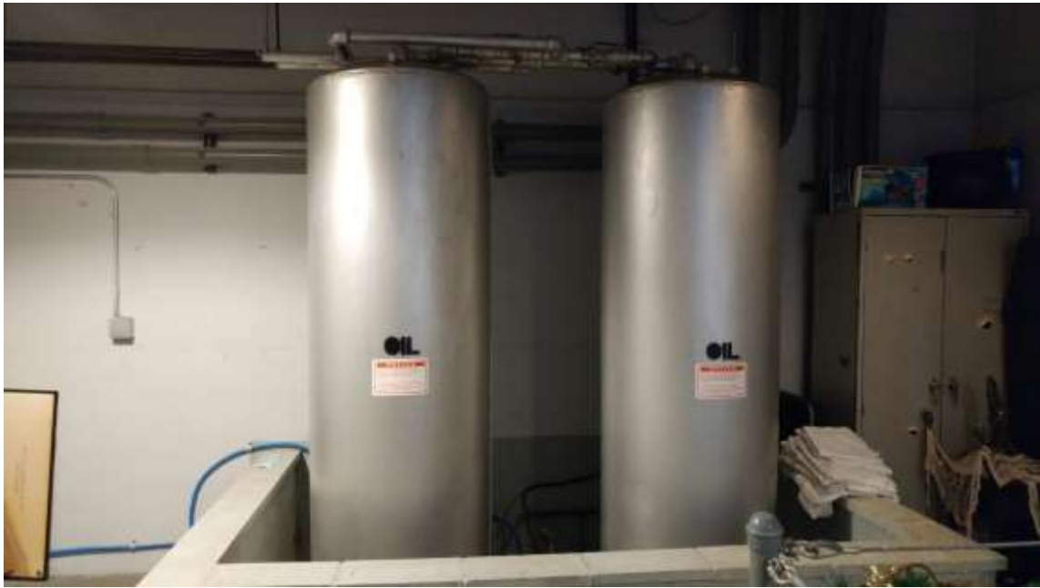
Informational Photo 1: Oil Tanks to be removed