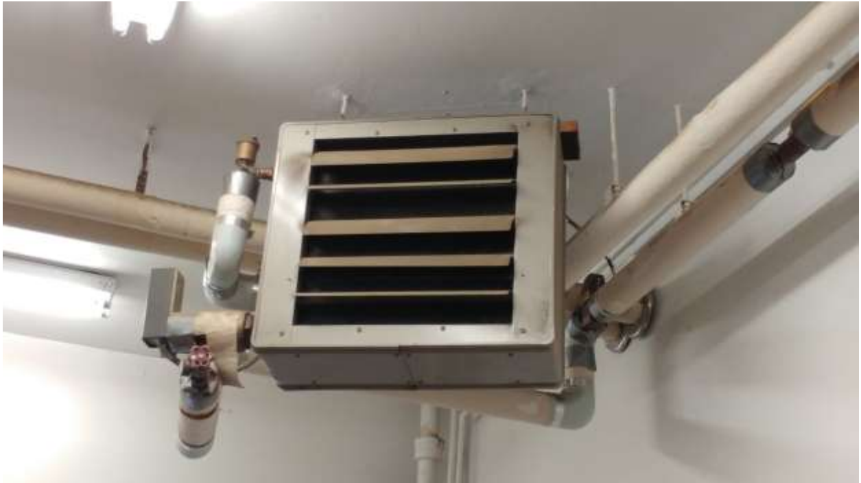
Informational Photo 6: Hydro Unit Heater, Tool Bay at Buffumville Lake Park Office