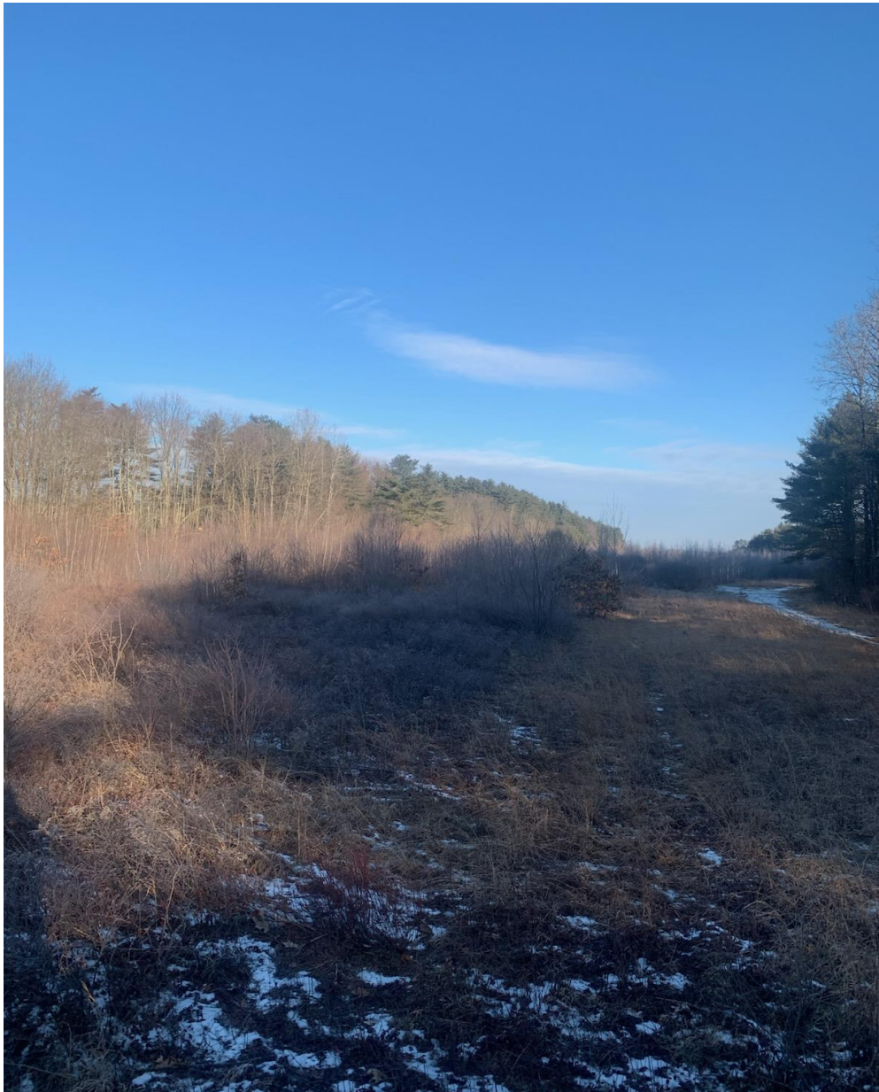
Exhibit C: Hopkinton Spillway Work Site