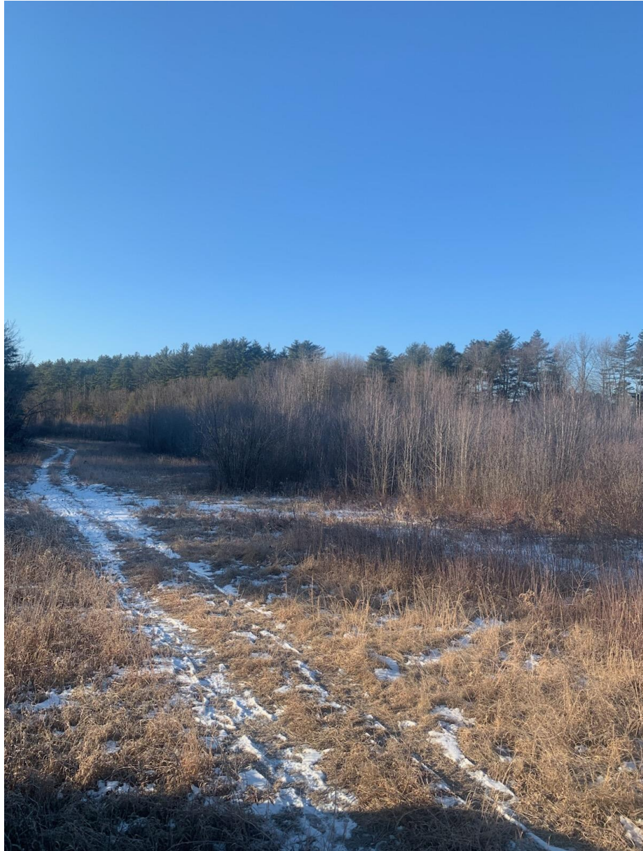
Exhibit B: Hopkinton Spillway Work Site