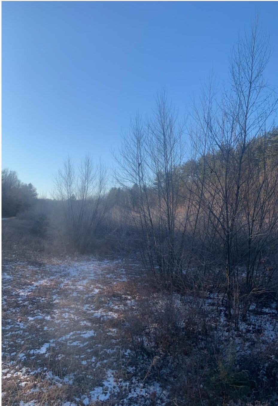
Exhibit E: Hopkinton Spillway Work Site