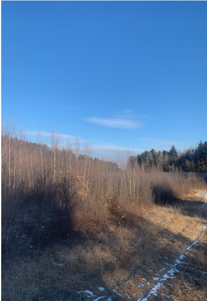
Exhibit D: Hopkinton Spillway Work Site