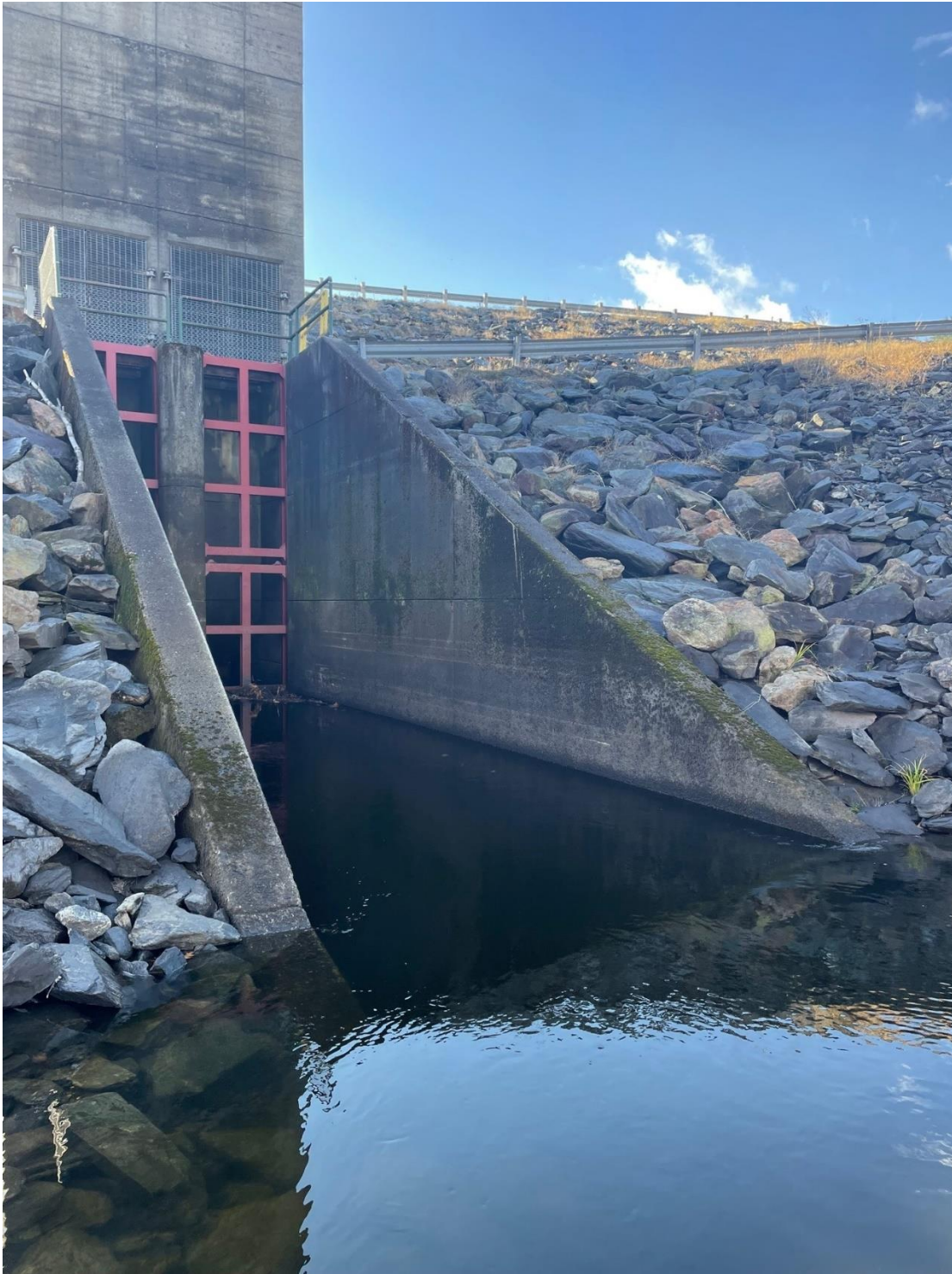
View of inlet apron