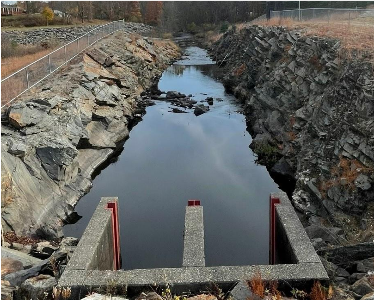
View of outlet channel