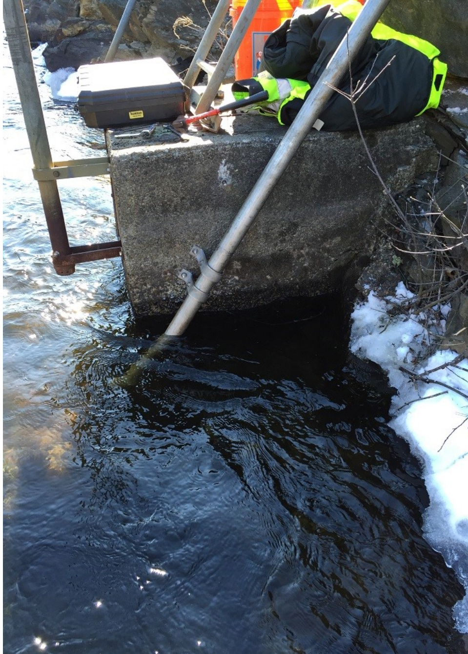
Additional Photo of Outlet Pipe - Amendment 0001