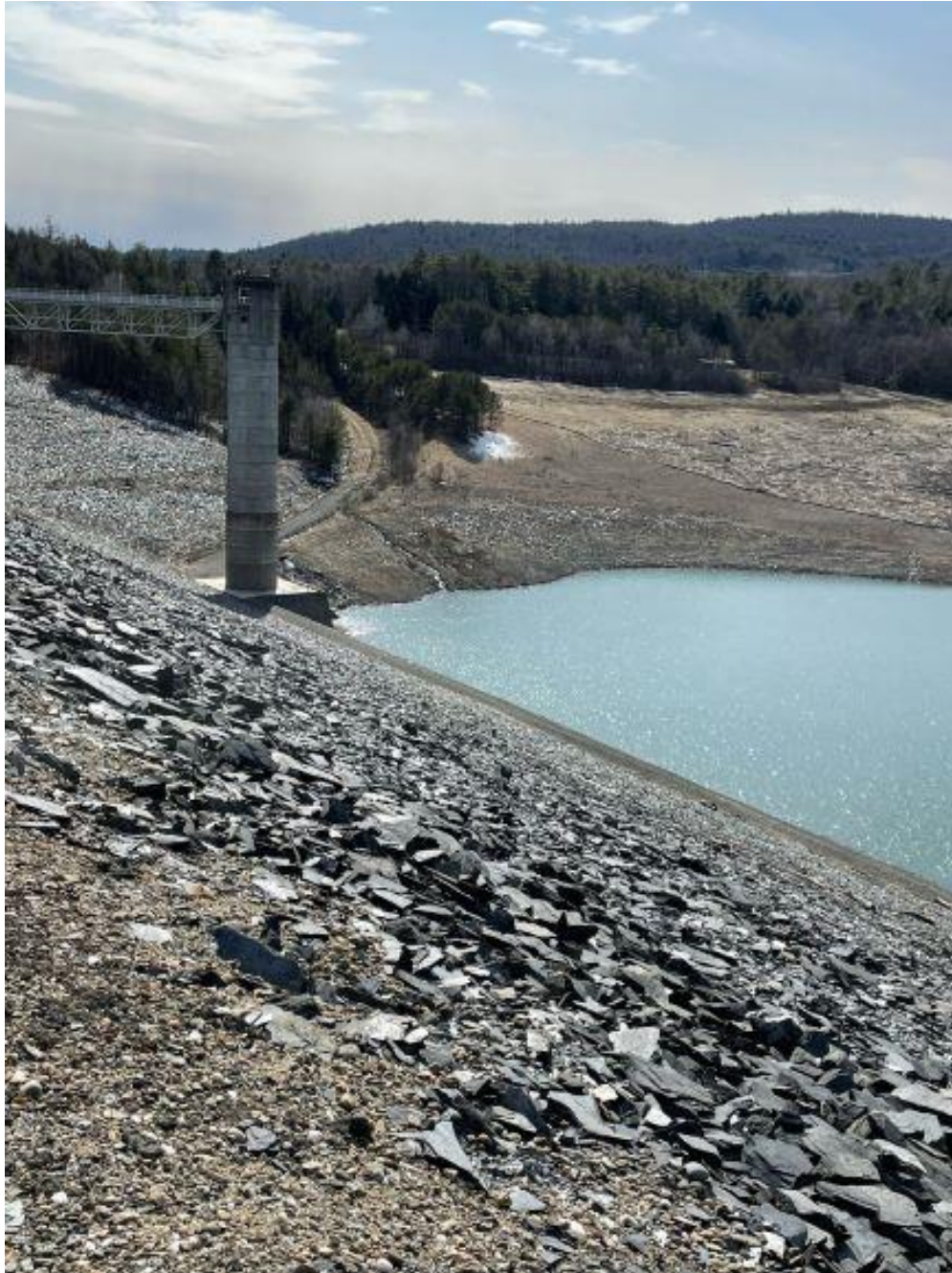
Informational Photo 1: Access Road showing concrete tower