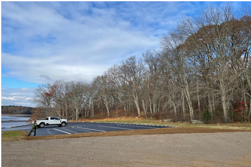
Image 2: Existing site conditions for guard rail installation. Guard rail to be installed in the dirt/grass berm.