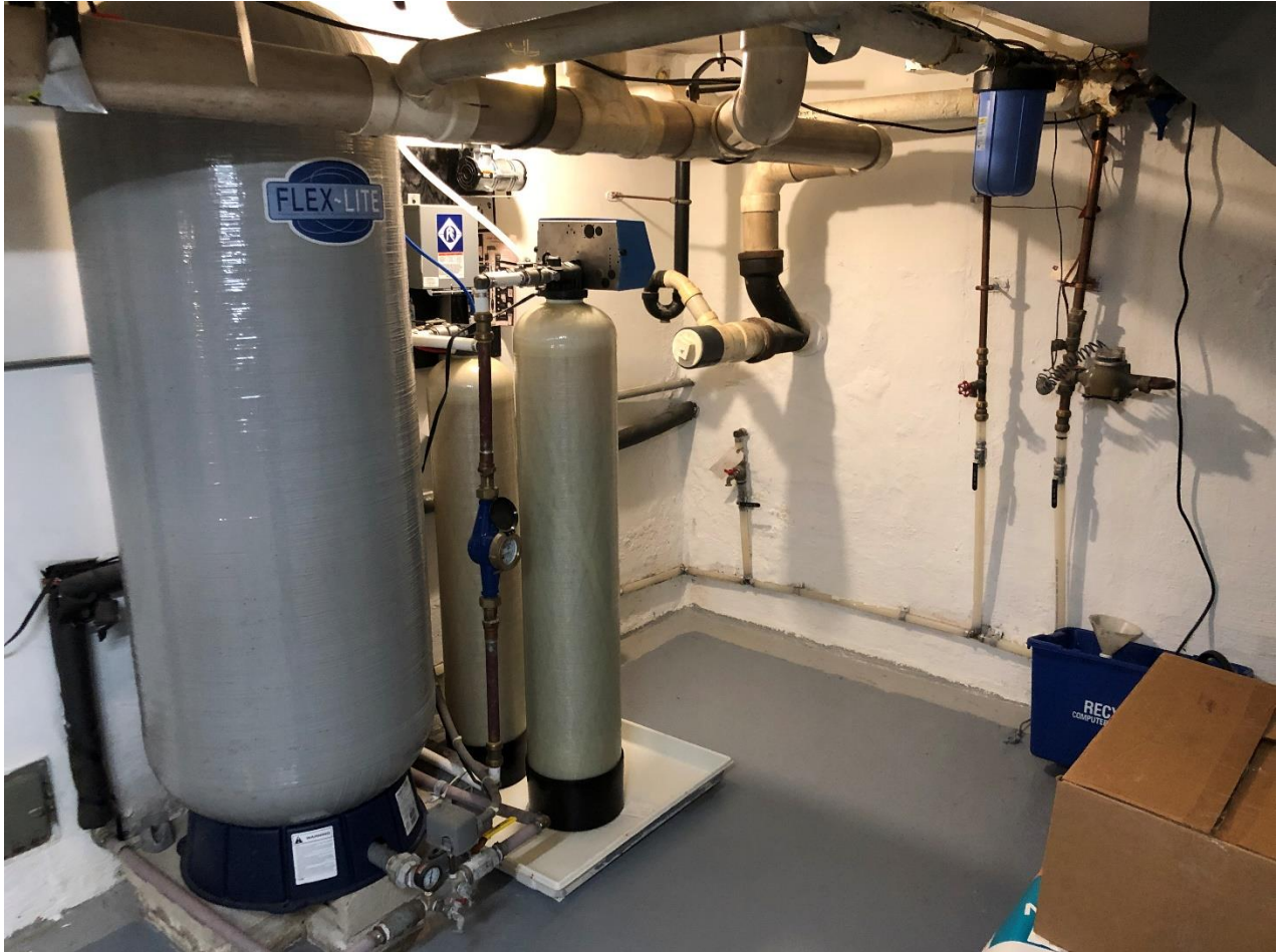
Informational Photo 1: Image of Edward MacDowell pressurized water system setup.