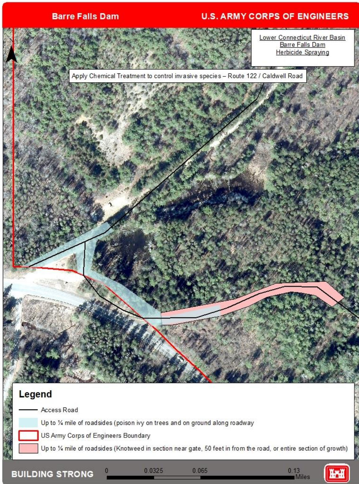
Figure 5: Route 122 area heading into Caldwell Rd area / Caldwell Road