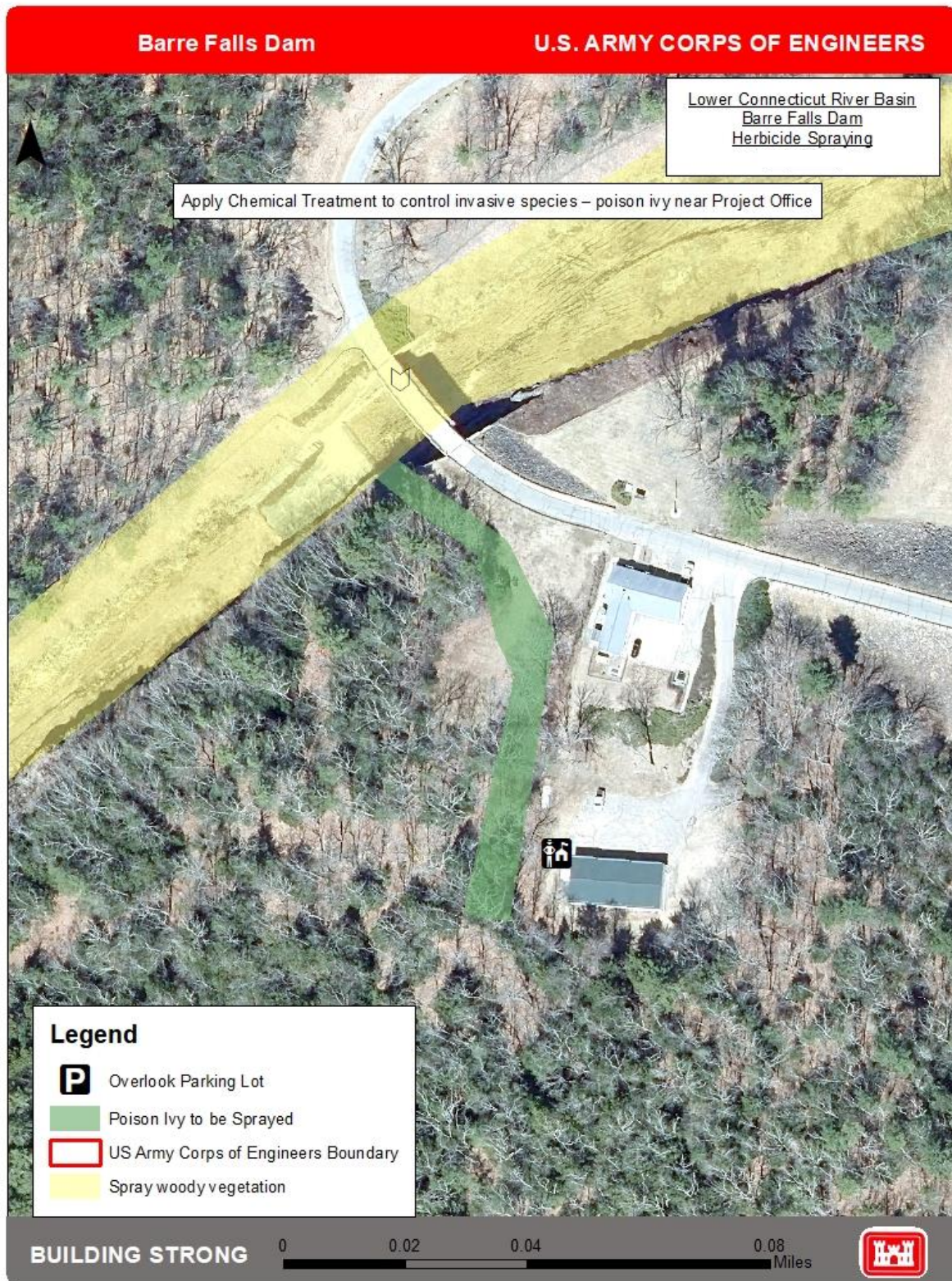
Figure 3: Overview of Project Office Area & Dam Area