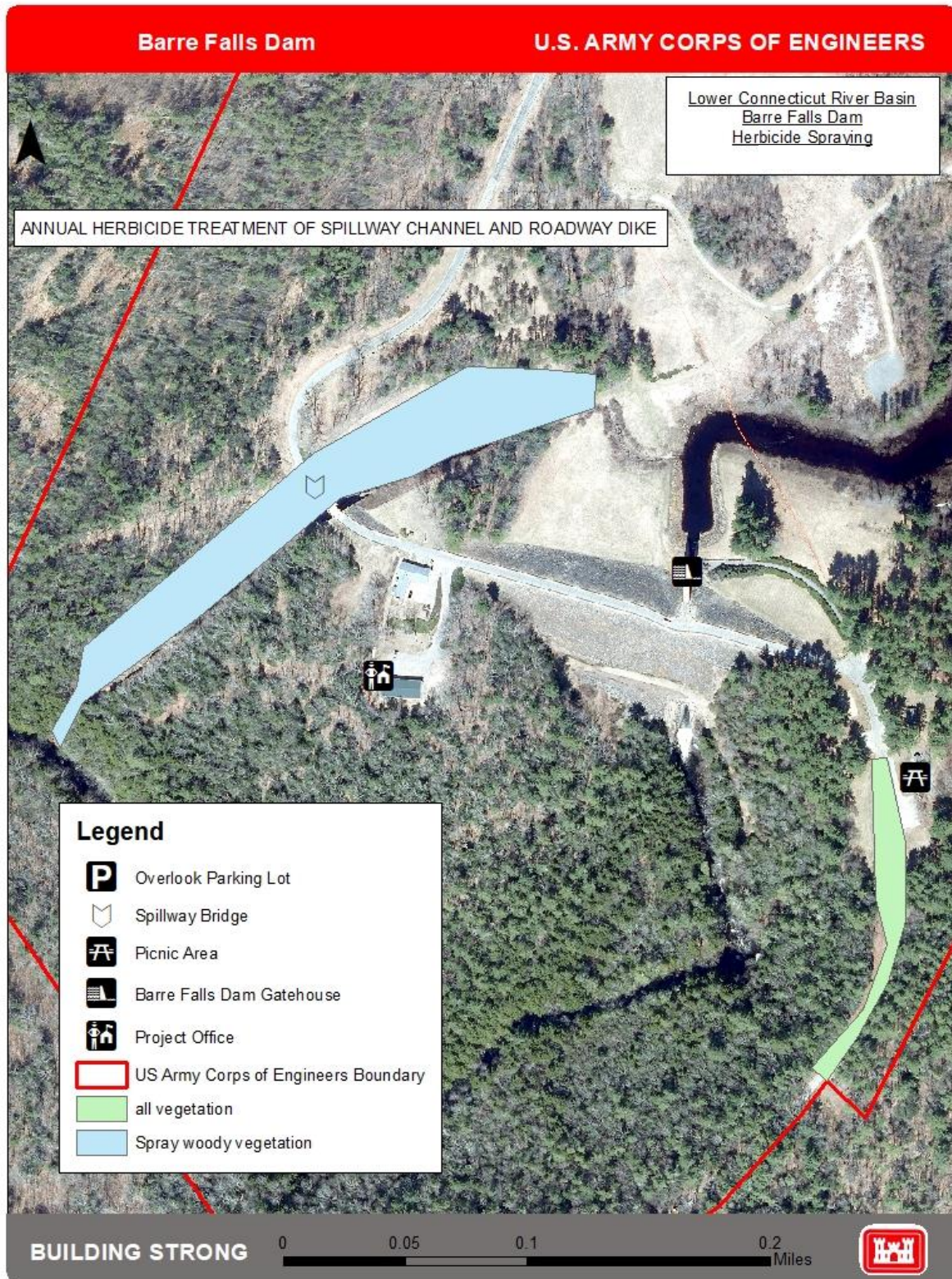
Figure 2: Overview of Project Office Area & Dam Area