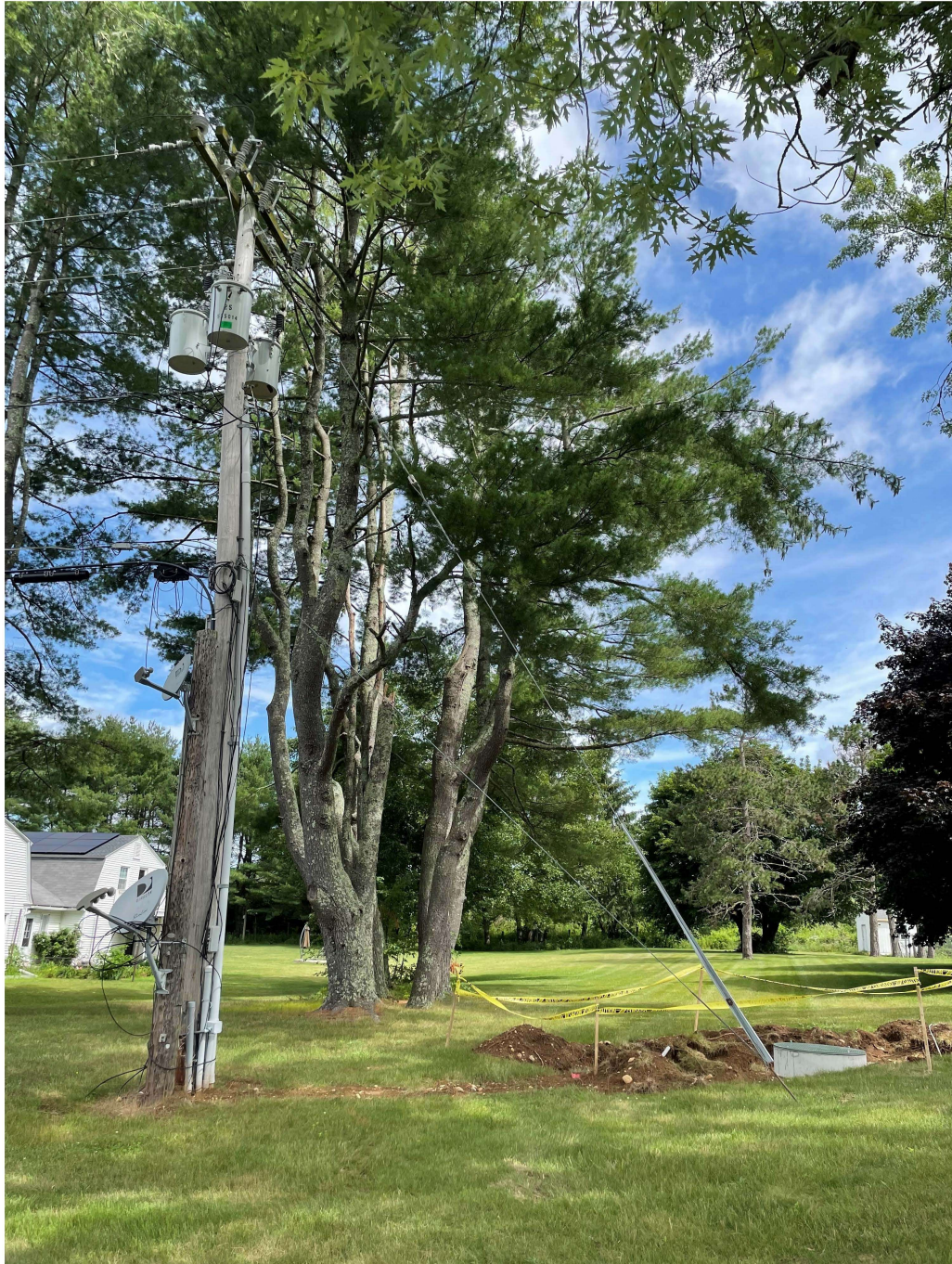
Image 2: View from the south of site in relation to existing electrical structure