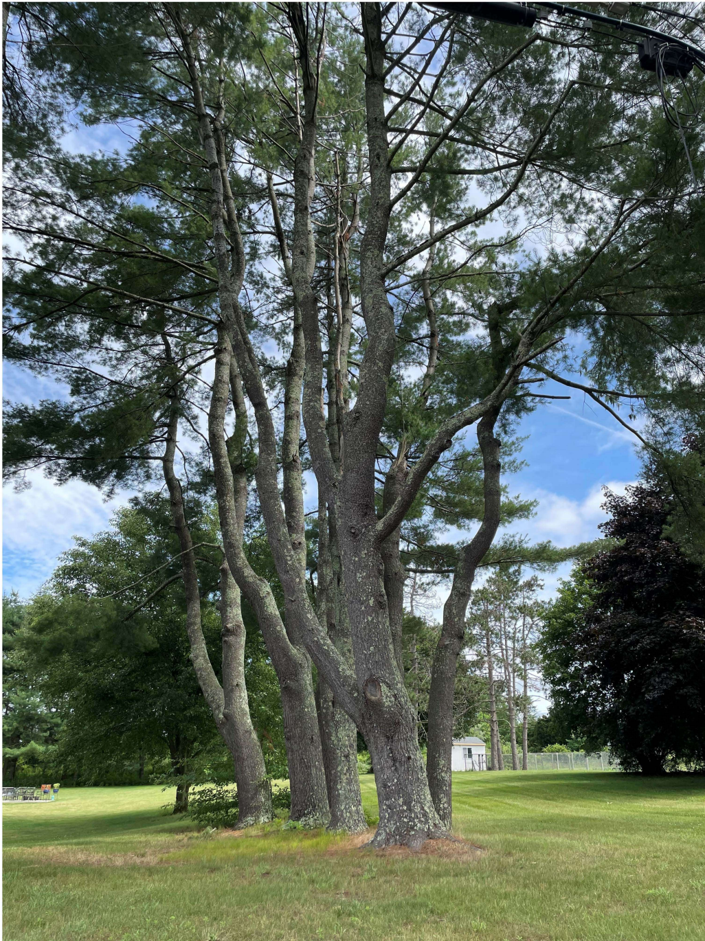
Image 1: View of 8 eastern white pines taken from the south western boundary of project site