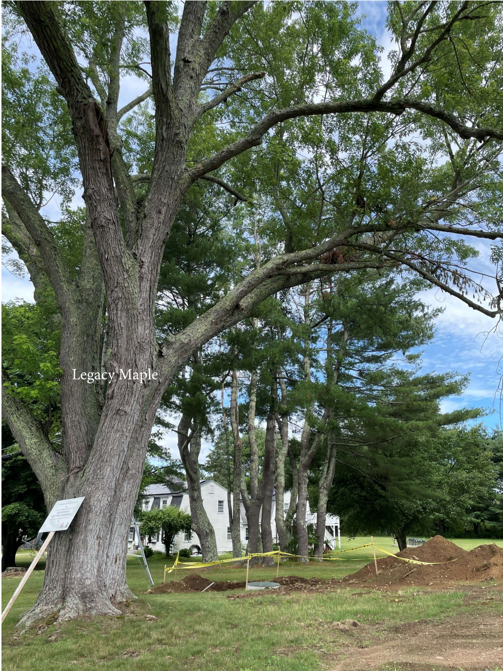
Image 3: View from south of the project- existing electrical structure behind legacy maple on left side with the pine trees slated for removal behind