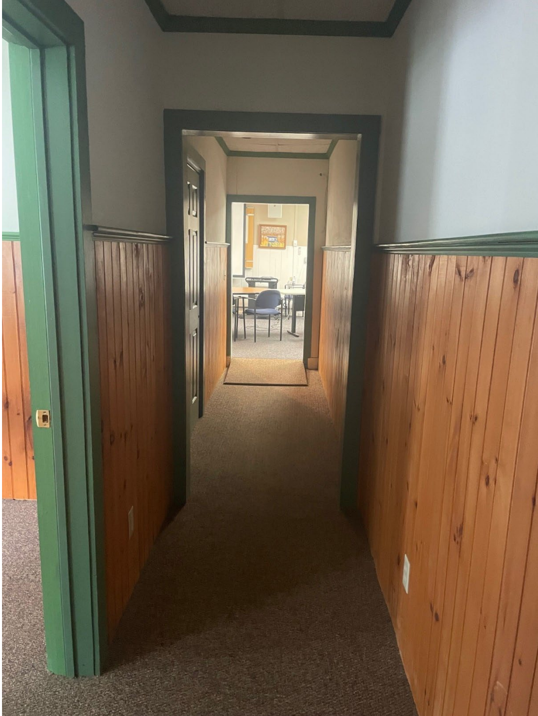
Image of conference room hallway