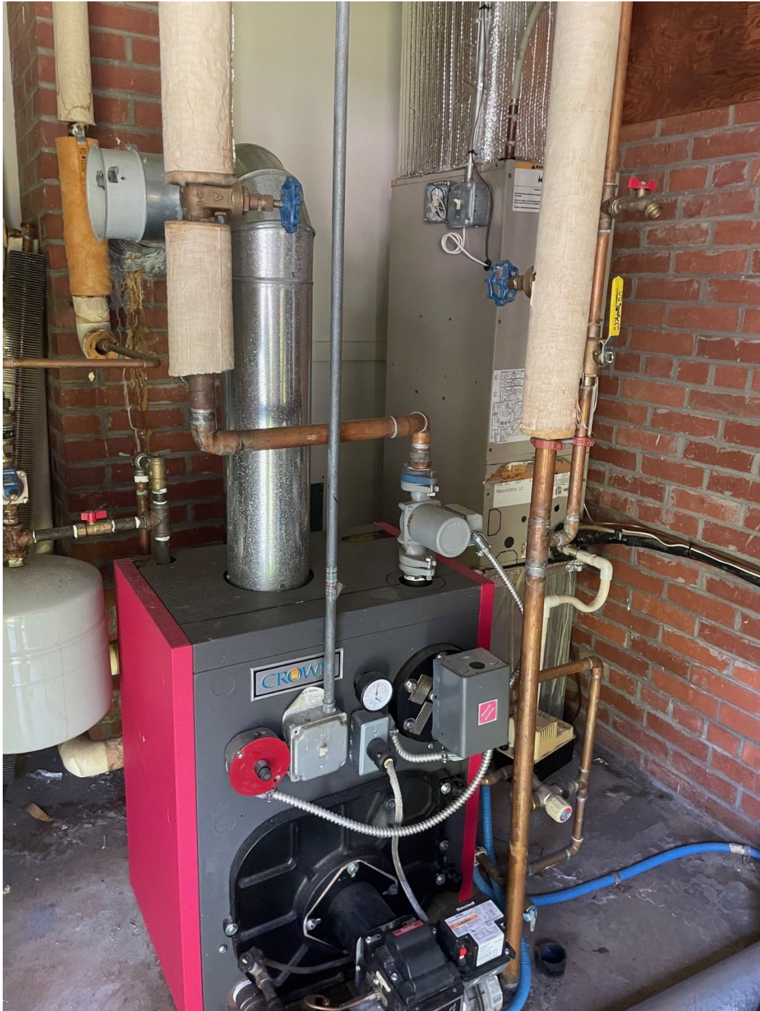
Image of current Oil boiler