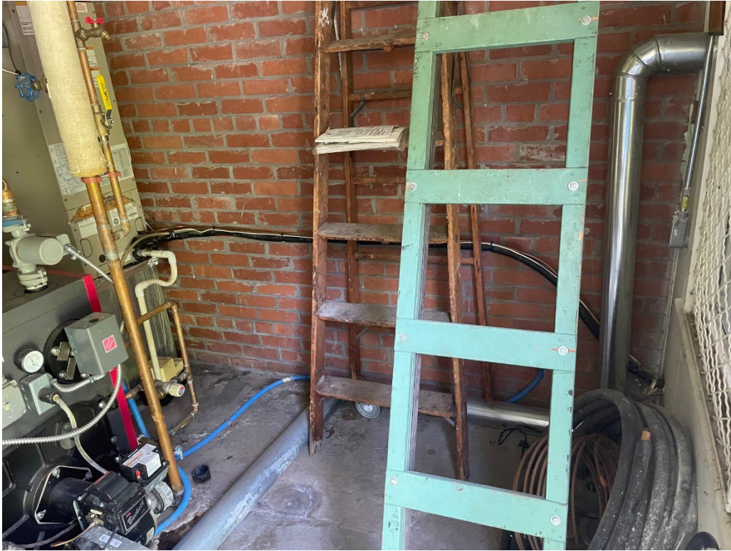
Image shows the AC condenser line sets where they enter the building on the right and the air handler on the left.