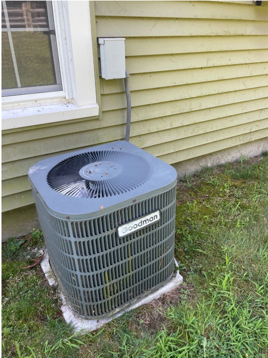
Image of current Goodman AC condenser and pad.