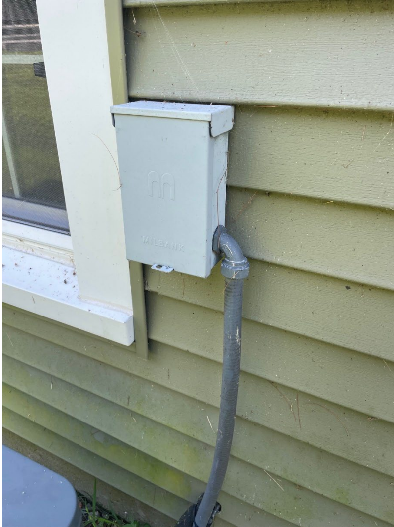
Image of the exterior wiring locking disconnection box.