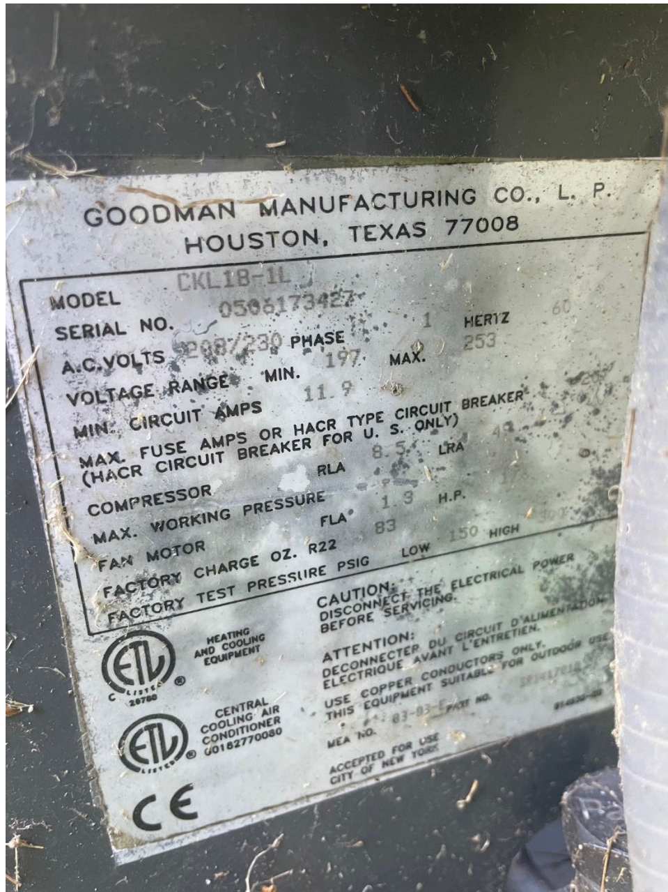
Image of current Goodman AC condenser label.