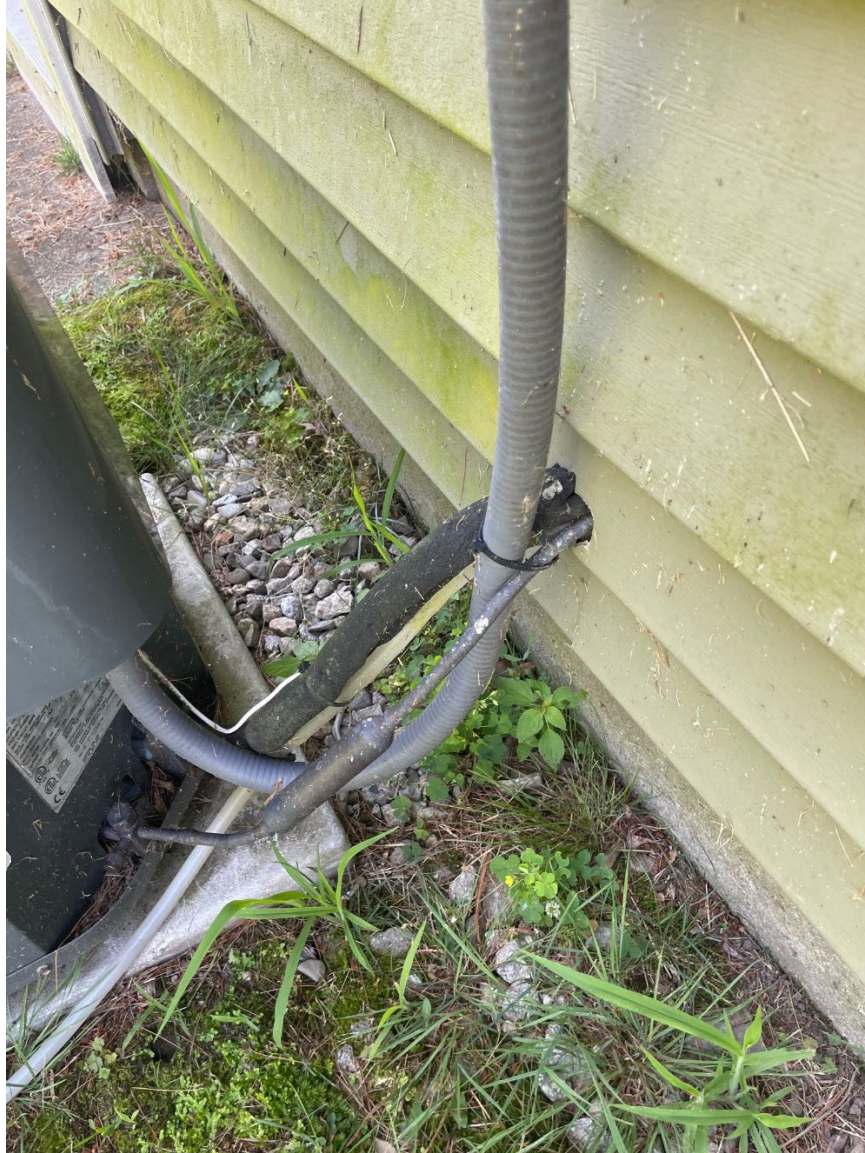
Image of AC Condenser lines where they enter the building.