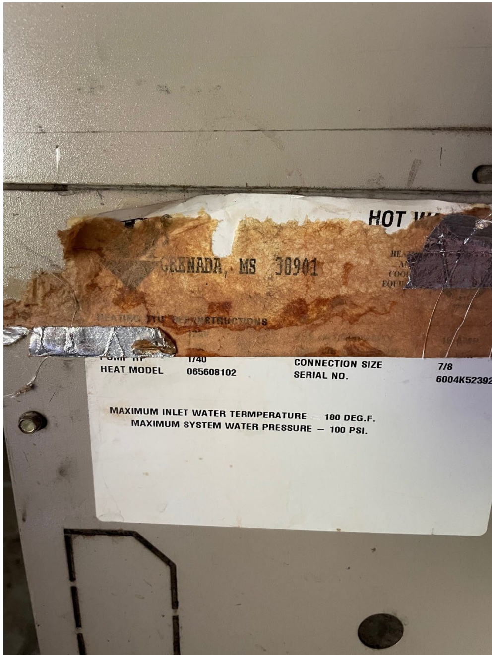
Image of label on existing air handler