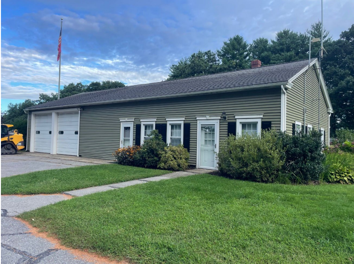
Image of Hodges Village Dam Conference Building