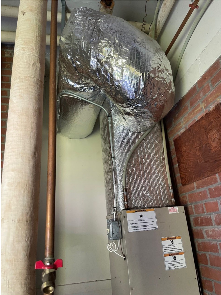
Image of existing air handler and duct work