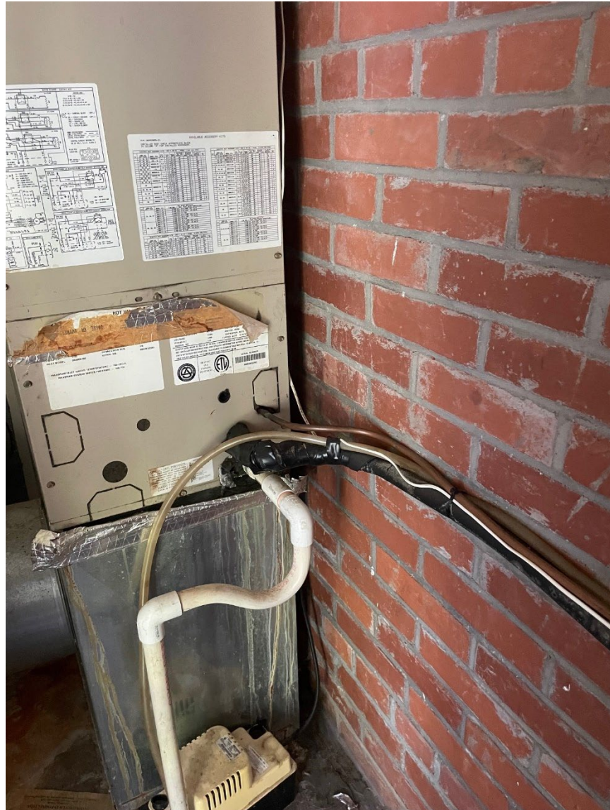
Image of current air handler.