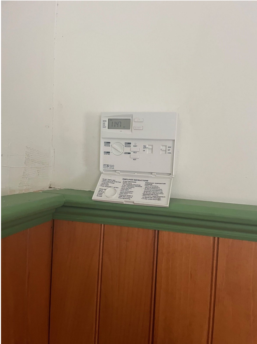
Image of thermostat that controls HVAC system