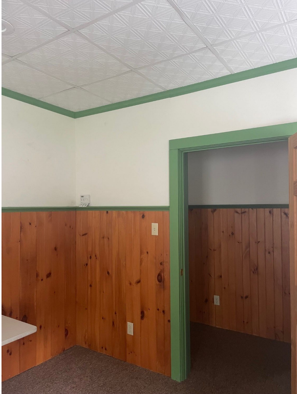
Image of back room and thermostat in conference building