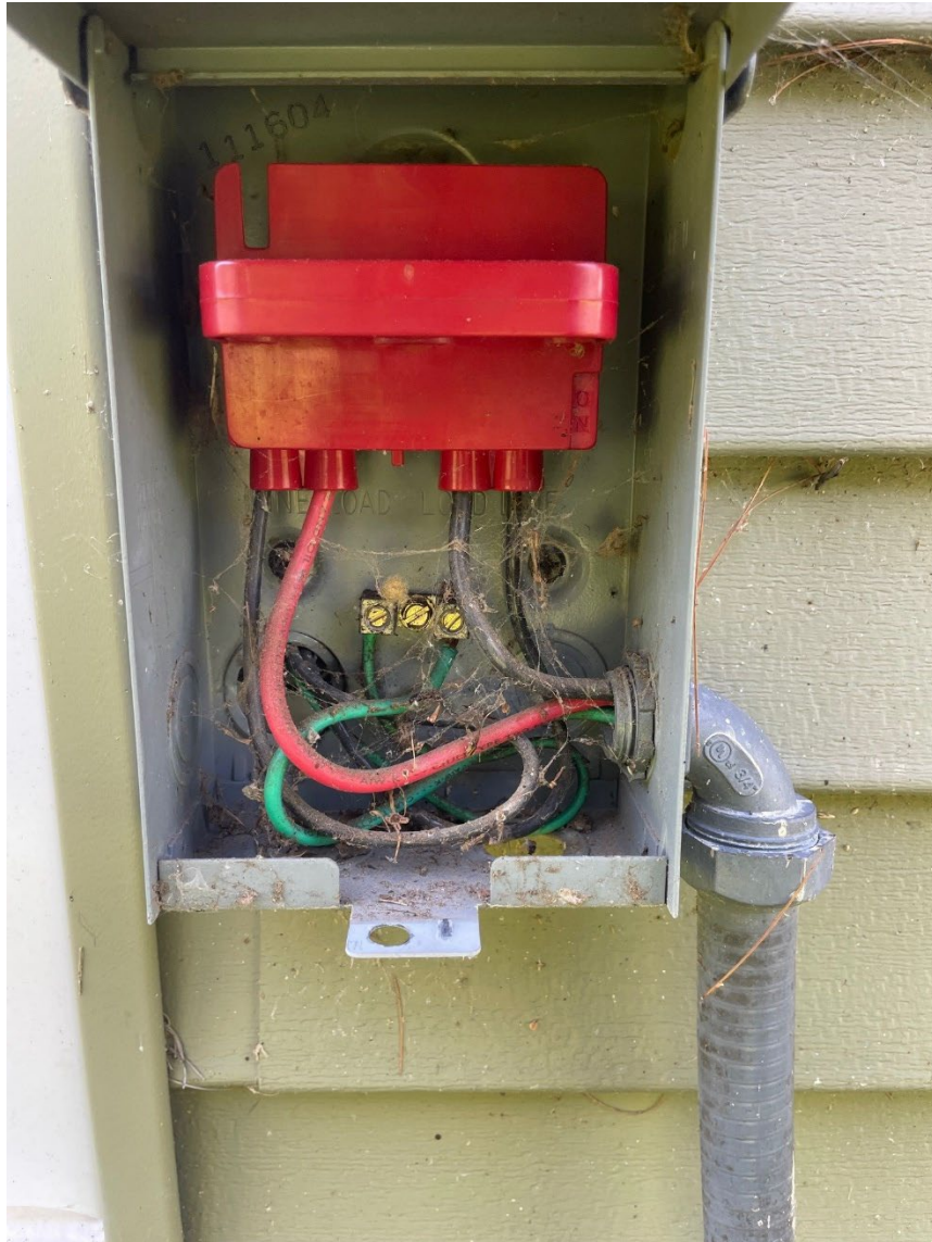
Image of inside of exterior wiring disconnect.