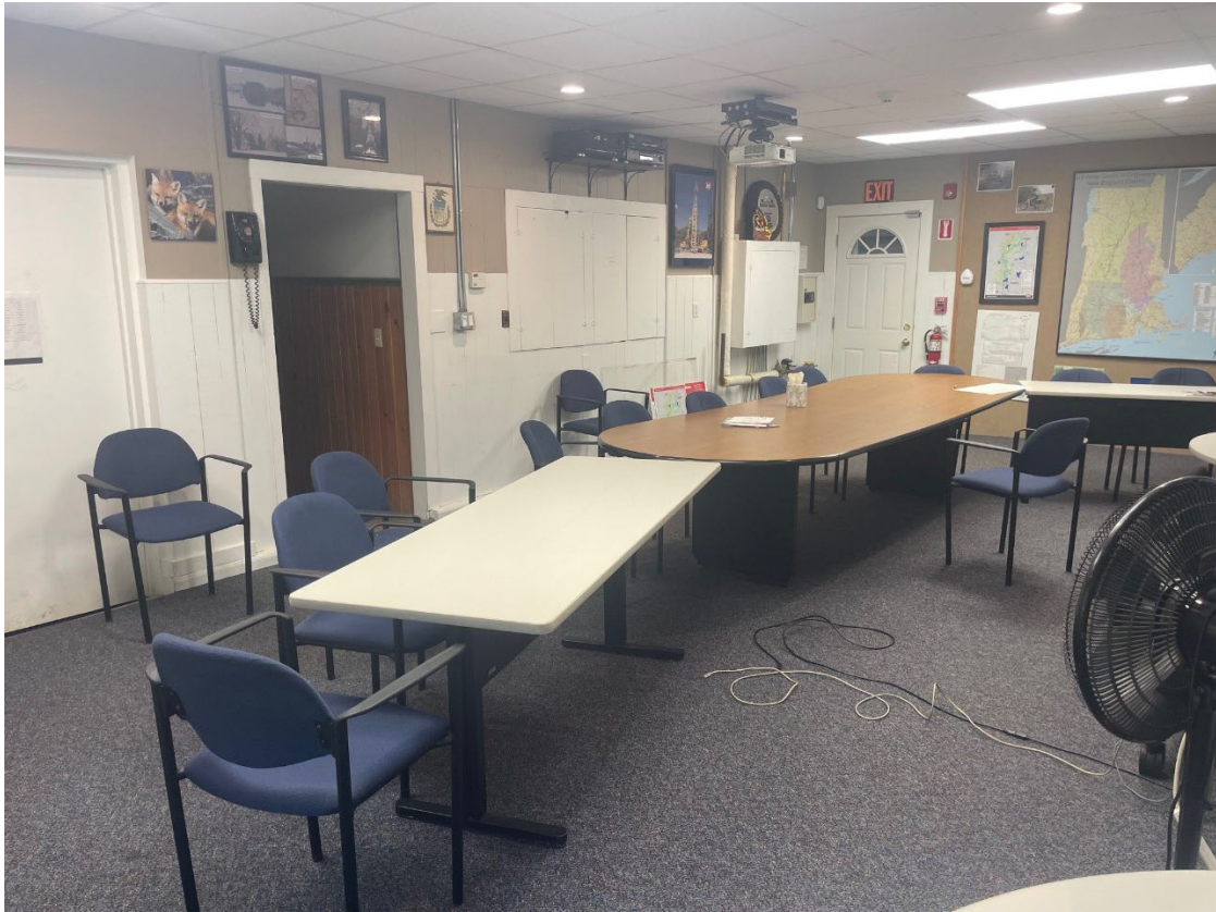
Image of interior of conference room