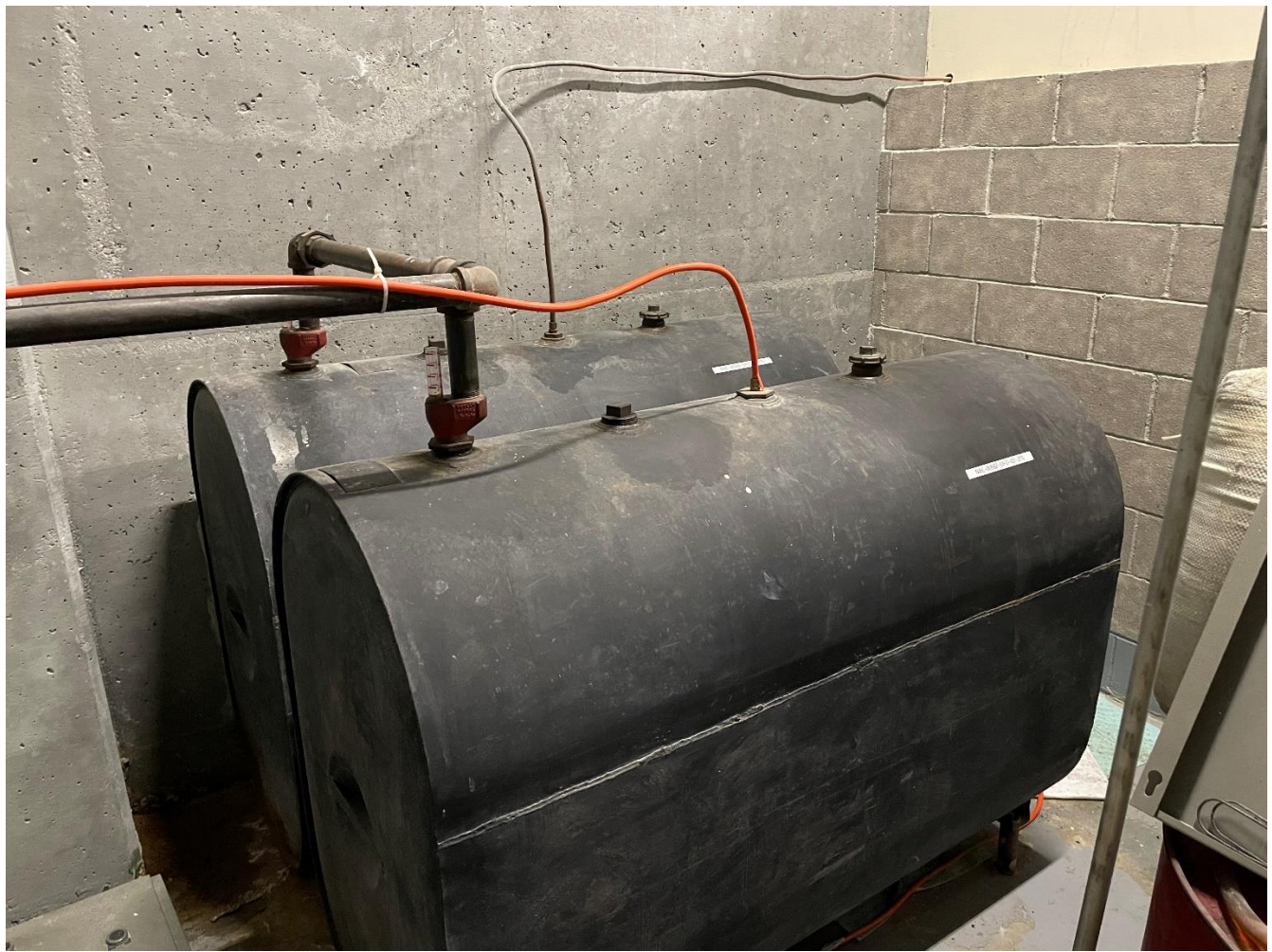
<u>Photo 5</u>: Image showing another view of the two 275-gallon fuel tanks. Again, note the location of the return lines and vent piping.