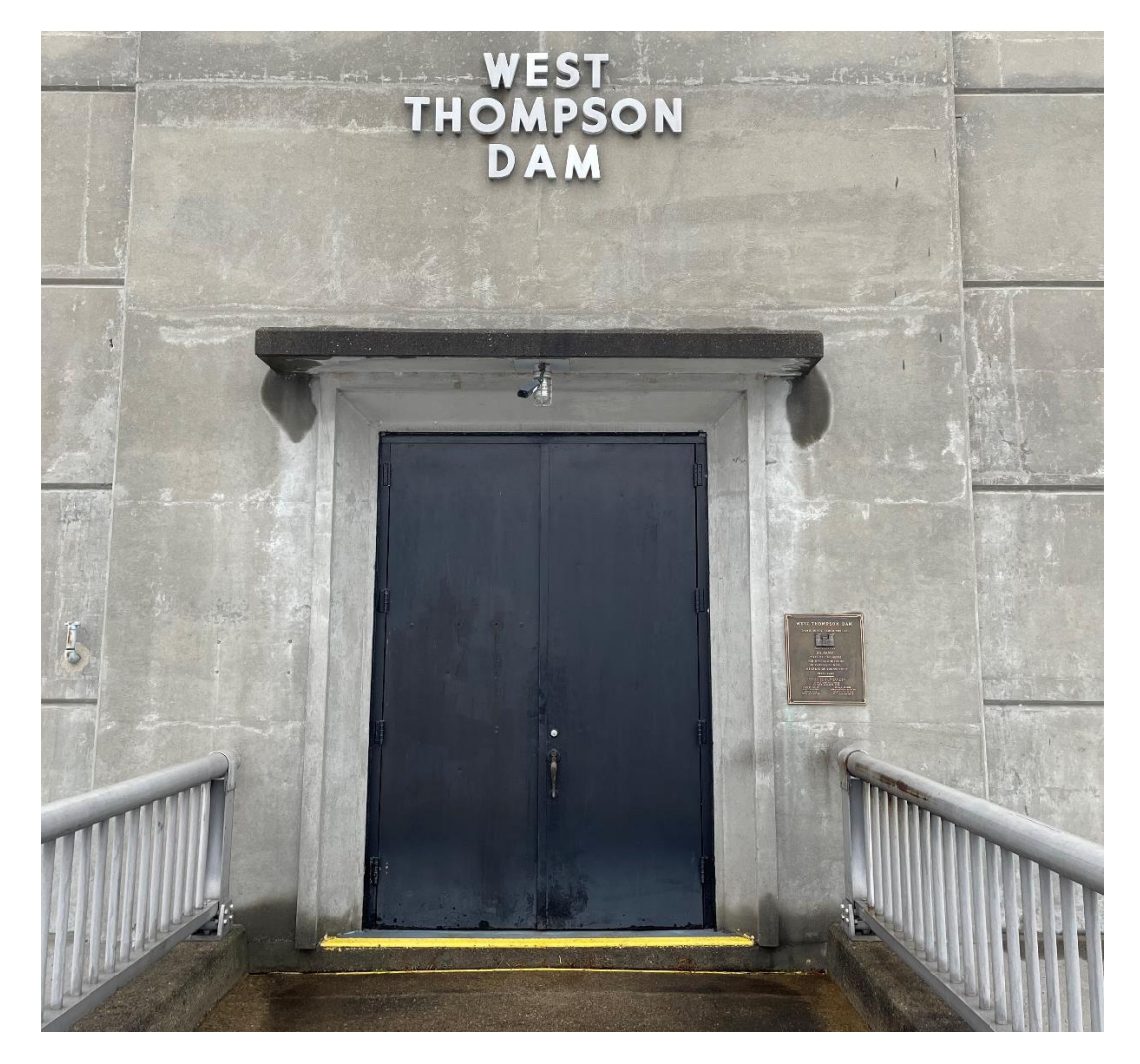
<u>Photo 1</u>: Image showing the outside of the West Thompson Lake Gatehouse. Doors in image are able to be opened up to create a 6' W X 9' H opening.