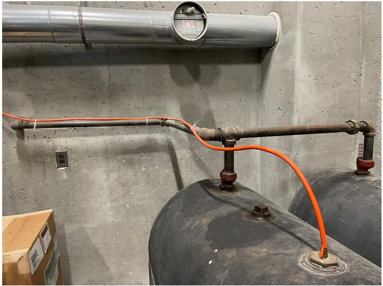
<u>Photo 8</u>: Image showing return line for heater and vent pipe that exits the gatehouse. Vent pipes are approximately 1.75" in size and exits through a hole in the gatehouse concrete wall.