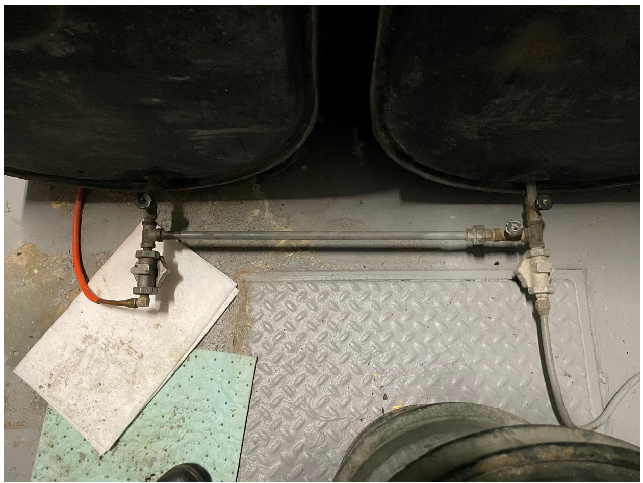
<u>Photo 7</u>: Image of the crossover pipe and supply lines to the heater/ generator. Lines are made up of 3/4" pipes which thread onto 1/2" supply/ return lines for both the heater (orange) and generator (gray).