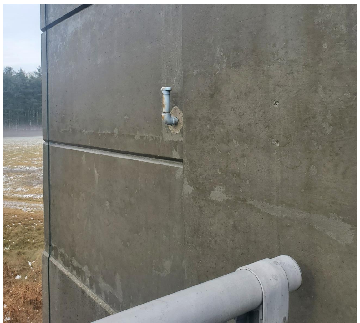
<u>Photo 9</u>: Image showing where vent pipe exits the gatehouse. Due to ease of access, usage of existing pipe through the wall is encouraged.