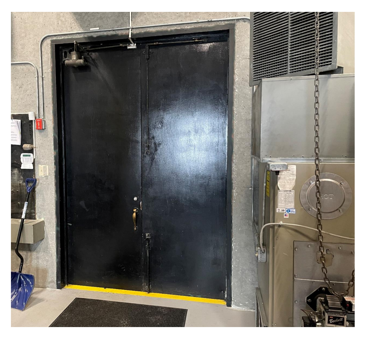
<u>Photo 3</u>: Image showing the backside of the gatehouse doors.