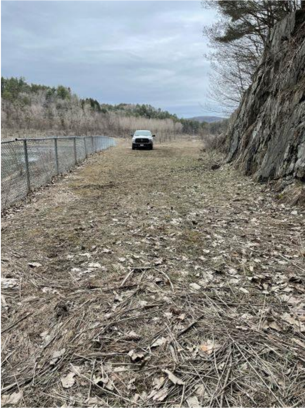
Informational Photo 2: Set up area for crane at intake