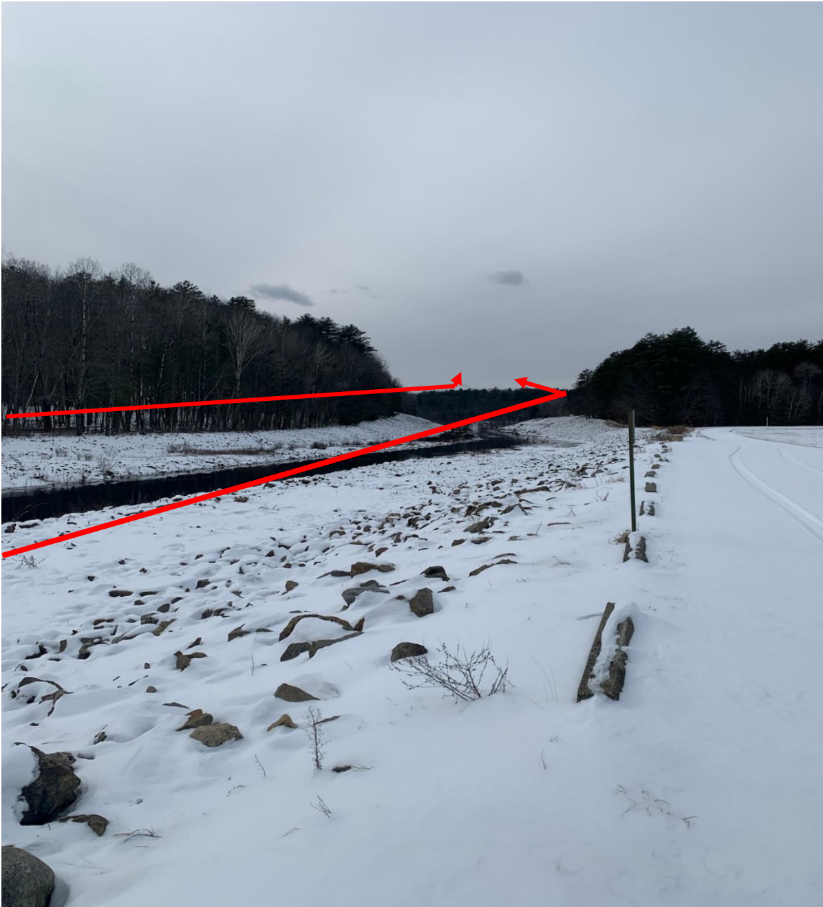
Exhibit G: Downstream work area access nearest the park road access is indicated by the arrow on the right of the water channel. Upstream work area access is indicated by the arrow on the left of the water channel.