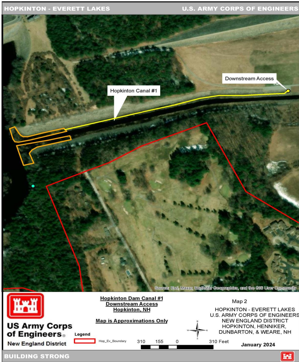
Exhibit B: Hopkinton Lake Canal No.1 Downstream Access.