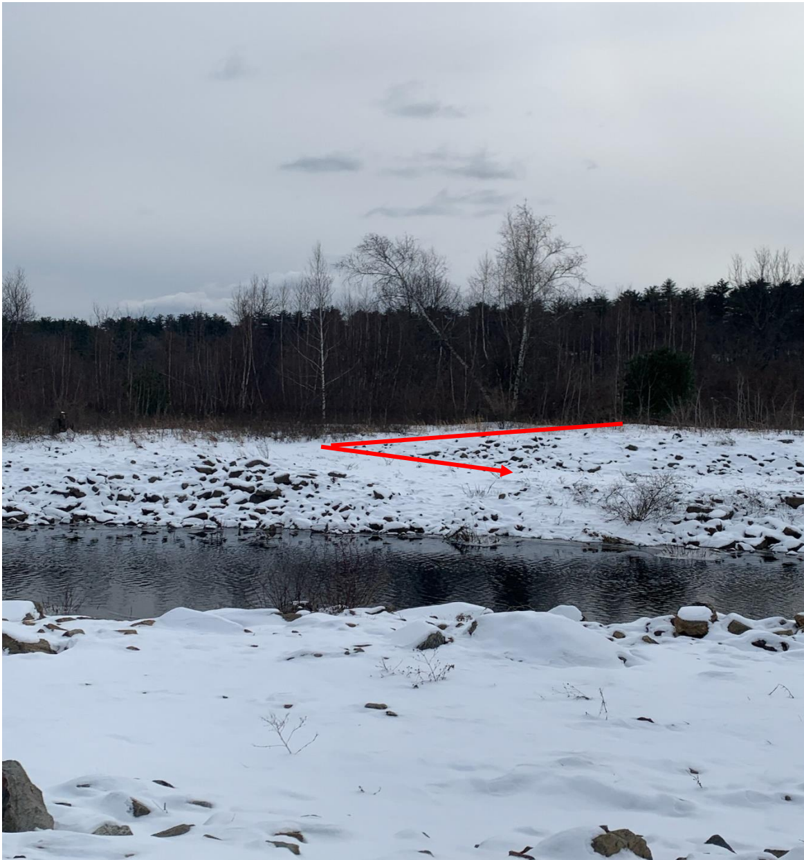
Exhibit I: Upstream work area access “ramp” “ramp” onto the flat rip rap floor of the canal nearest the agricultural field access.