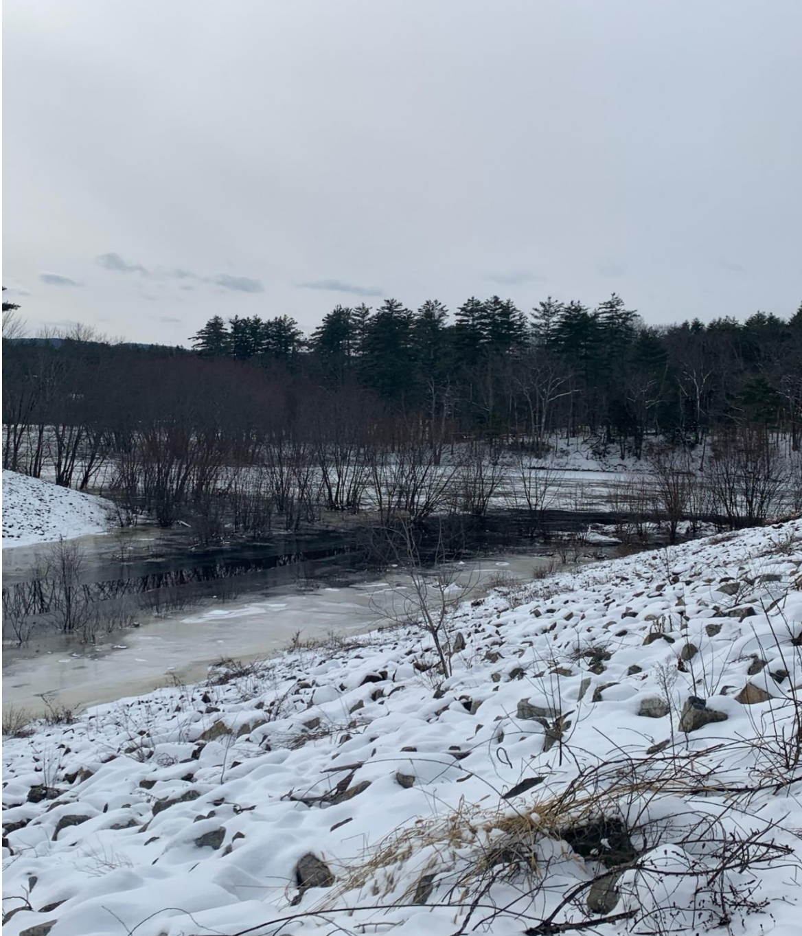
Exhibit D: Work area – The photo shows the work area slightly inundated with water. Work shall be done when water levels return to normal winter pool levels when travel on the flat rip rap floor is possible.