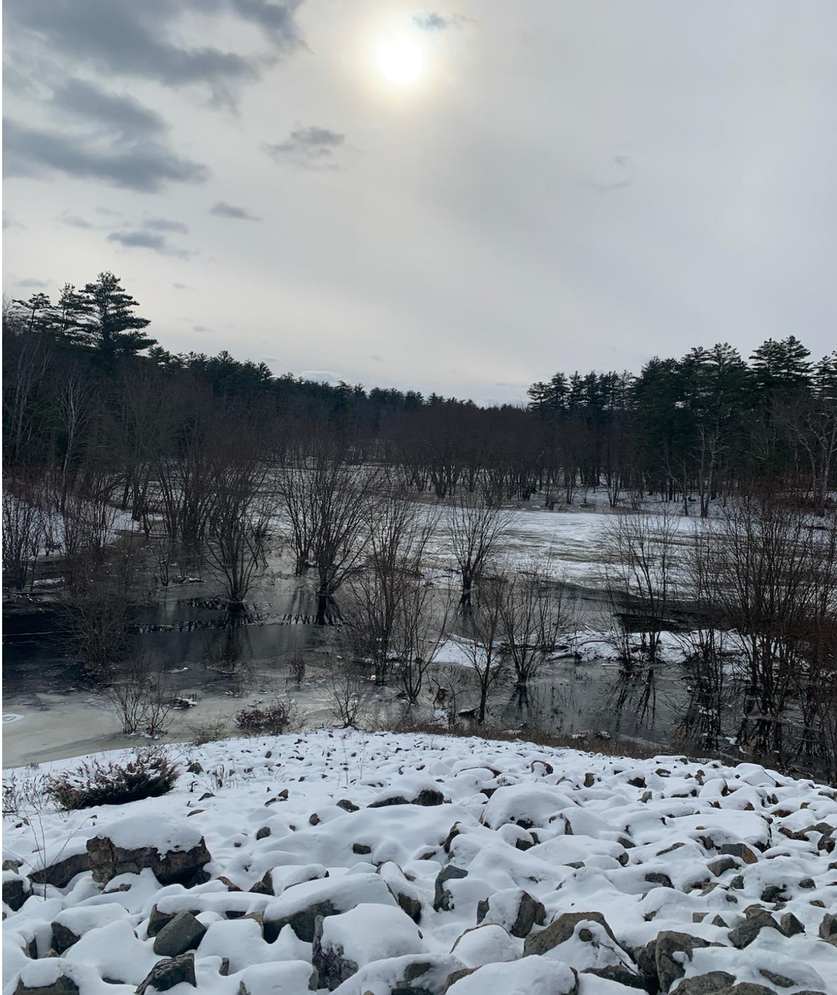
Exhibit E: Work area photo #2.