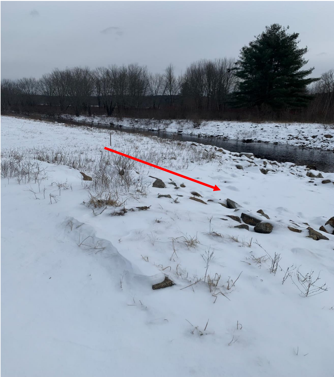
Exhibit H: Downstream work area access “ramp” onto the flat rip rap floor of the canal nearest the park road access.