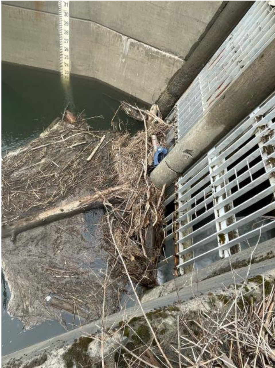
Informational Photo 3: Debris in the intake at Union Village Dam. Picture taken April 3, 2024