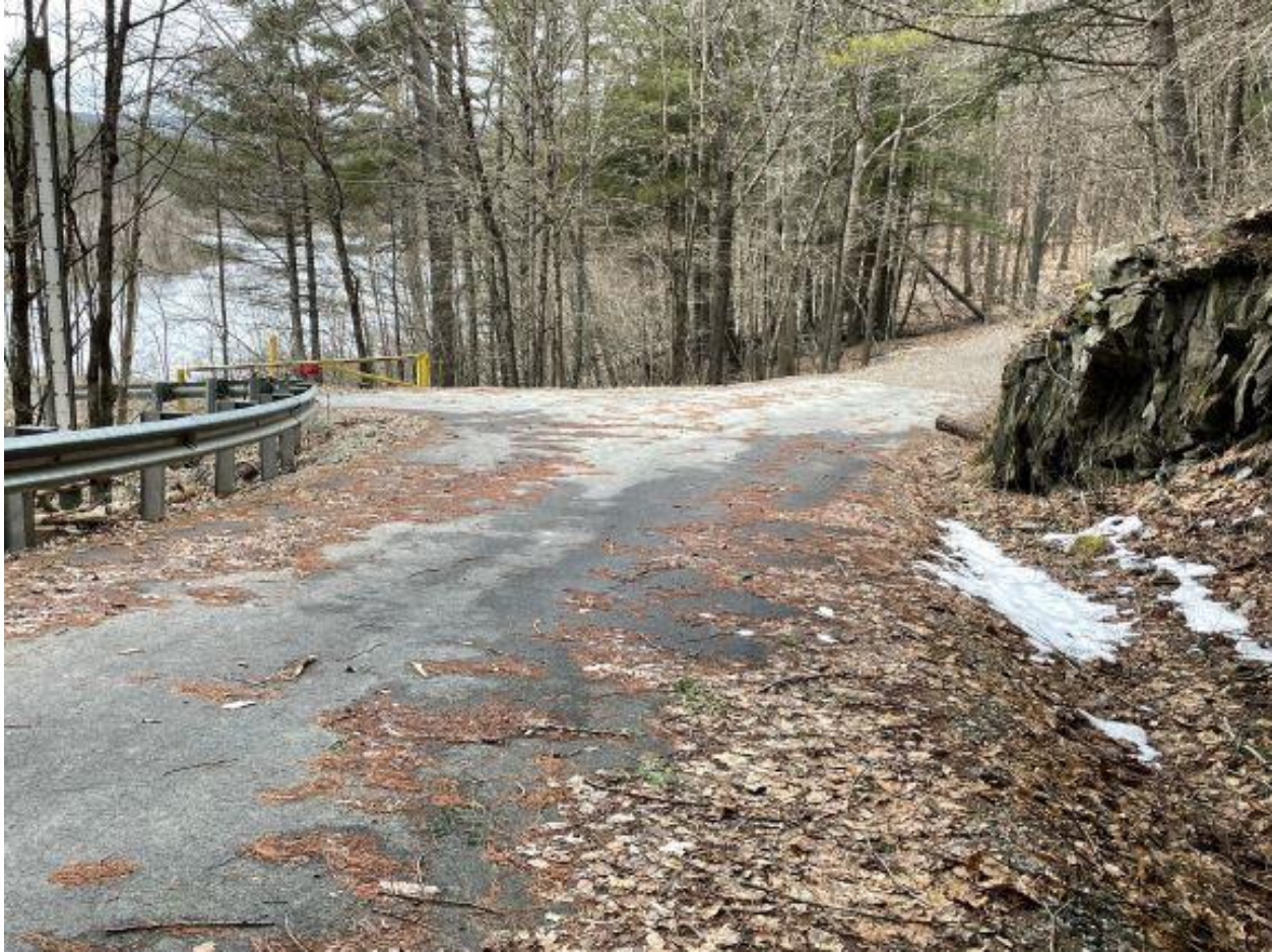
Informational Photo 1: Access Road 45-degree turn showing guardrail, ledge, and road gate.