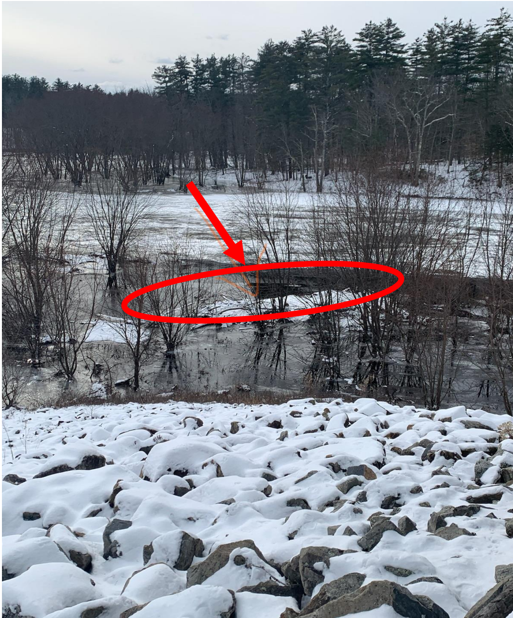
Exhibit F: Work area photo showing woody debris that is already downed and “piled” in the area indicated by the arrow. Any other debris similar to this shall be removed as well.