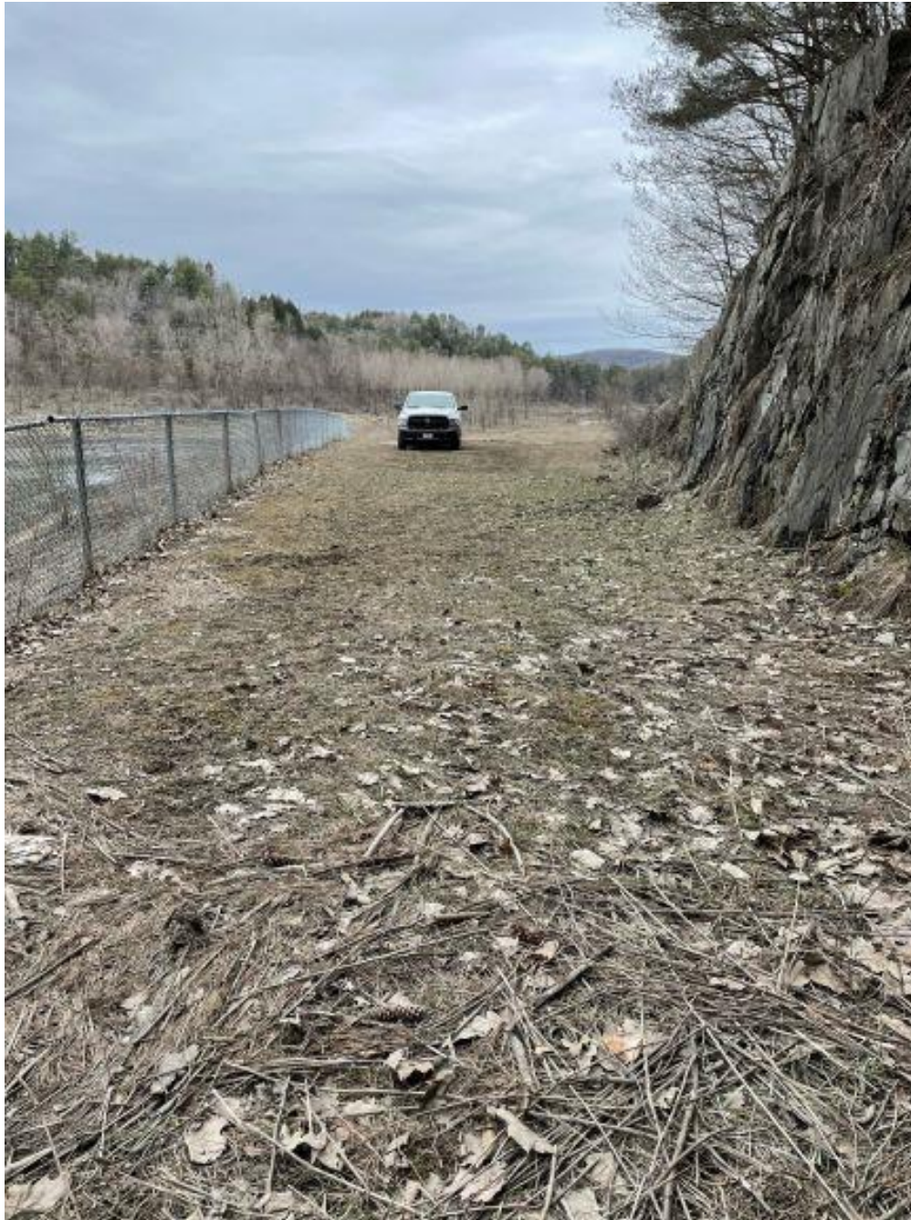
Informational Photo 2: Set up area for crane at intake