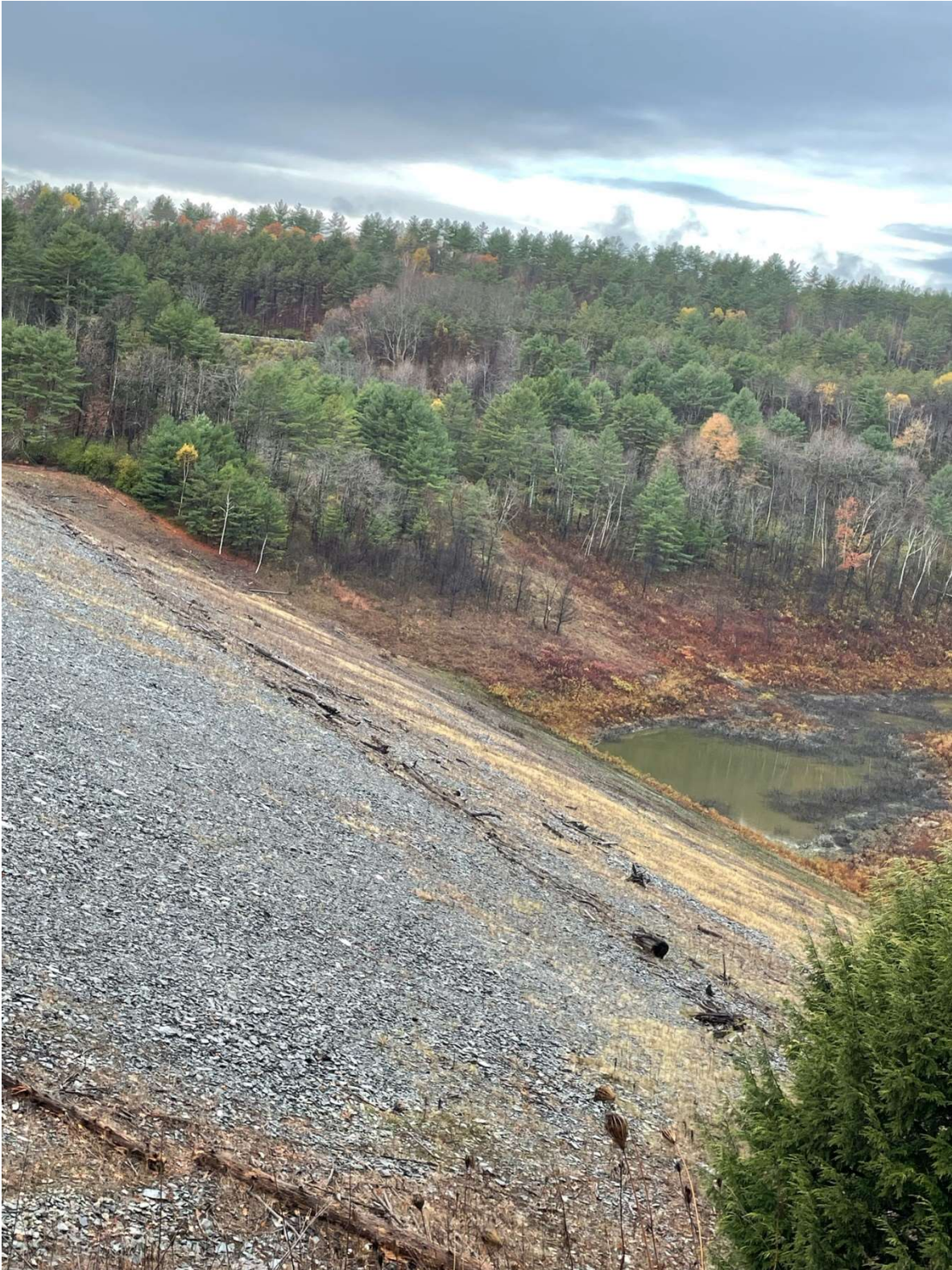
Informational Photo 2: Upstream face of the dam