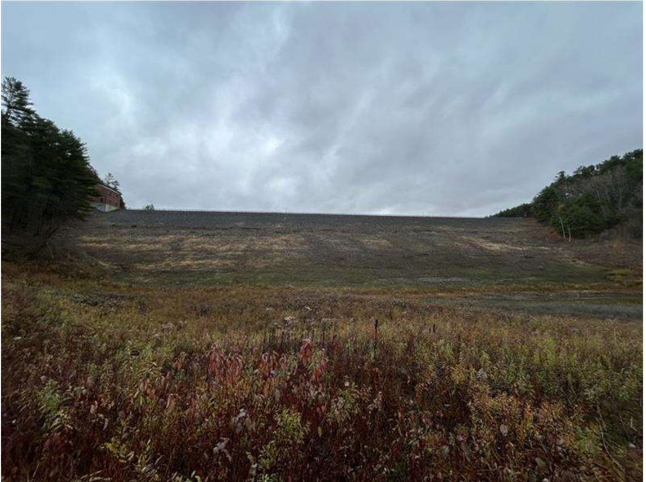
Informational Photo 3: Upstream face of the dam