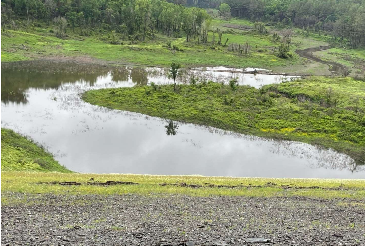
Informational Photo 1: Upstream face of the dam