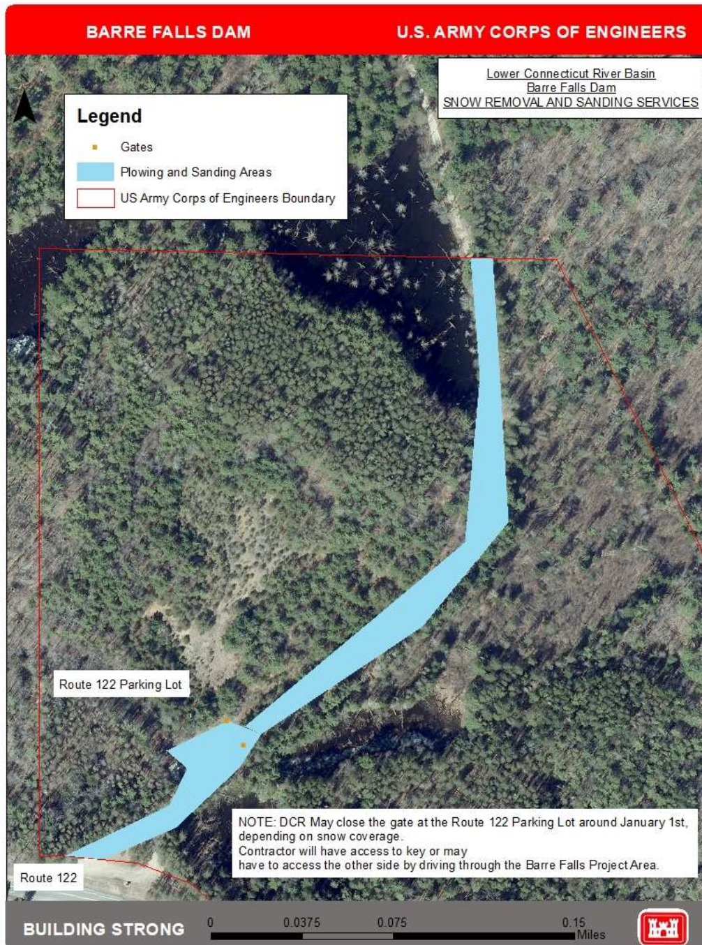
Figure 3: Plowing and sanding areas located in Compartment 2, situated off Route 122 in Oakham, MA. See Note.