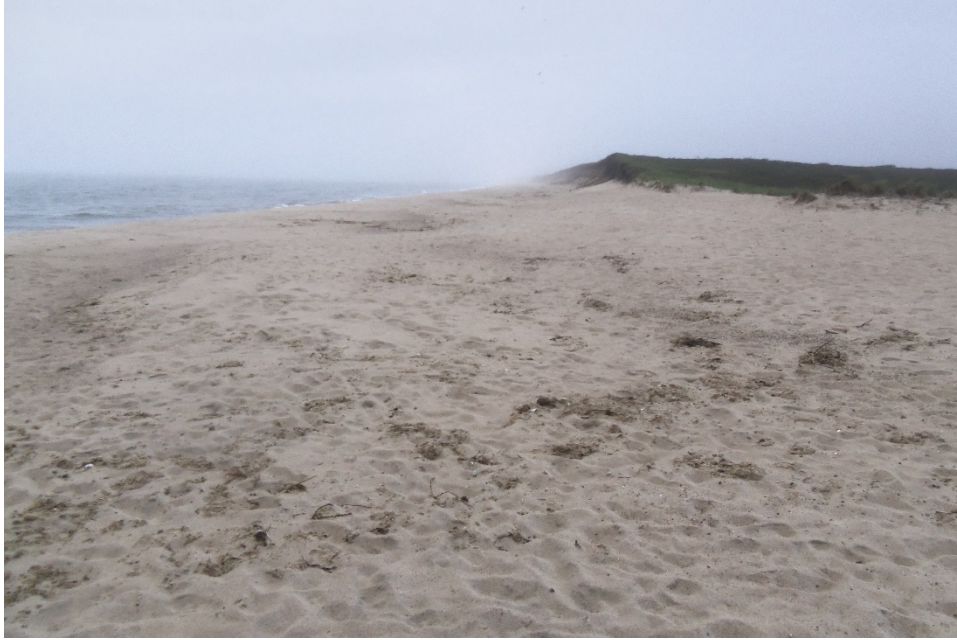
13: Looking west along beach from near West Forked Pond Valley sign