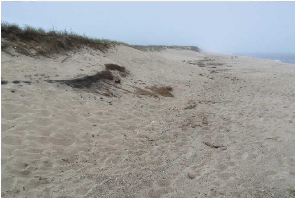
22: Looking east along beach from near Russel Way Road sign