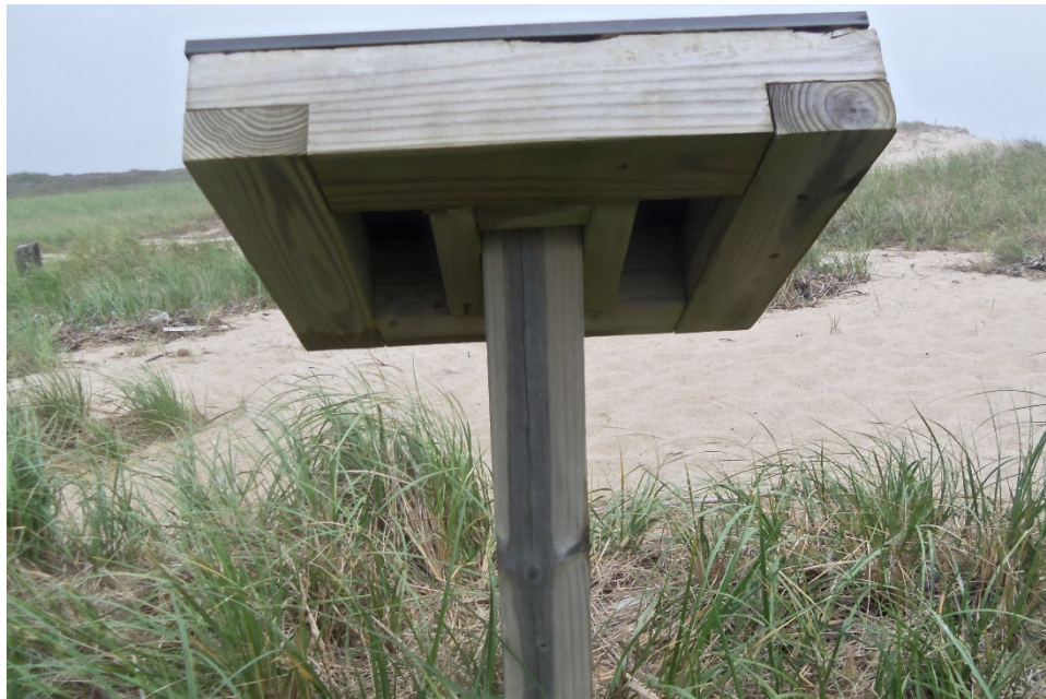
12: West Forked Pond Valley sign (back)