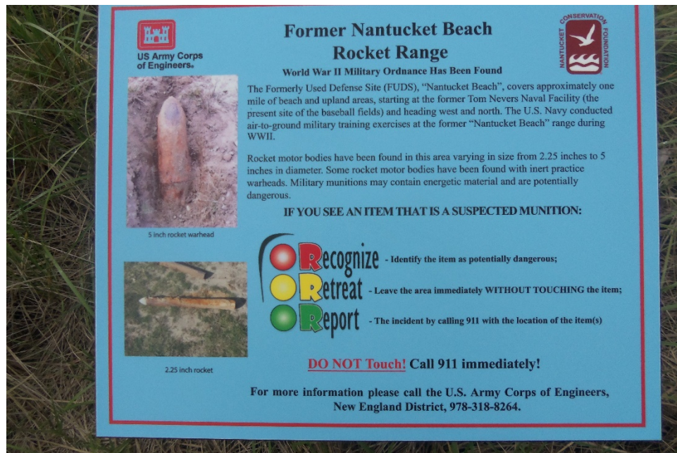
11: West Forked Pond Valley sign (closeup)