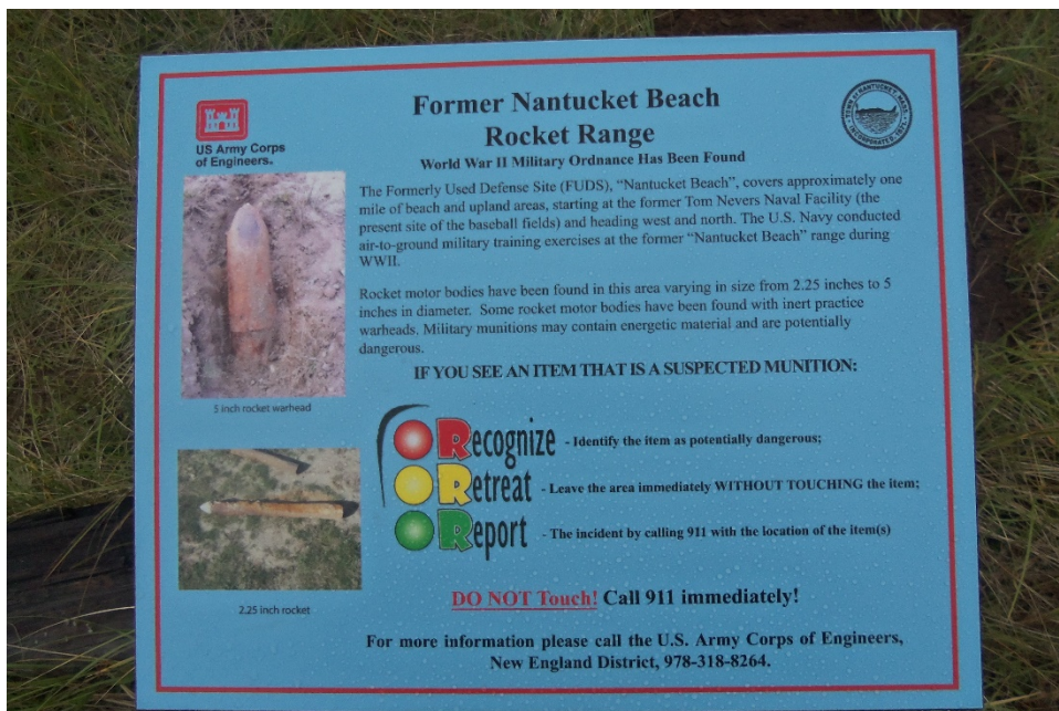
2: Tom Nevers Ball Field sign (wet conditions)