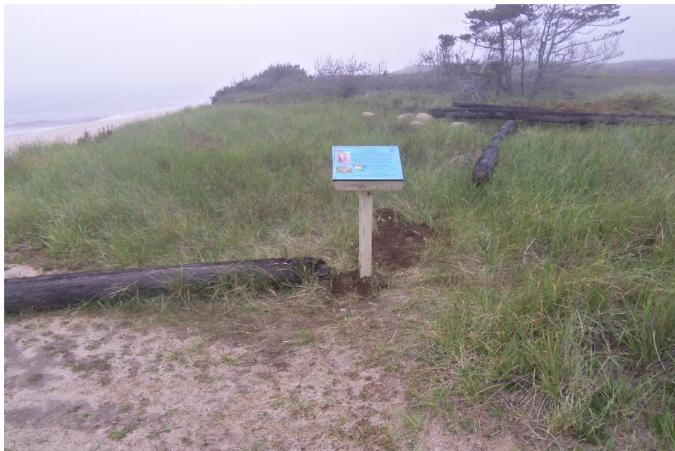
1: Tom Nevers Ball Field sign (new location, constructed June 3, 2021)