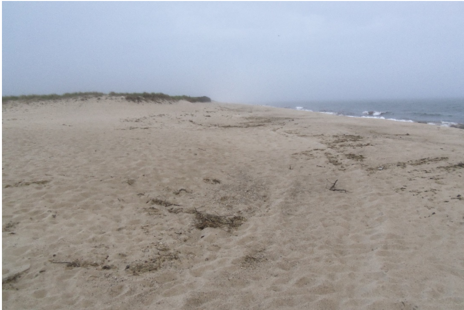
14: Looking east along beach from near West Forked Pond Valley sign