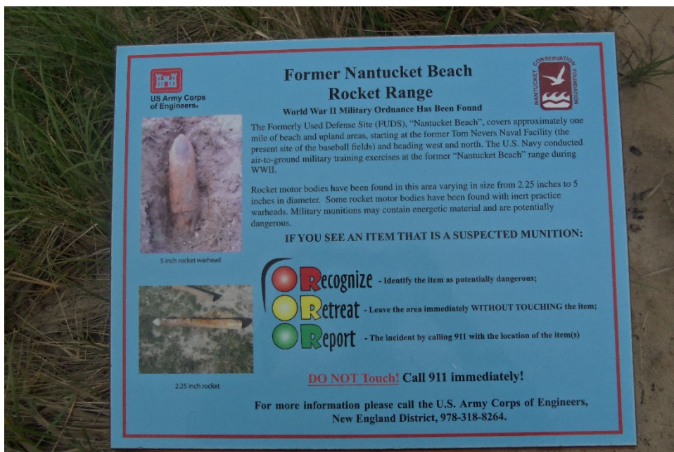
18: Russell Way Road sign (closeup)