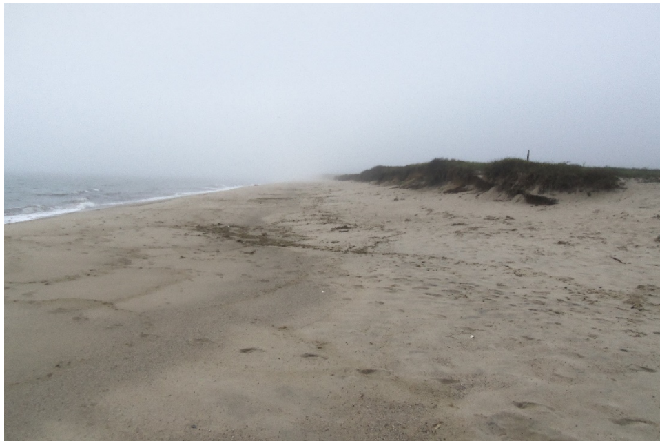
8: Looking west along beach from near East Forked Pond Valley sign