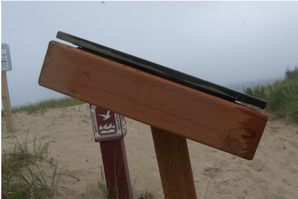
20: Side view of Russell Way Road sign, showing that text panel is becoming detached from wood.