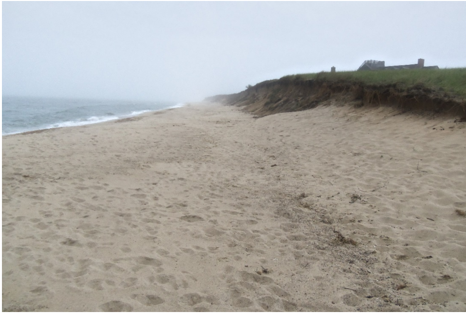
21: Looking west along beach from near Russel Way Road sign