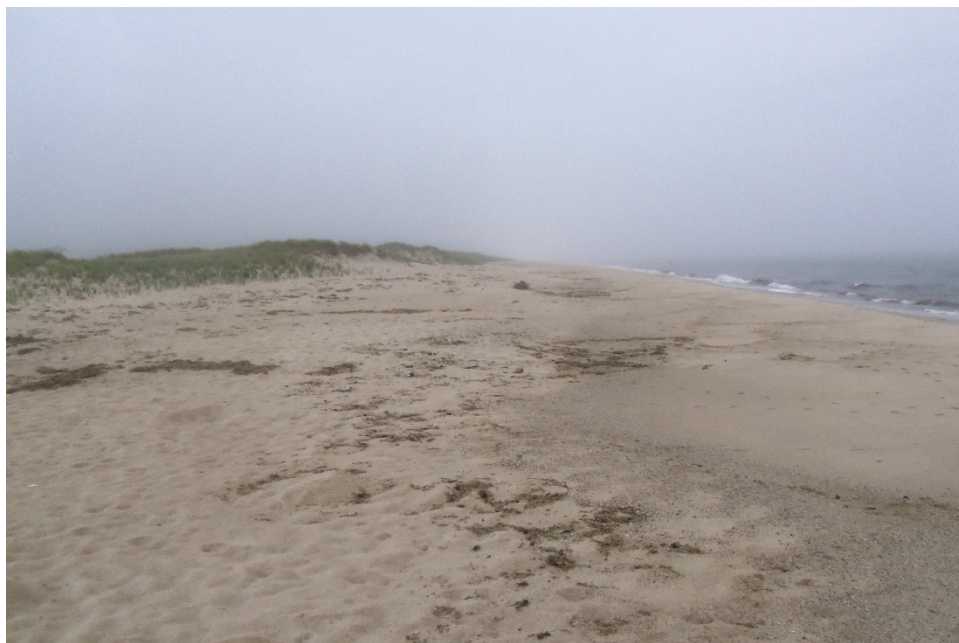
9: Looking east along beach from near East Forked Pond Valley sign