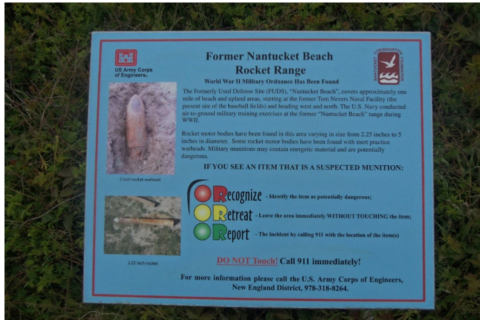
7: East Forked Pond Valley sign (closeup)