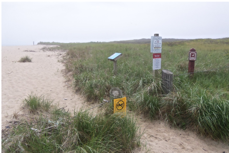
10: West Forked Pond Valley sign (general area)