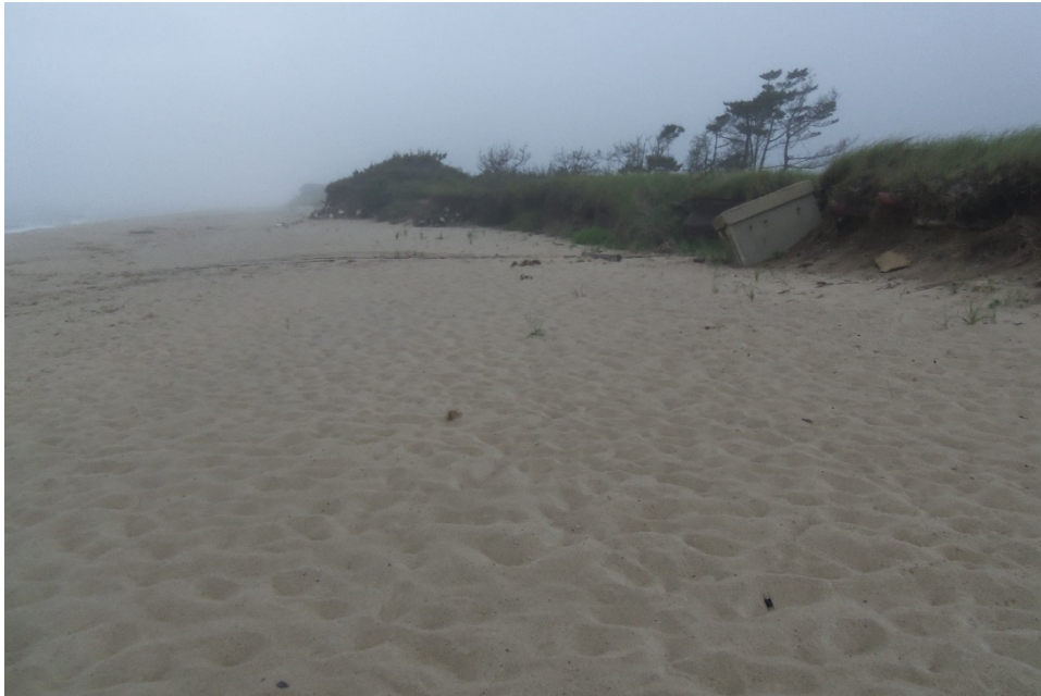
4: Looking west on beach near Tom Nevers Ball Field sign. Minimal erosion since October 2020.