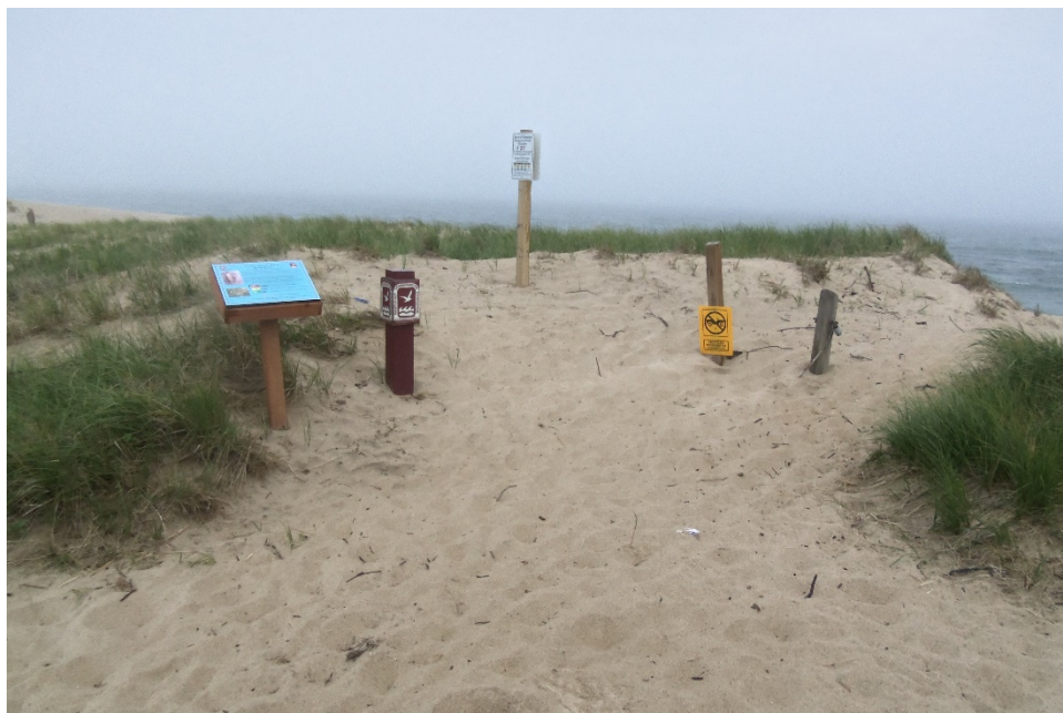
17: Russell Way Road sign (general area)