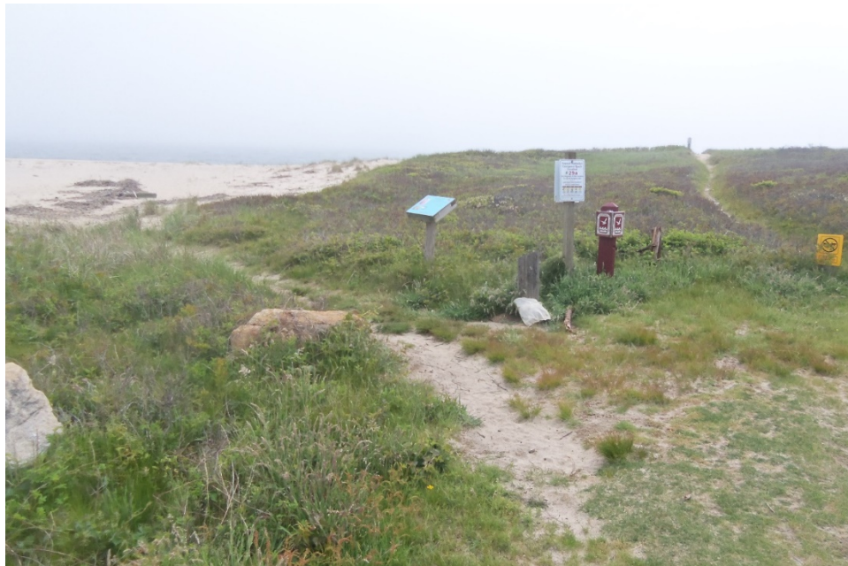
6: East Forked Pond Valley sign (general area)