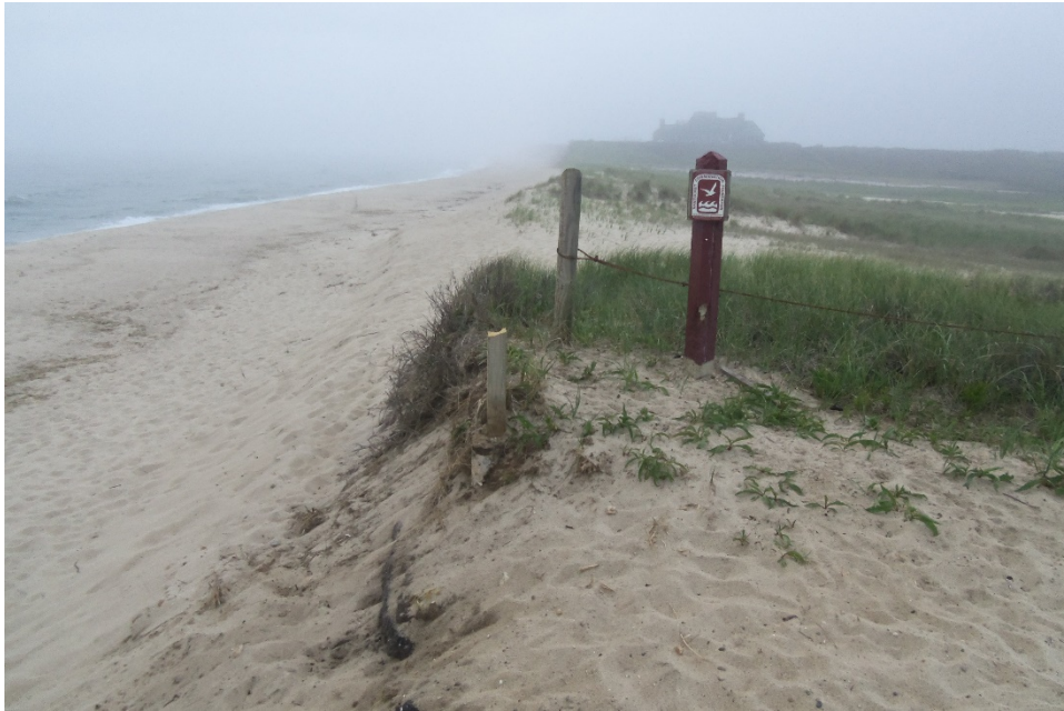
15: New South Road sign location, looking west - sign is cut off.