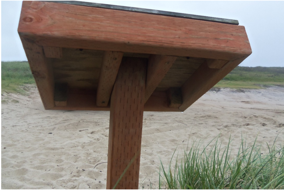
19: Russell Way Road sign (back)