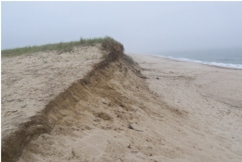
16: Looking east from New South Road sign location.