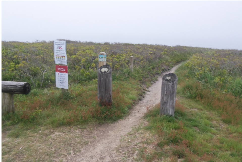
5: Land Bank Property sign (sawed off post, could not be replaced)