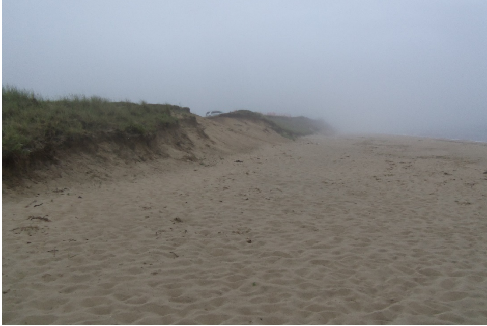
3: Looking east on beach near Tom Nevers Ball Field sign. Minimal erosion since October 2020.