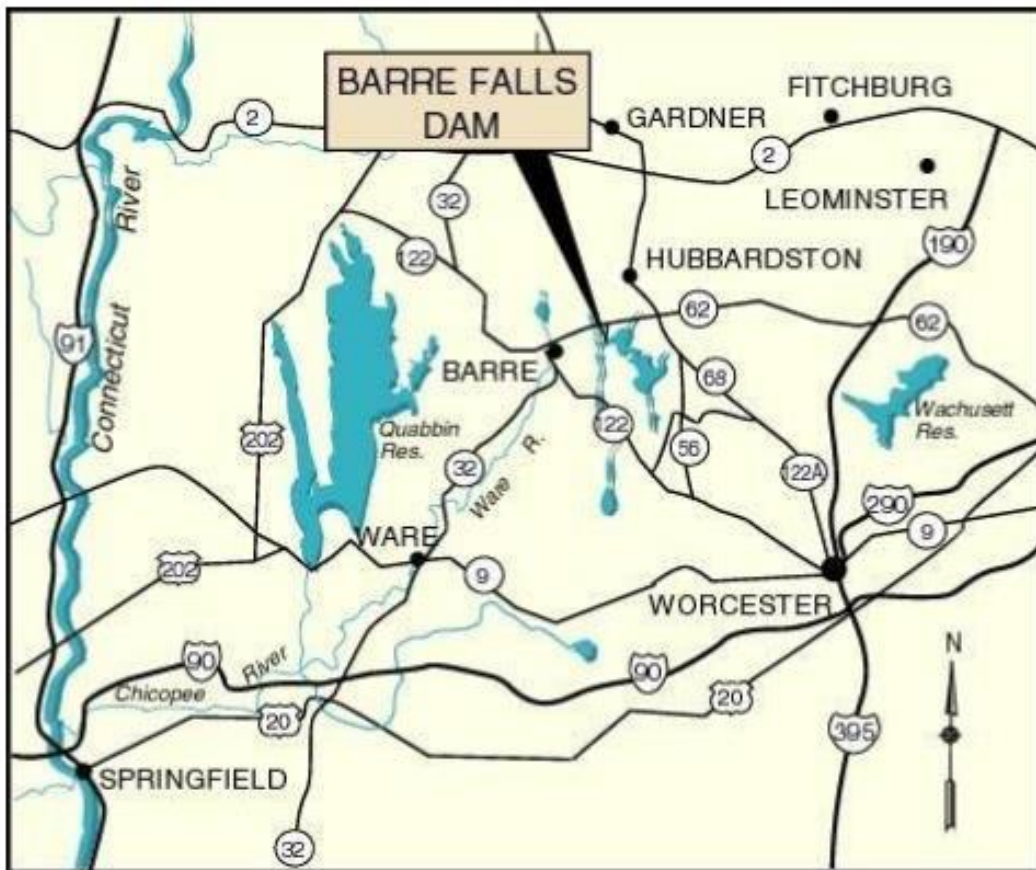
Exhibit A-1: Location Map