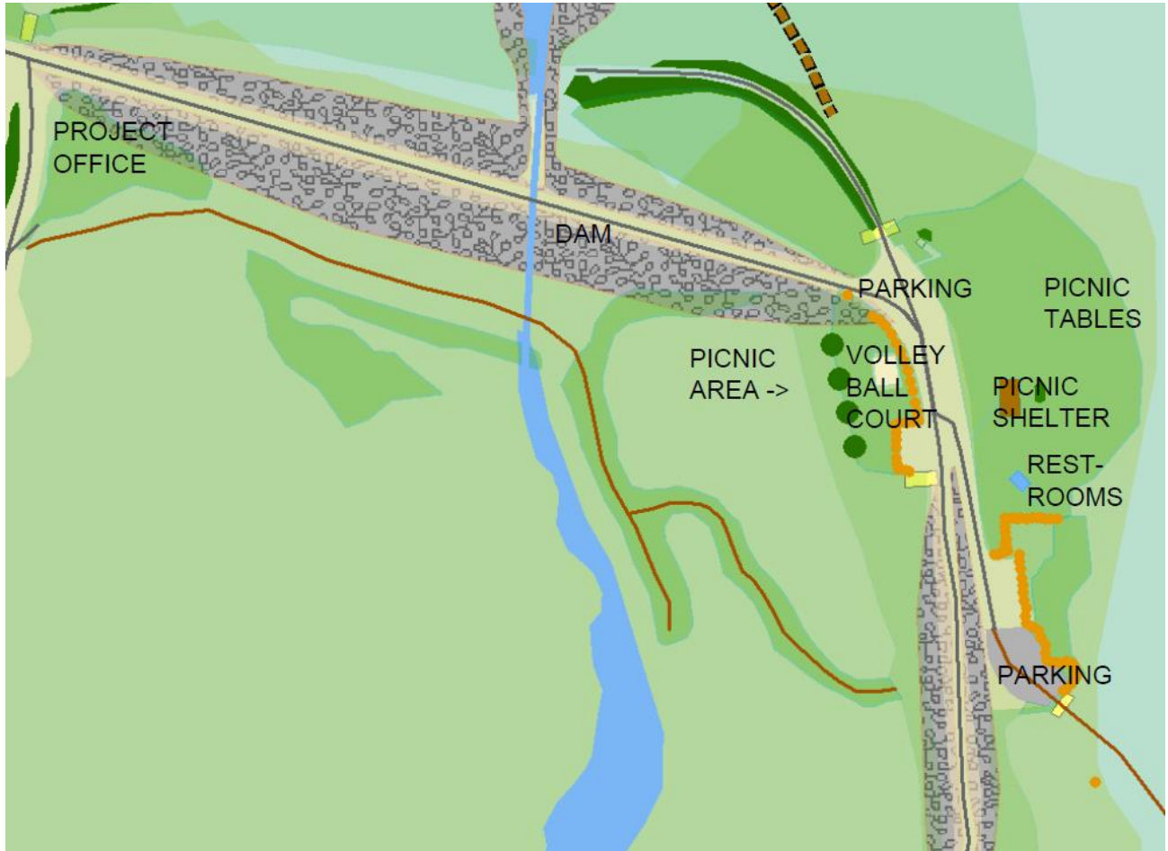
Exhibit A-2: Recreation Area Map