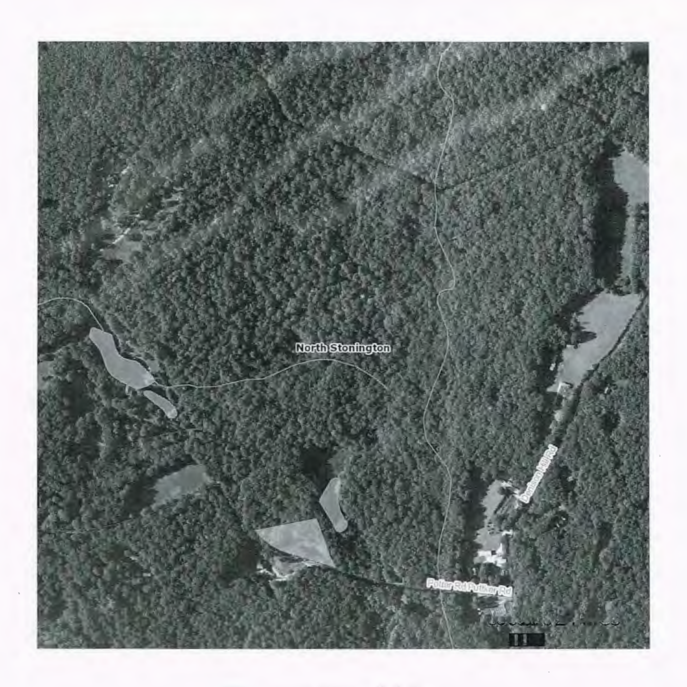
Figure 6 Aerial Green Fall Glen