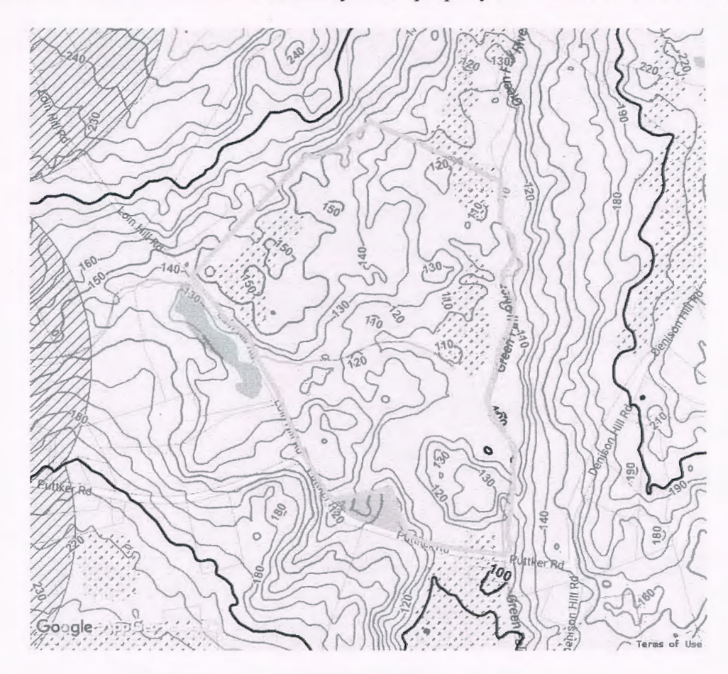
Figure 5 Locus Map Green Fall Glen

Streams and wetlands would be accessible by trail and road for the public to enjoy for recreation, education, and research. The 33 acre wetland is accessible for passive recreation by walking up a relatively level old road to the northern boundary of the property and over to Green Fall River.