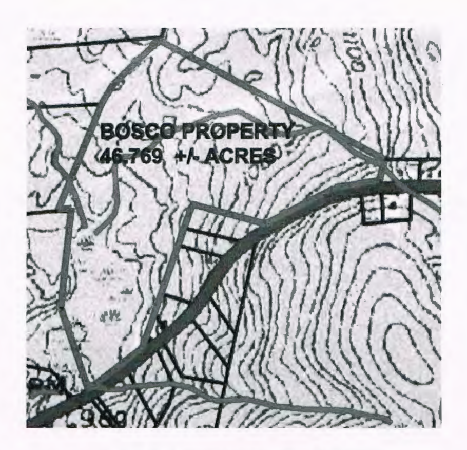
Figure 2 Locus Map of Bosco Property