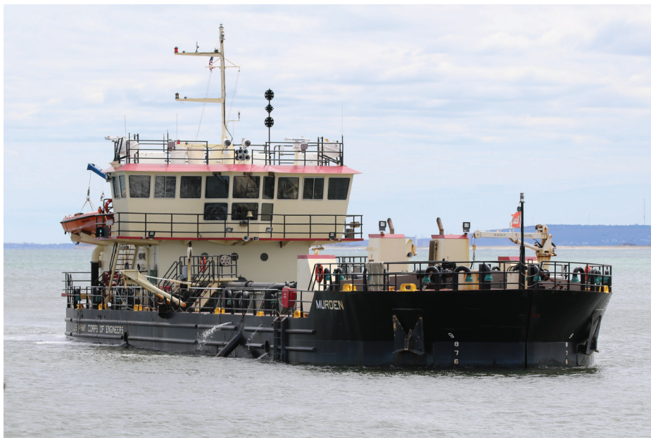
The USACE dredge MURDEN arrives to haul away material offsite.