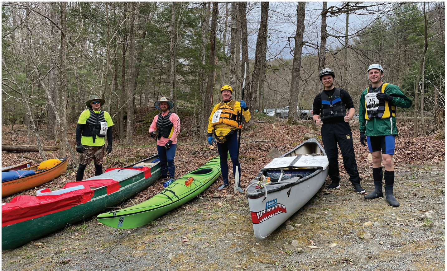
Paddlers meet at the start line for the expert race at Knightsville Dam.

"The event was a great success, and I was able to provide some great information to visitors and spectators," she said.