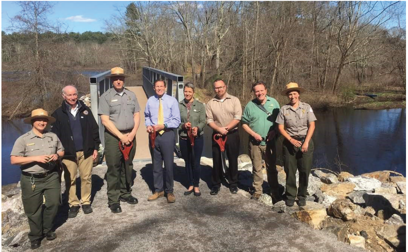
Ceremony participants pose for a picture during the Blain Bridge ribbon cutting ceremony.