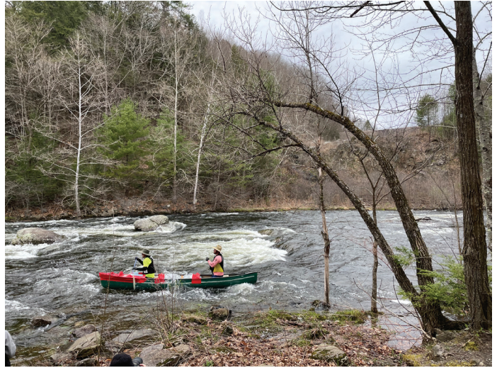
Race participants make their way down the Westfield River.