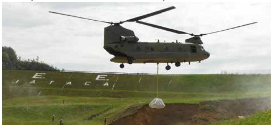
The Army National Guard places sandbags at the Guajataca Dam.