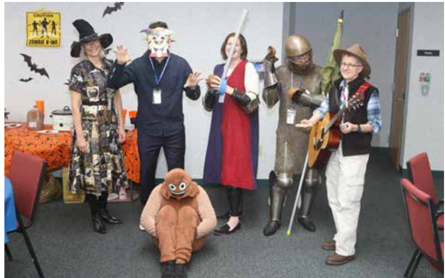
Costumed participants of the Halloween Potluck pose for a picture.

New England District team members who are retiring may request to be placed on the Yankee Engineer Digital Mailing list. Subscribers will get an e-mail informing them when the next issue of the Yankee Engineer is available for viewing. Those interested may send their personal e-mails to the editor at annmarie.r.harvie@usace.army.mil .