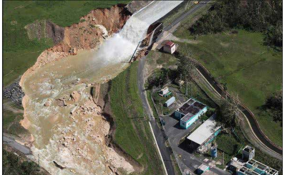
An aerial view of the Guajataca Dam in Puerto Rico.

The dam is located in the mountainous jungle typical of the Island's interior region with approximately 200 homes that lie within the downstream flood plain. The storm downed trees and power lines, crippled cell towers and caused landslides and