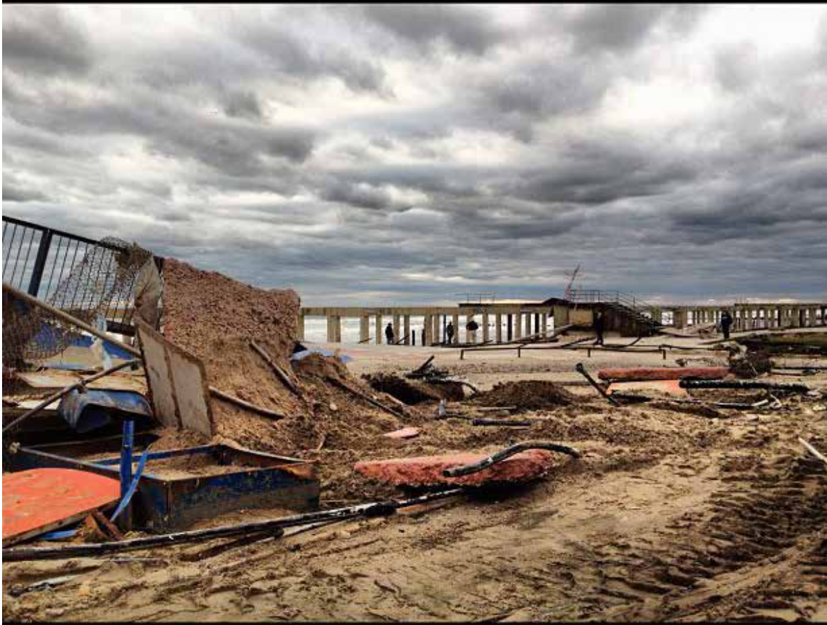
Superstorm Sandy laid waste to much of the Northeast coast to include this New York Beach in November 2012. The Corps of Engineers has been working hard ever since to repair the damage the storm created. One such project is the recently completed Camp Cronin in Rhode Island.

First Class U.S. Postage Paid Concord, MA Permit No. 494