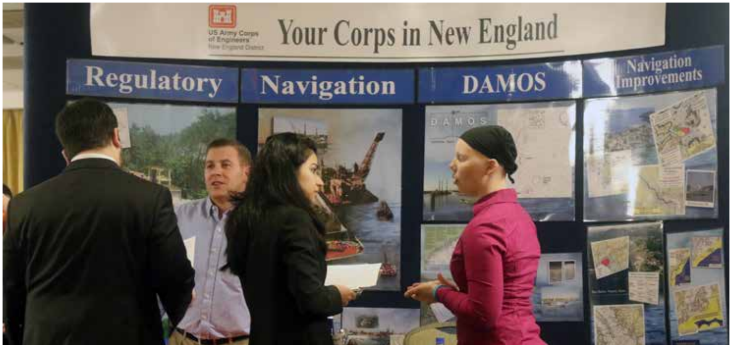
New England District team members host an information booth and answer questions from the public.